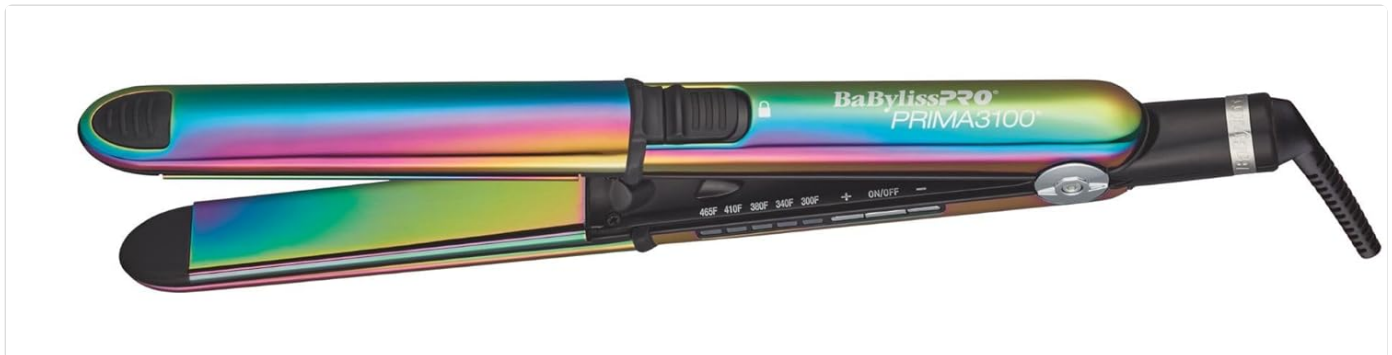
Image: The BaBylissPRO Nano Titanium Prima Ionic Hair Straightener in its iridescent finish, shown in a closed position.

This manual provides comprehensive instructions for the safe and effective use of your BaBylissPRO Nano Titanium Prima Ionic Hair Straightener. This professional styling tool is designed for both straightening and curling hair, utilizing IonMultiplier Technology and Nano Titanium plates for efficient heat transfer, smoothing, conditioning, and shine.