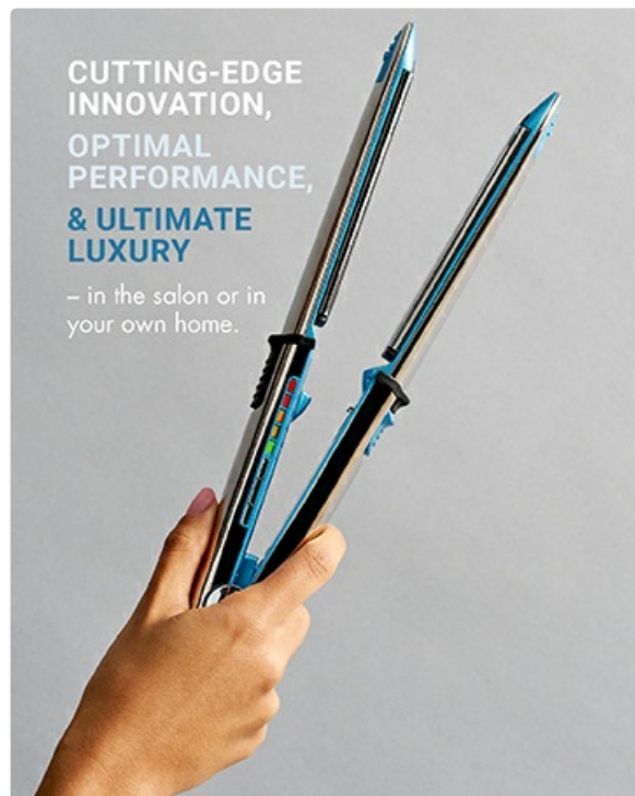
Image: A stylist demonstrating the "clip, flip, pull" technique with the BaBylissPRO Prima styling iron to create effortless curls and waves.