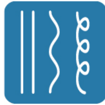
Straighten, Wave & Curl