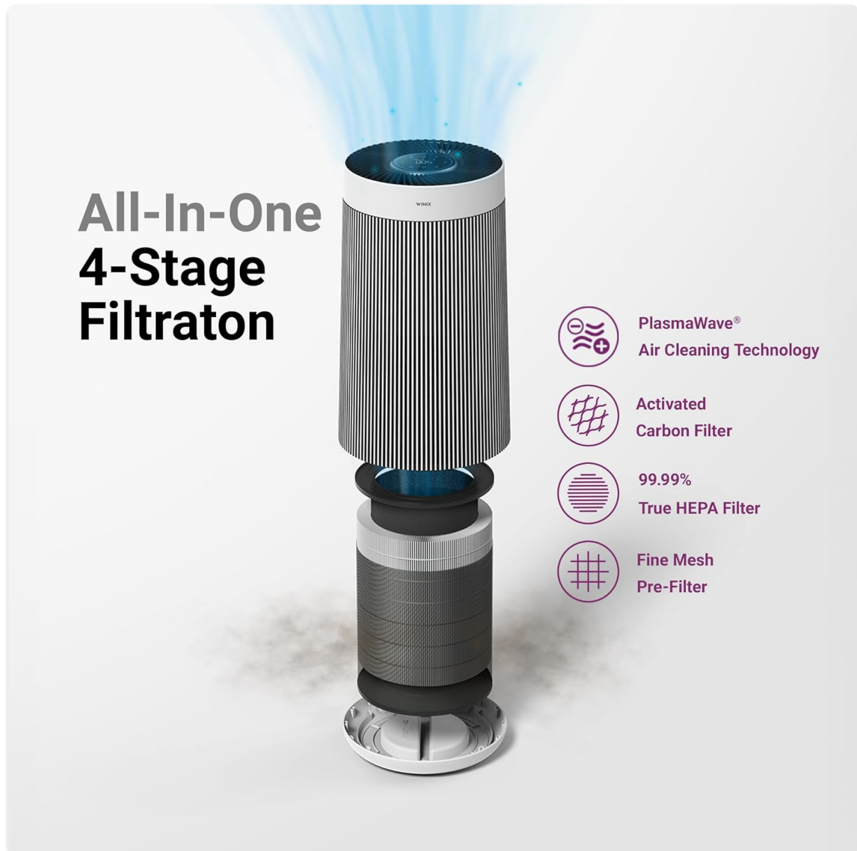
Figure 2: Exploded view showing the 4-stage filtration system, including the Fine Mesh Pre-Filter, True HEPA Filter, and Activated Carbon Filter.