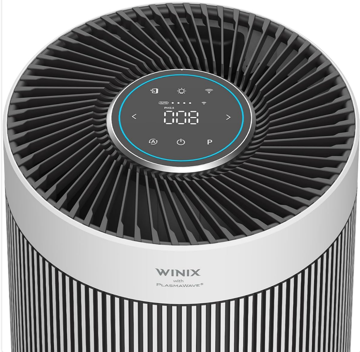
Figure 3: Detailed view of the Winix T810 control panel with digital display.