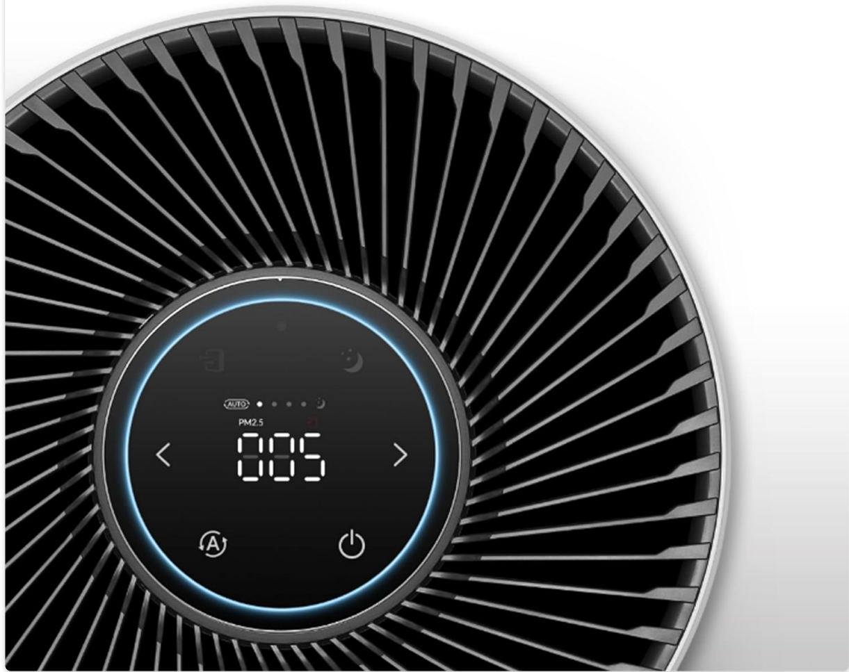
Figure 7: The filter is easily removed from the bottom of the unit for replacement.

Vivid Color LED & Accurate PM2.5 Display