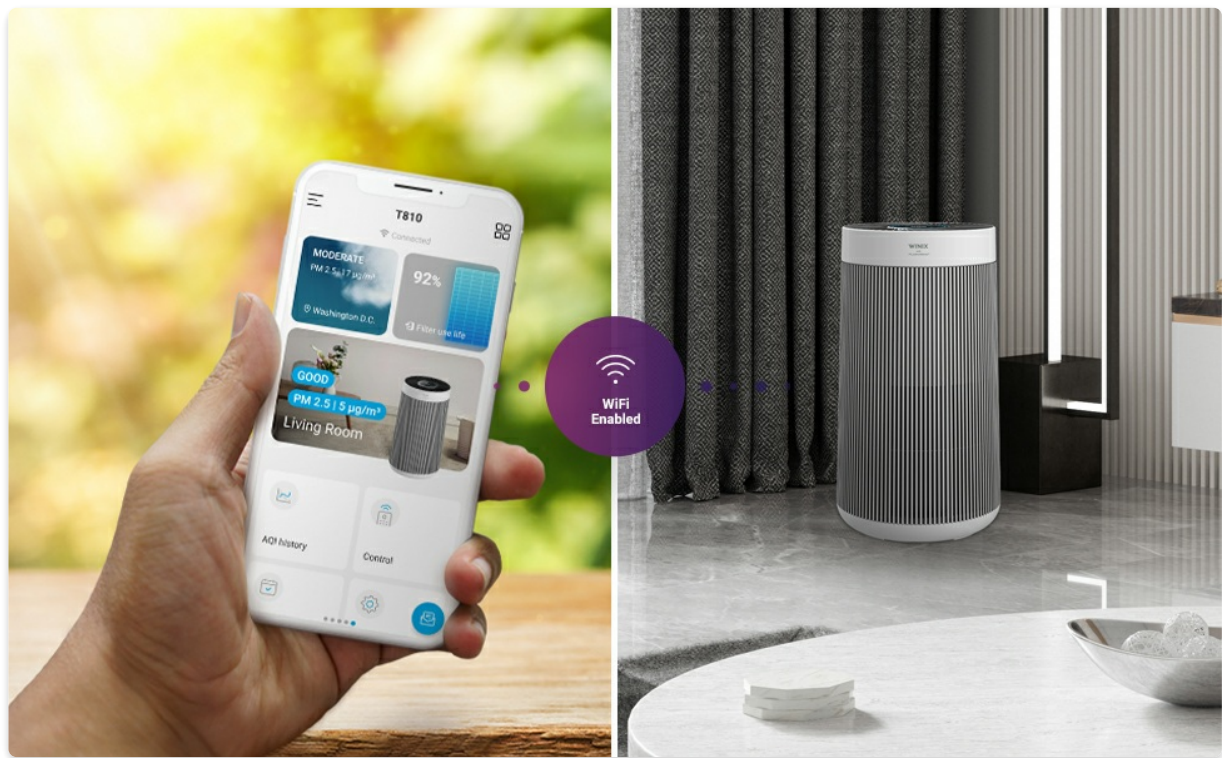
Figure 6: The Winix Smart App provides comprehensive control and monitoring capabilities for your air purifier.

Video 1: Official Winix video demonstrating the T810's features and large room coverage.