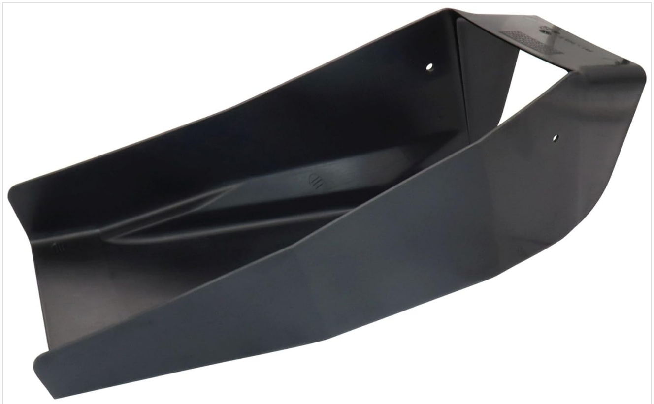
Figure 4: Angled view of the SECURA Ejection Chute, showing the discharge opening. This perspective demonstrates the width and depth of the chute's exit point, crucial for effective grass expulsion.