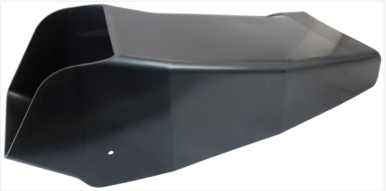
Figure 1: Main view of the SECURA Ejection Chute. This image shows the overall shape and design of the replacement part, highlighting its smooth, dark grey surface and the general contour for grass discharge.