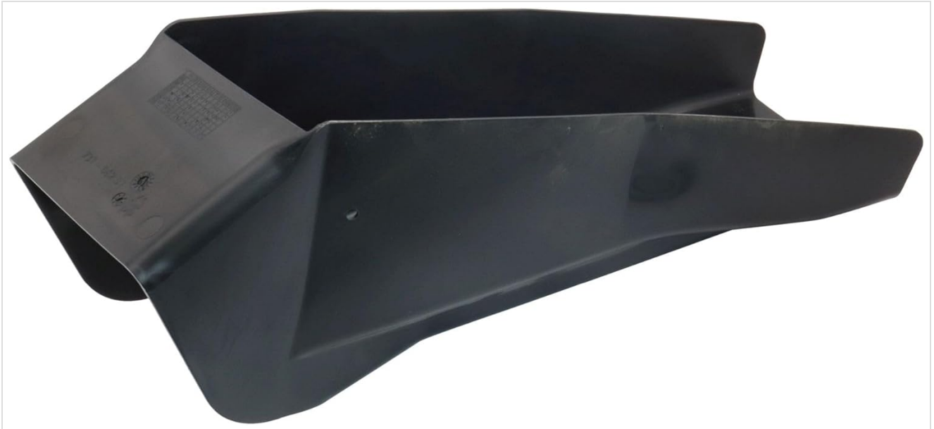
Figure 3: Underside view of the SECURA Ejection Chute. This image highlights the internal structure and potential mounting points or guides for secure attachment to the lawn tractor's cutting deck.