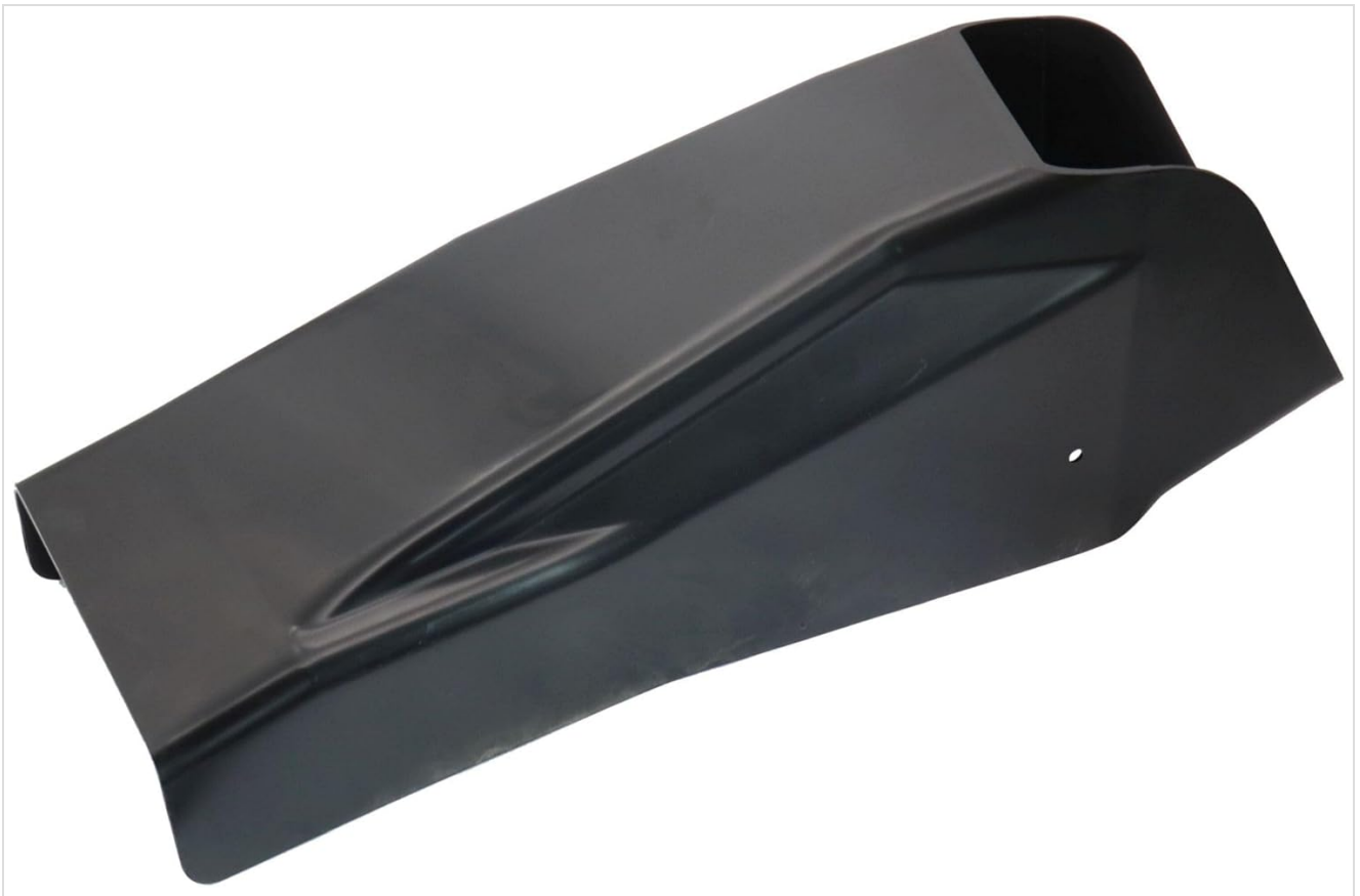
Figure 2: Side profile of the SECURA Ejection Chute. This view illustrates the curved design and the angle at which grass clippings are directed, ensuring efficient and unobstructed flow.