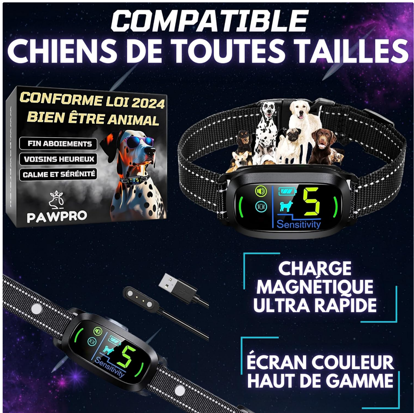
Image: The PAWPRO Bark Control Collar shown with its magnetic charging cable, illustrating its compatibility with various dog breeds and sizes, from 2kg to 70kg.

Proper fit is crucial for the collar's effectiveness and your dog's comfort. The collar should be snug enough that two fingers can fit comfortably between the collar and your dog's neck. Ensure the sensor unit is positioned centrally on your dog's throat.