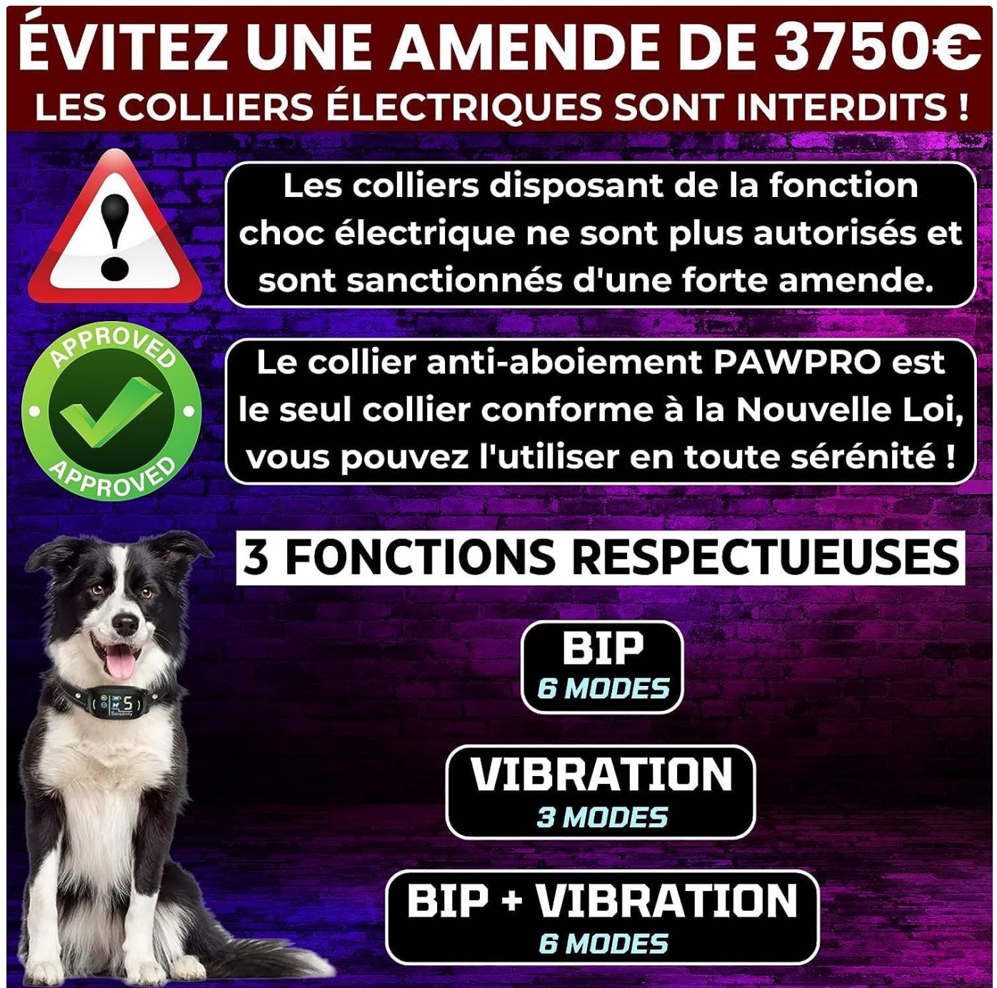
Image: The PAWPRO Bark Control Collar highlighting its three respectful functions: BIP (sound), Vibration, and BIP+Vibration, each with multiple modes for gradual training.

These functions activate gradually through an automatic learning program, designed to help your dog learn to reduce excessive barking without discomfort.