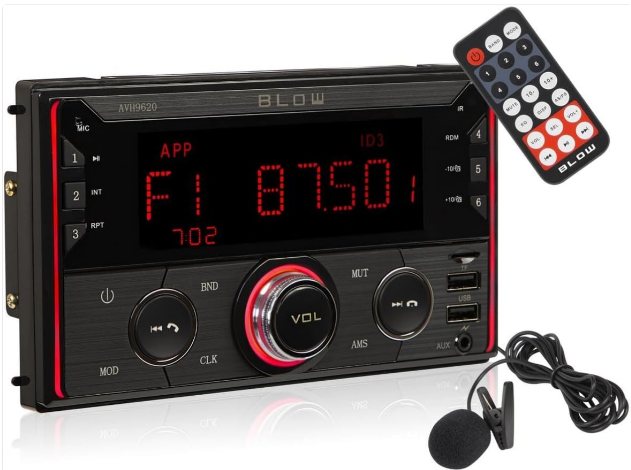
Figure 1: Front view of the BLOW Autoradio 78-335# showing the display, control buttons, USB, AUX ports, and included remote control and microphone.