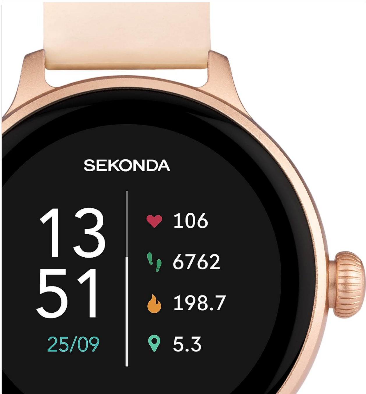
Image: Close-up of the smartwatch display, highlighting heart rate (106 bpm), steps (6762), and calories burned (198.7).