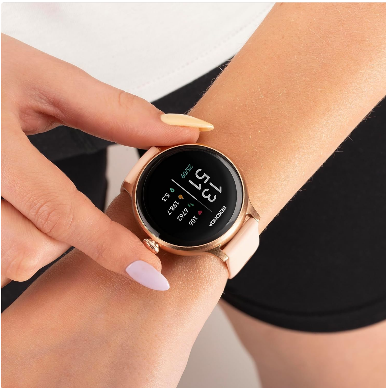
Image: A hand with painted nails gently touching the screen of the Sekonda Connect Smart Watch, demonstrating interaction with the display.