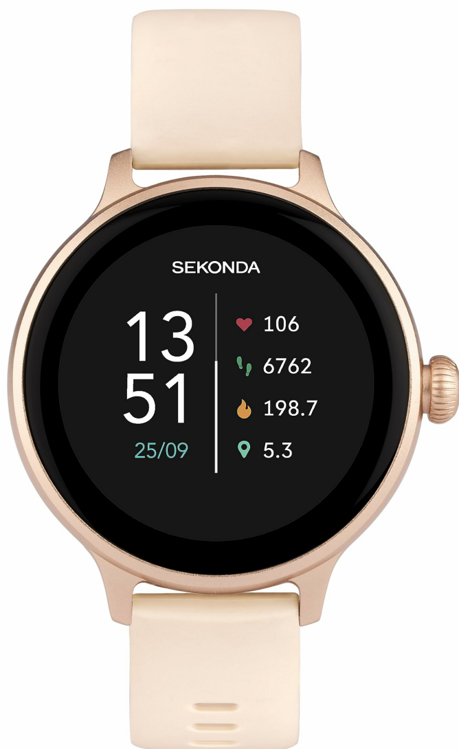
Image: Front view of the Sekonda Connect Smart Watch, showing the digital display with time, heart rate, steps, calories, and distance.

The Sekonda Connect Smart Watch is designed to assist you in monitoring your daily activities, health metrics, and staying connected. It features a 1.1-inch AMOLED display, various sports modes, health tracking capabilities, and smart notifications.