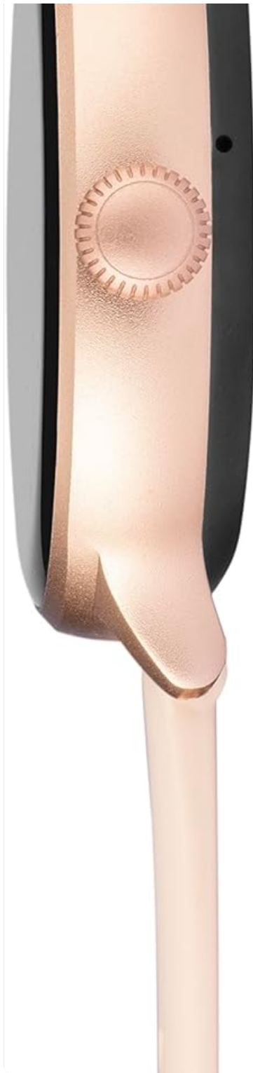
Image: Side view of the Sekonda Connect Smart Watch, highlighting the rotating crown and the connection point for the silicone strap.