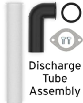
Discharge Tube Assembly

All components included with the InSinkErator Evolution 0.75HP garbage disposal.