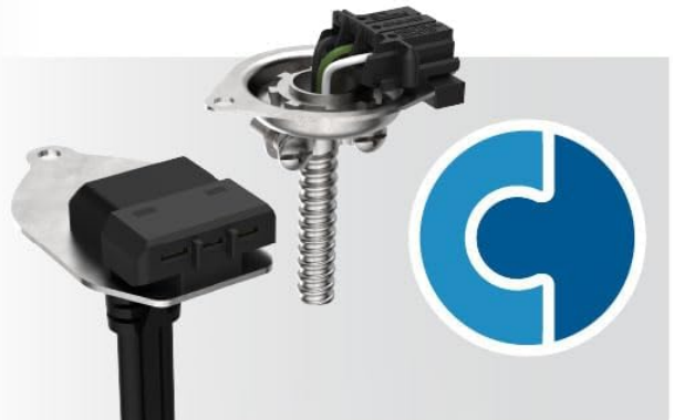
Illustration of EZ Connect features and Lift and Latch technology for simplified installation.

Simplified connections for hardwire and outlet set-ups.