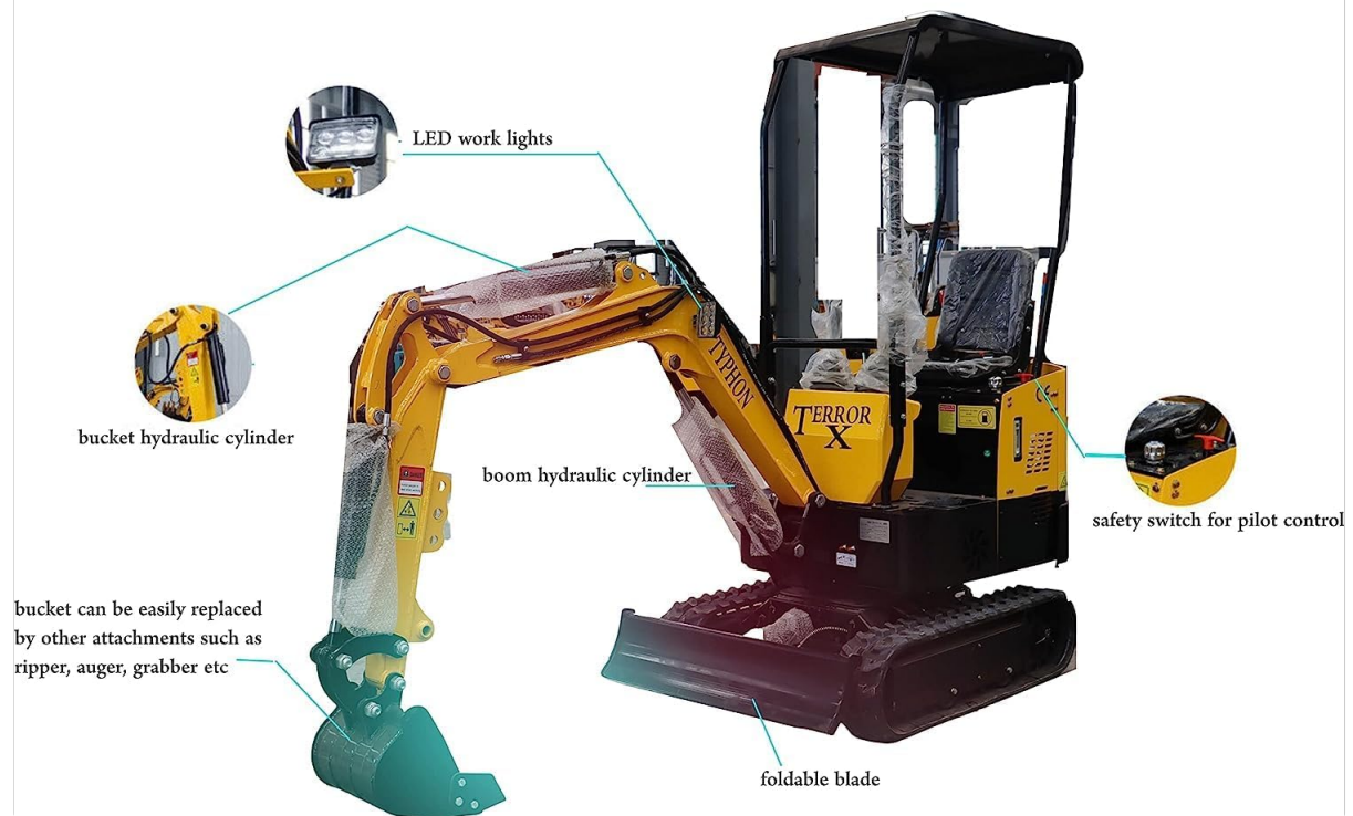
Figure 2: Key Features of the Terror X Storm