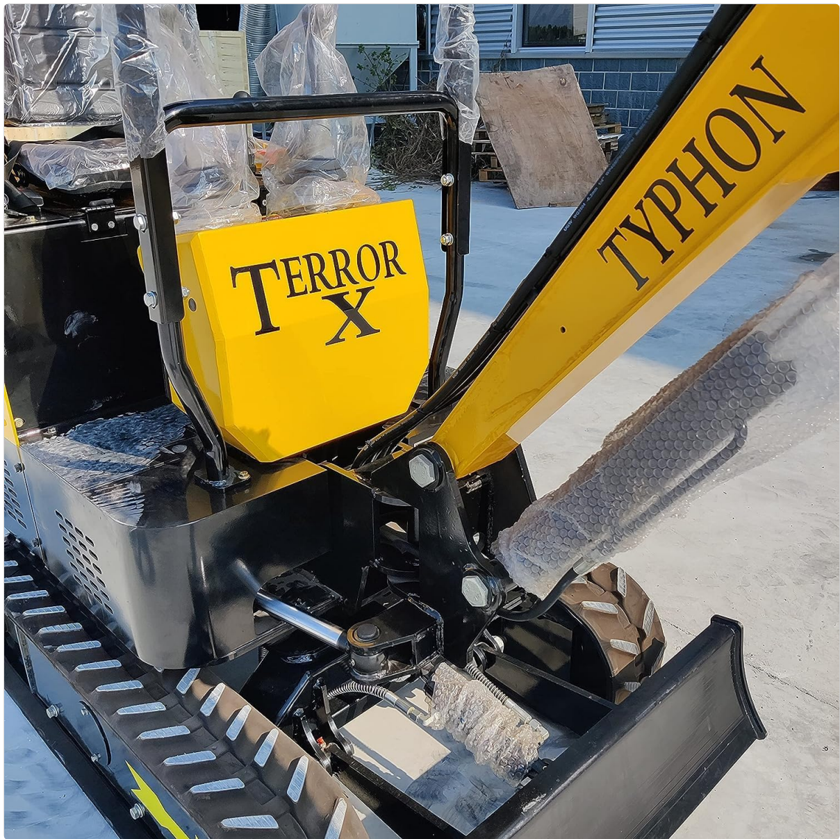
Figure 4: Excavator Control Panel