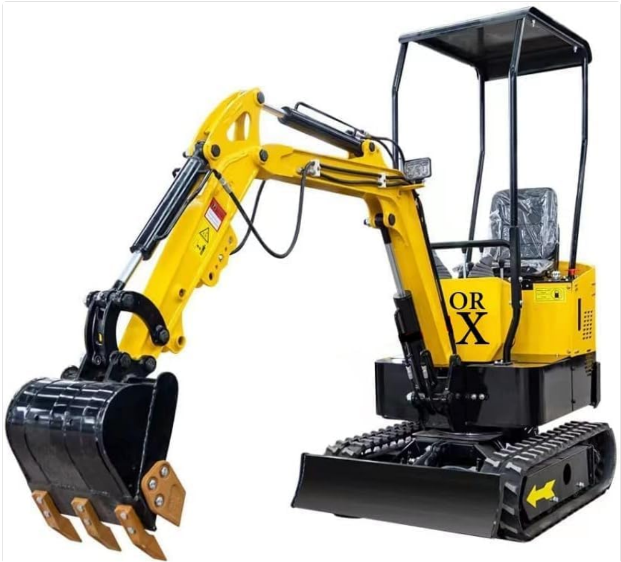
Figure 1: TYPHON Terror X Storm Mini Excavator