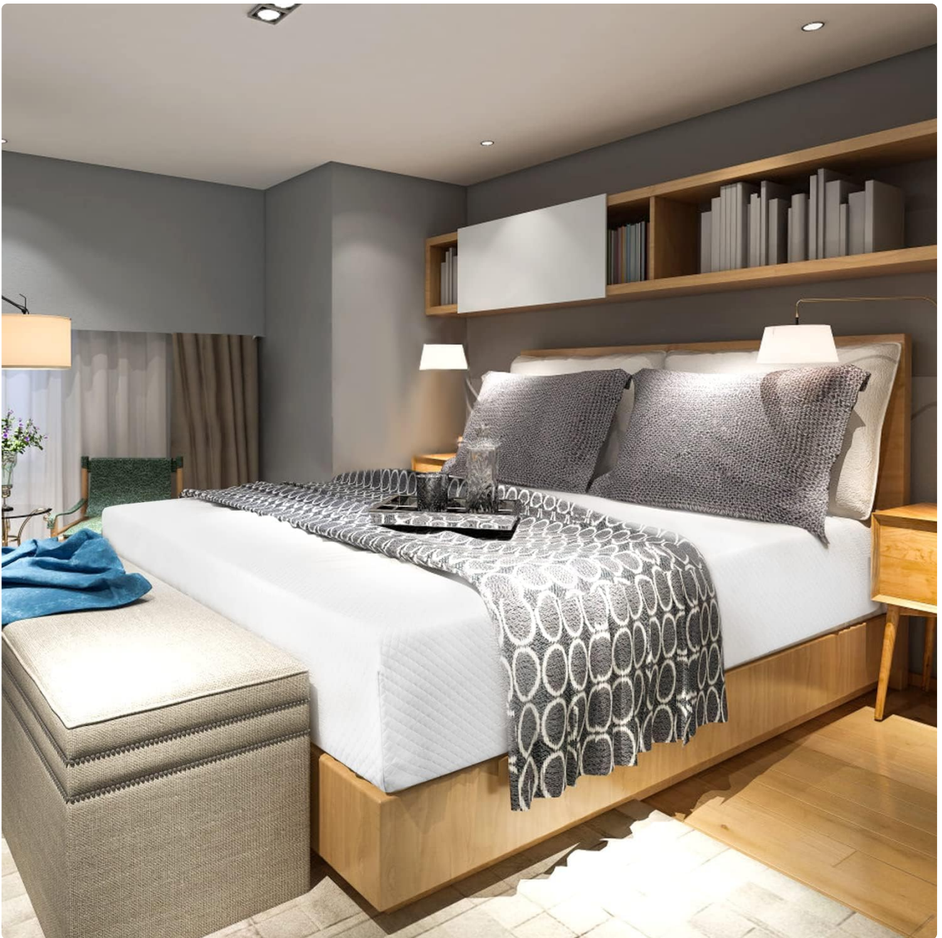
Image: NChanmar 8 Inch King Gel Memory Foam Mattress in a modern bedroom setting, showcasing its white cover and comfortable appearance.