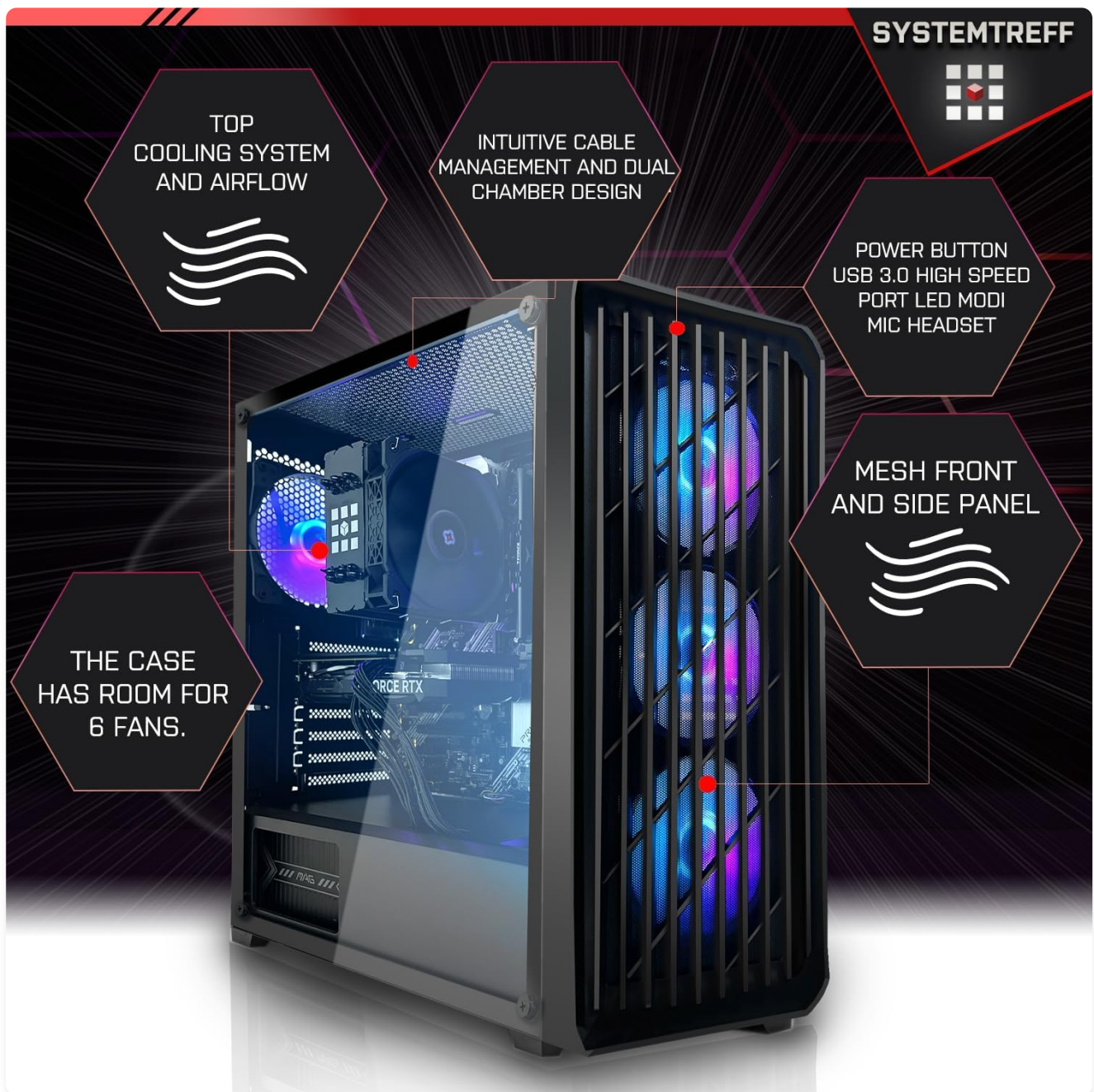
Image: The PC case highlighting its cooling system, cable management, and front panel features.