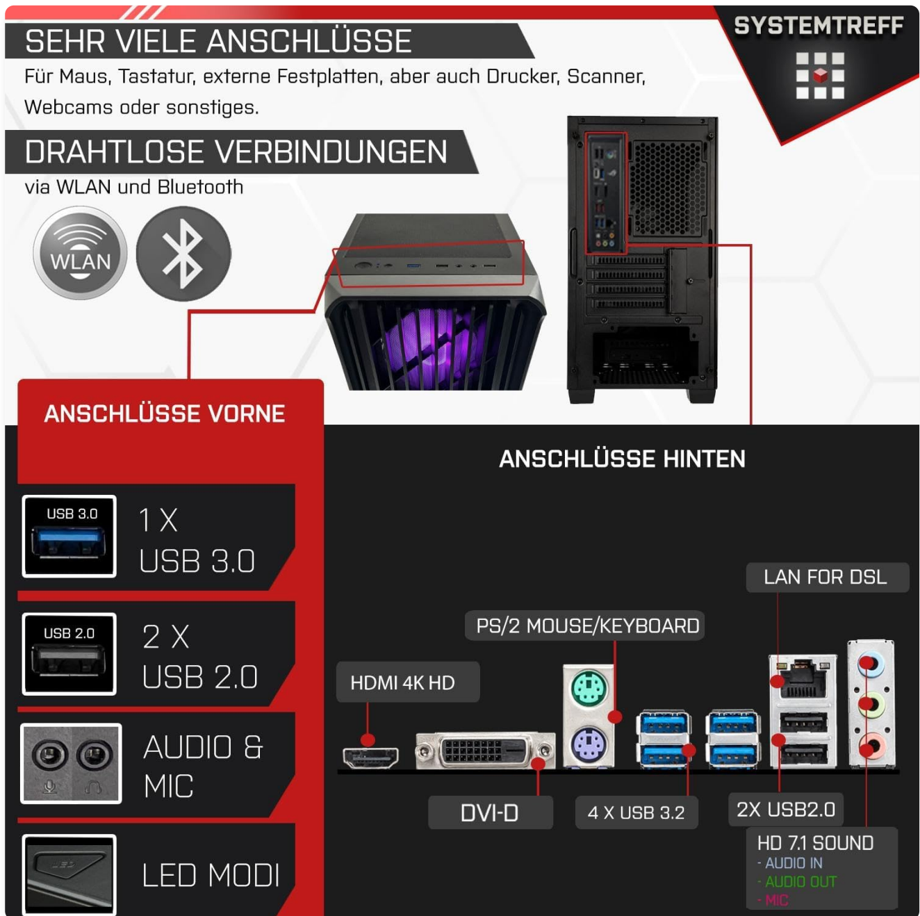
Image: Detailed view of the front and rear connectivity ports on the SYSTEMTREFF PC.

Connect your monitor, keyboard, and mouse to the appropriate ports on the rear of the PC. The motherboard (A520M-K) provides various ports including D-Sub, HDMI, USB 3.2 Gen. 1, and USB 2.0.