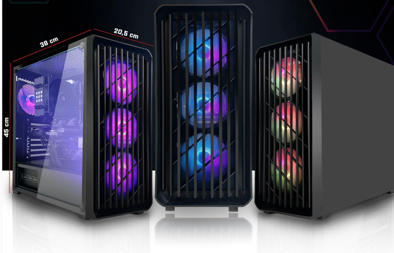
Image: Visual representation of the SYSTEMTREFF PC's dimensions.