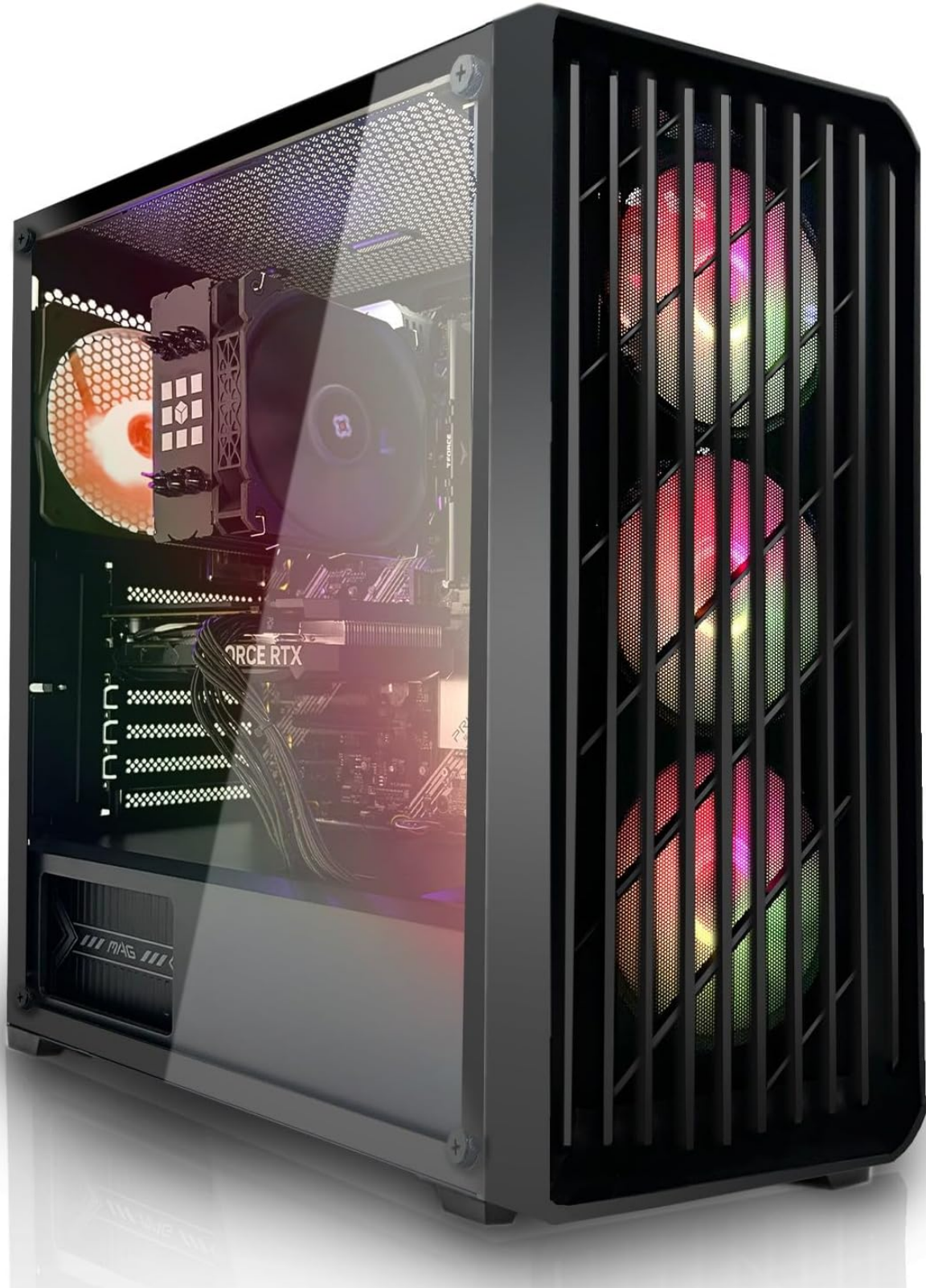
Image: The SYSTEMTREFF PC Tower, showcasing its design and RGB lighting.

Carefully remove the PC from its packaging. Ensure to remove any internal packaging materials, especially those securing components during transit. The PC case is a Midi Tower Equinox ST-501, designed for optimal airflow.