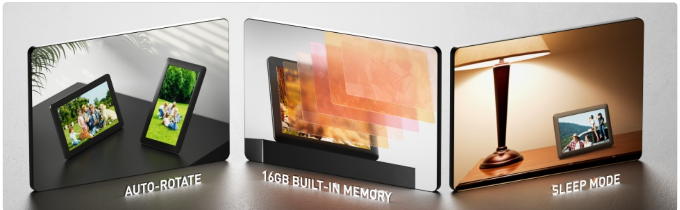
Image: The digital photo frame showcasing its auto-rotate functionality, adapting images to both landscape and portrait orientations.