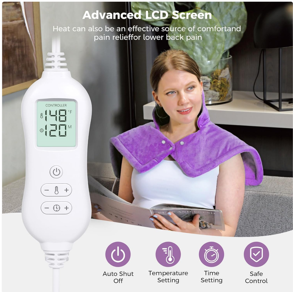
Image 4.1: The LCD intelligent controller for temperature and timer settings.

Heat can also be an effective source of comfort and pain relief for lower back pain