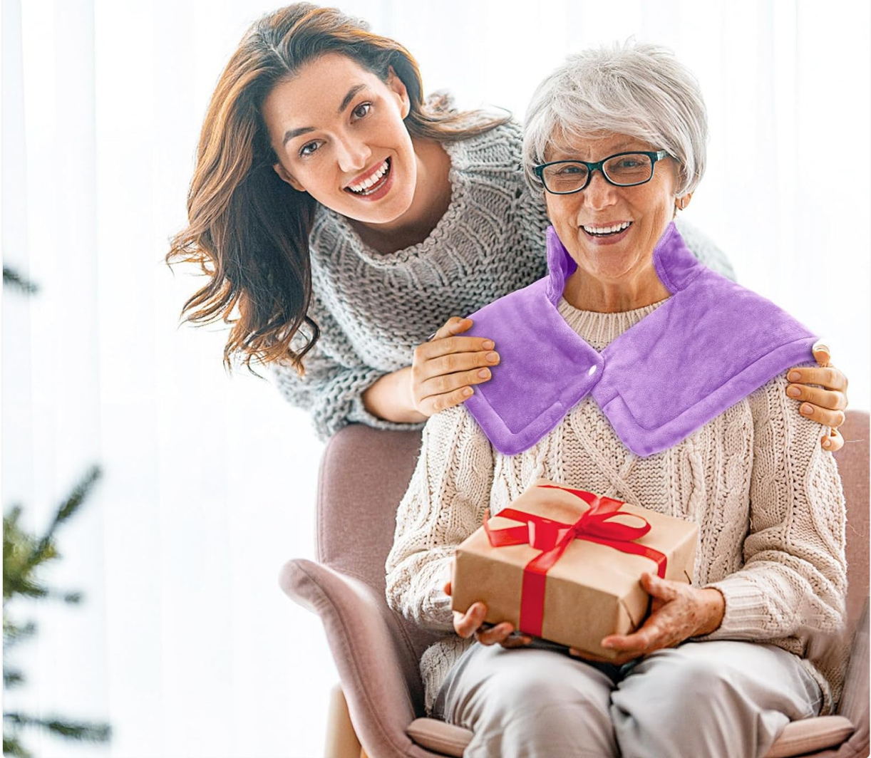
Image 5.1: The heating pad is machine washable after detaching the controller.