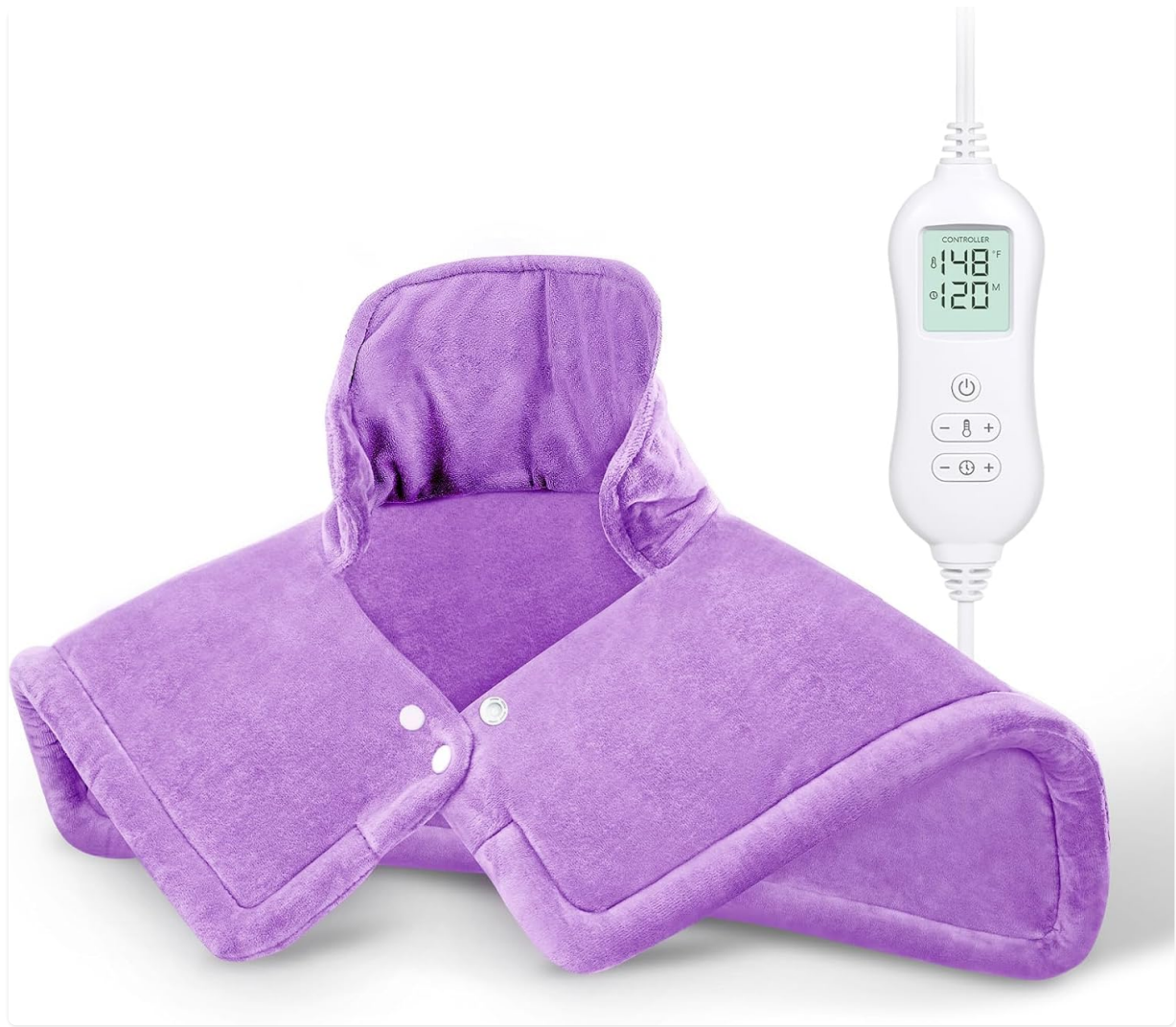
Image 1.1: The NOWWISH Weighted Heating Pad with its digital controller.