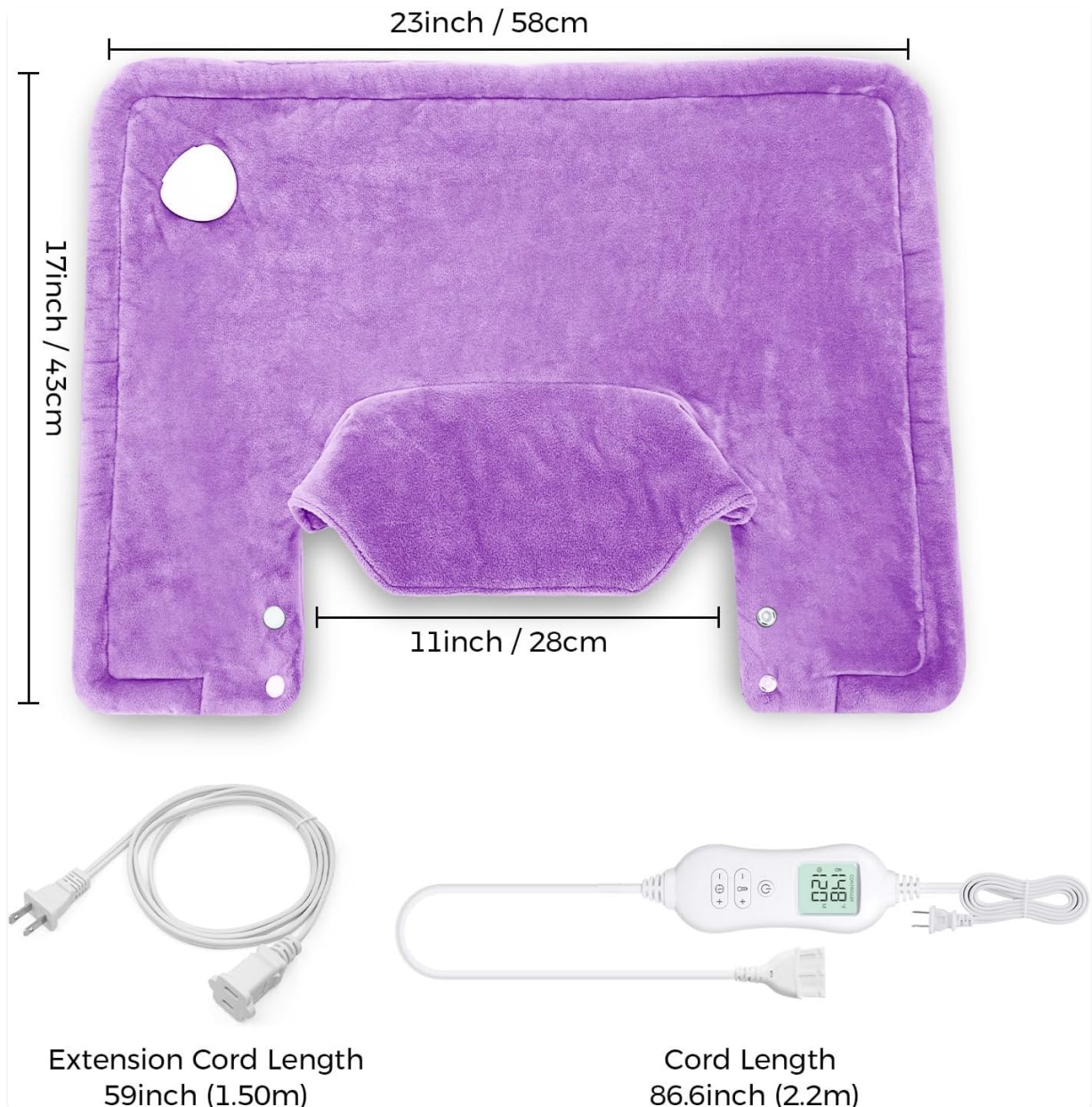
Image 3.1: Dimensions of the heating pad (17" x 23") and cord lengths.