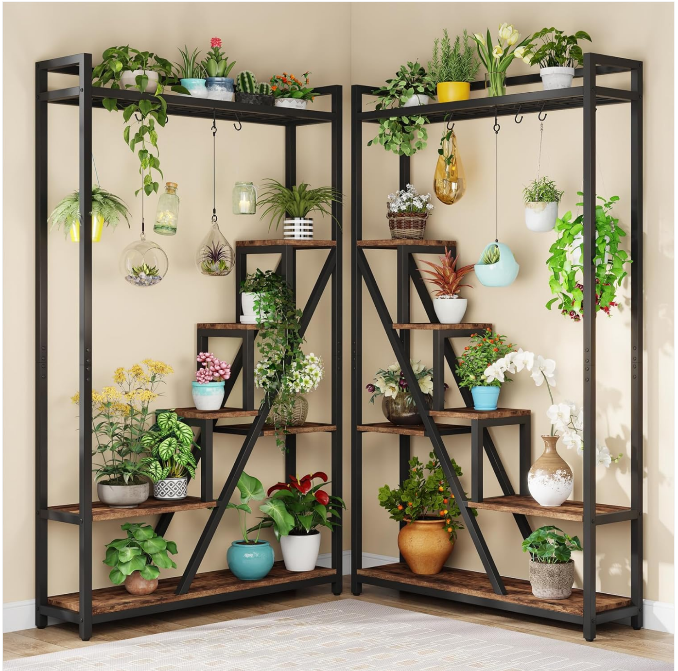
Figure 4.3: Two plant stands combined to create an expansive display area, ideal for larger plant collections or room dividers.