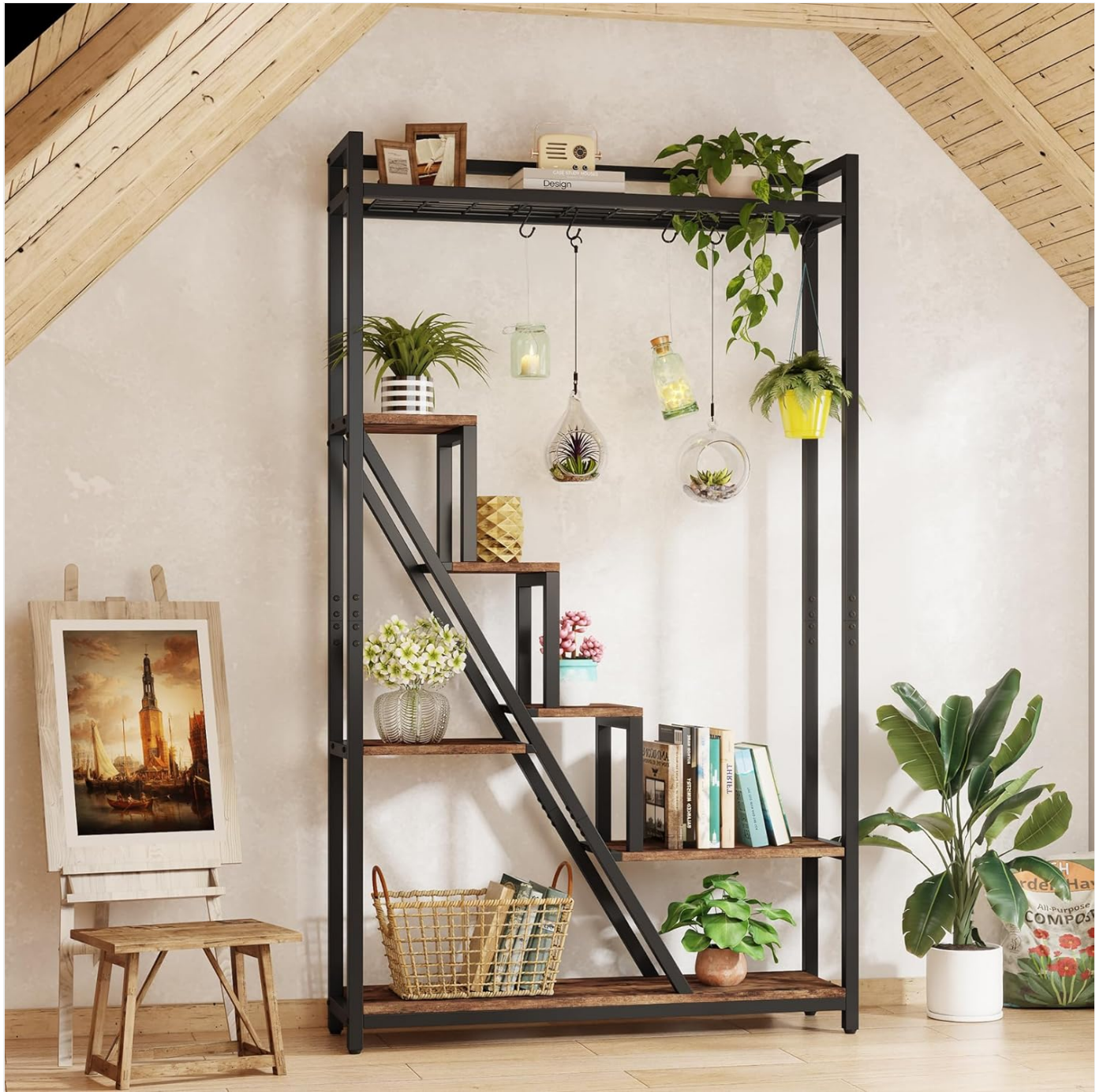
Figure 4.2: The versatile plant stand also serving as a stylish bookshelf and display unit for various items.