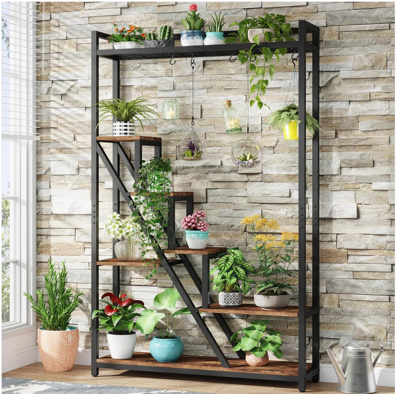
Figure 4.1: The plant stand showcasing a variety of plants on its multiple tiers and hanging from the top hooks.