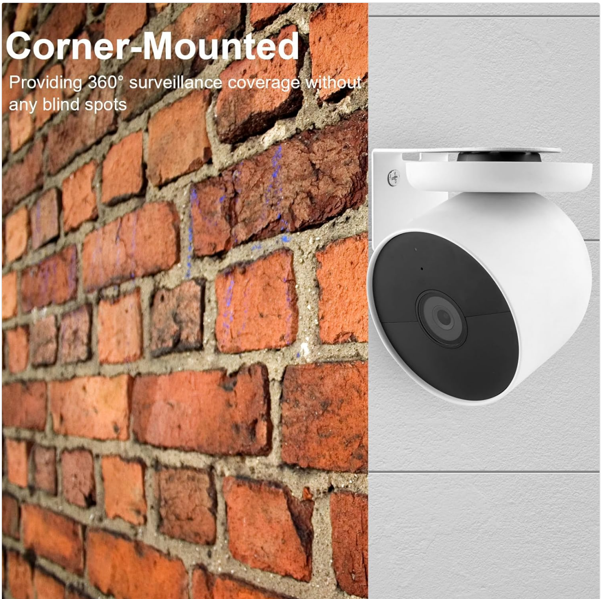
Figure 5: Corner-Mounted Camera. This image highlights the L-shaped bracket's ability to provide 360-degree surveillance coverage when corner-mounted, eliminating blind spots.

Providing 360° surveillance coverage without any blind spots