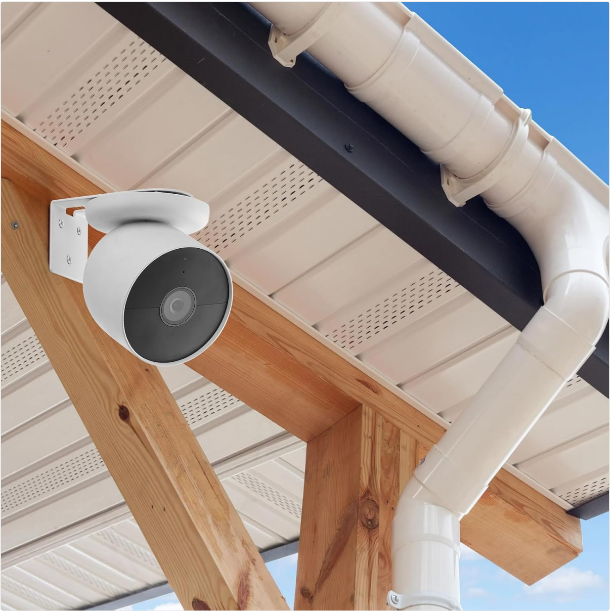
Figure 4: Mounted Camera Example. This image shows a Google Nest Cam securely mounted using the UYODM bracket under the eaves of a building, demonstrating an outdoor installation.