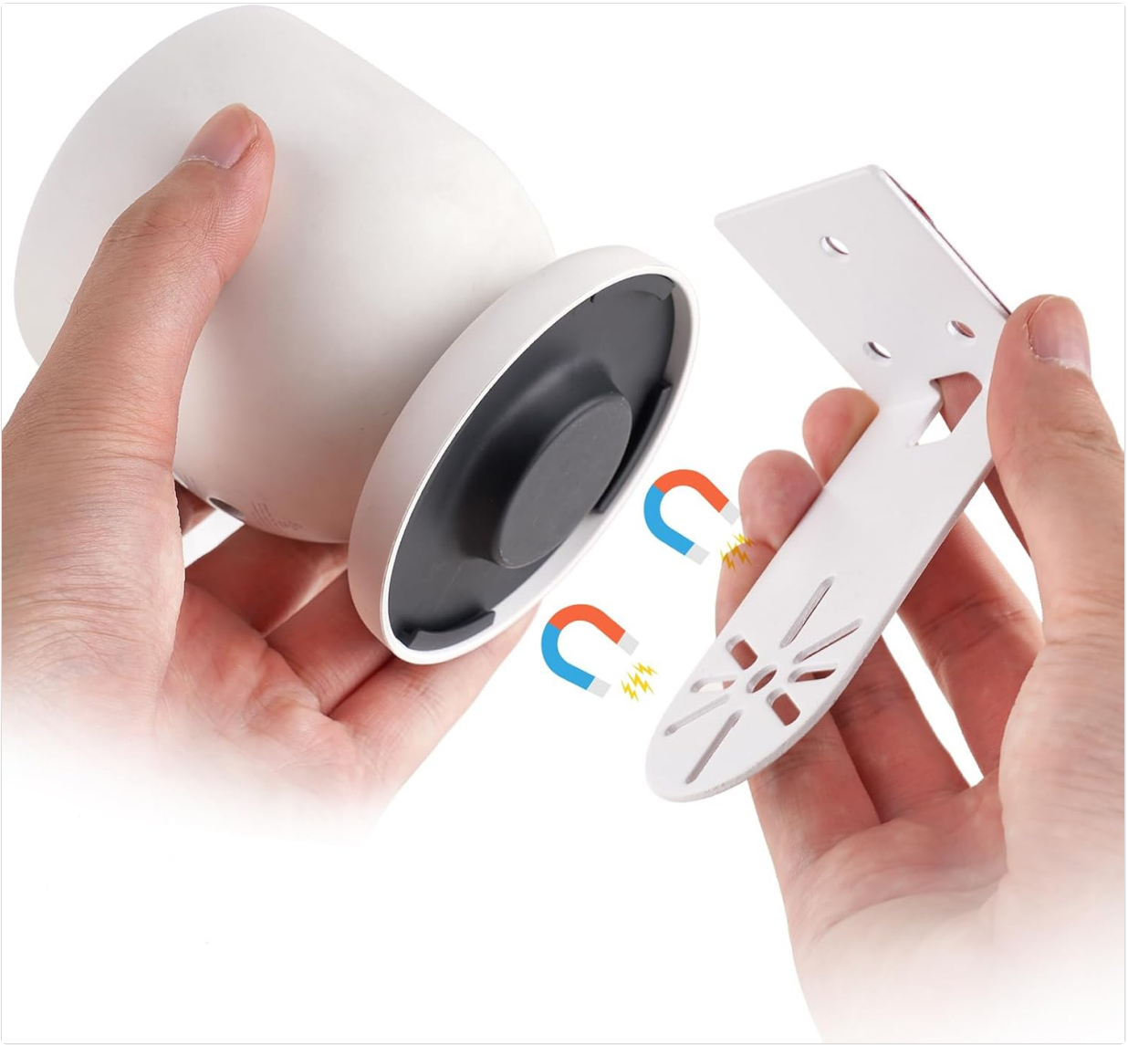
Figure 3: Magnetic Attachment. This image illustrates how the Google Nest Cam magnetically connects to the UYODM wall mount bracket for easy and secure placement.