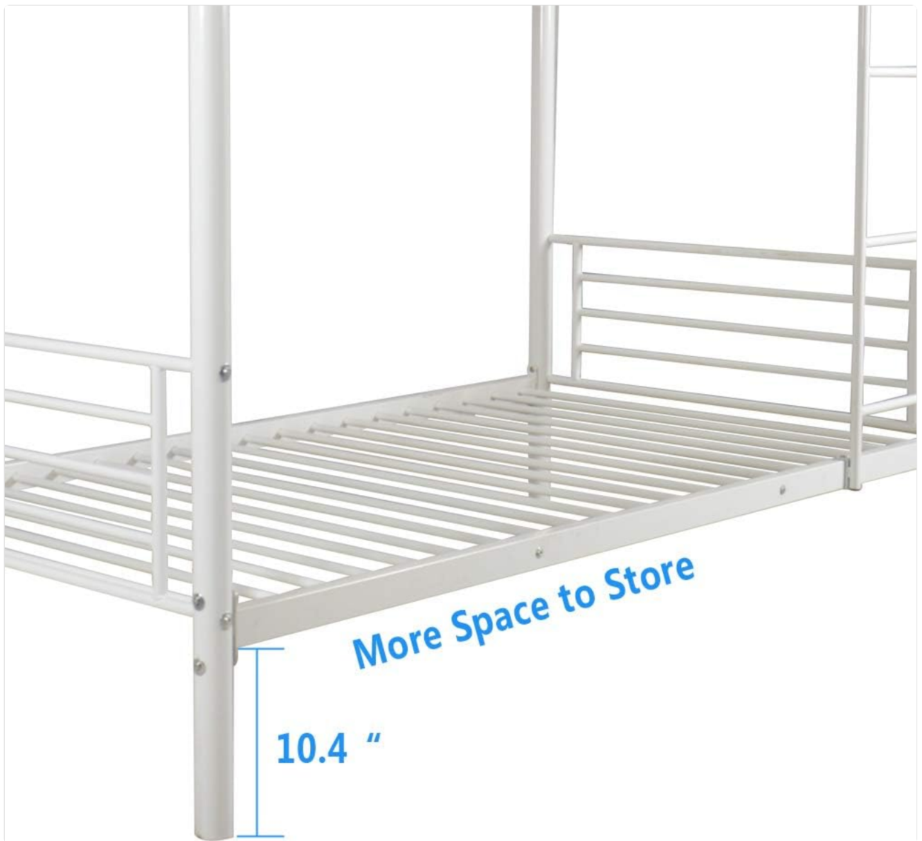
Figure 6: Illustration of the 10-inch under-bed clearance, providing space for storage.