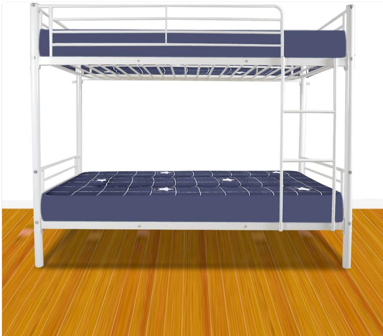
Figure 4: The bunk bed shown with mattresses in place, demonstrating proper setup for use.