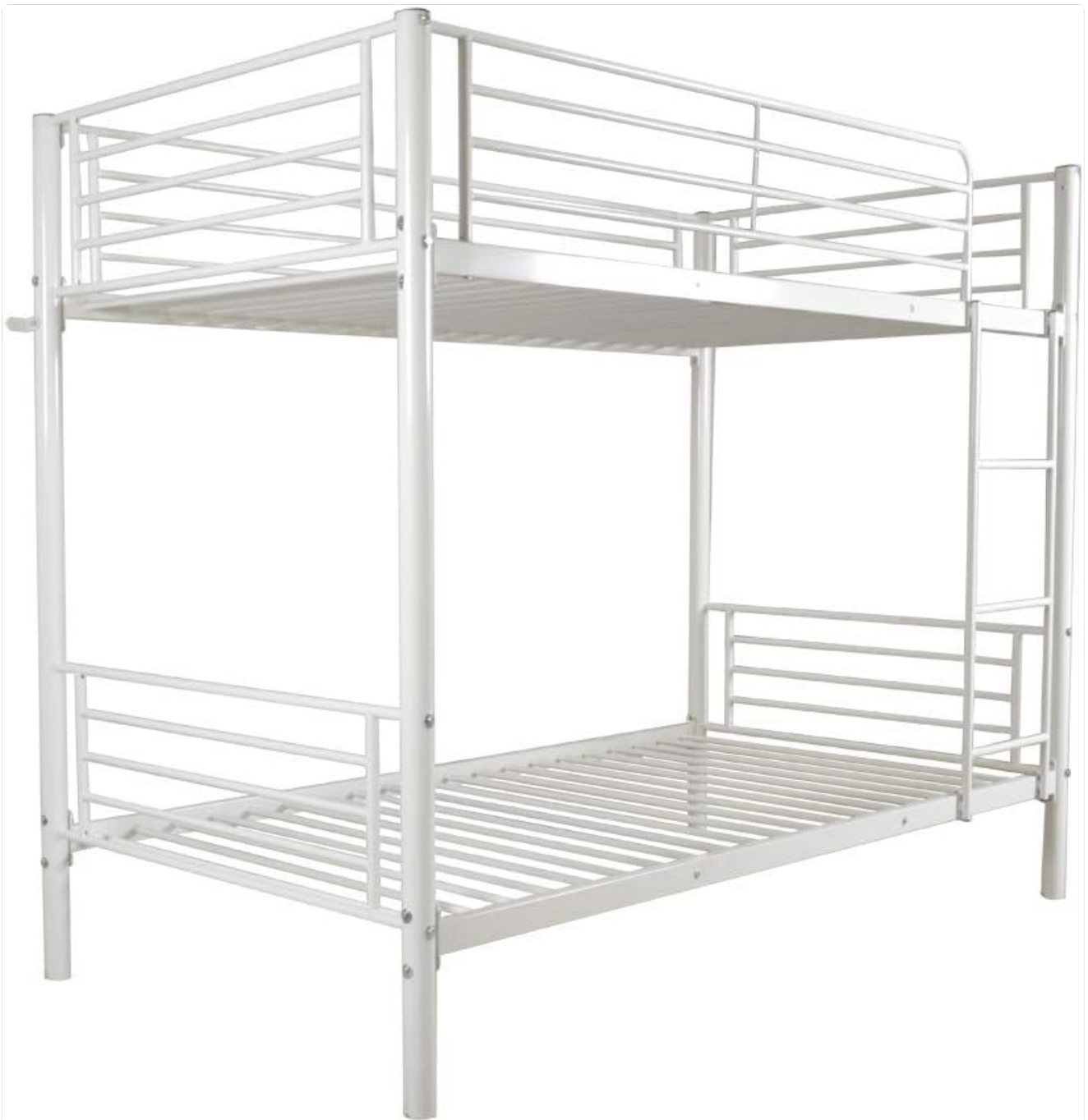
Figure 1: The Karl home Twin Over Twin Metal Bunk Bed in white. This image shows the complete bunk bed frame without mattresses.