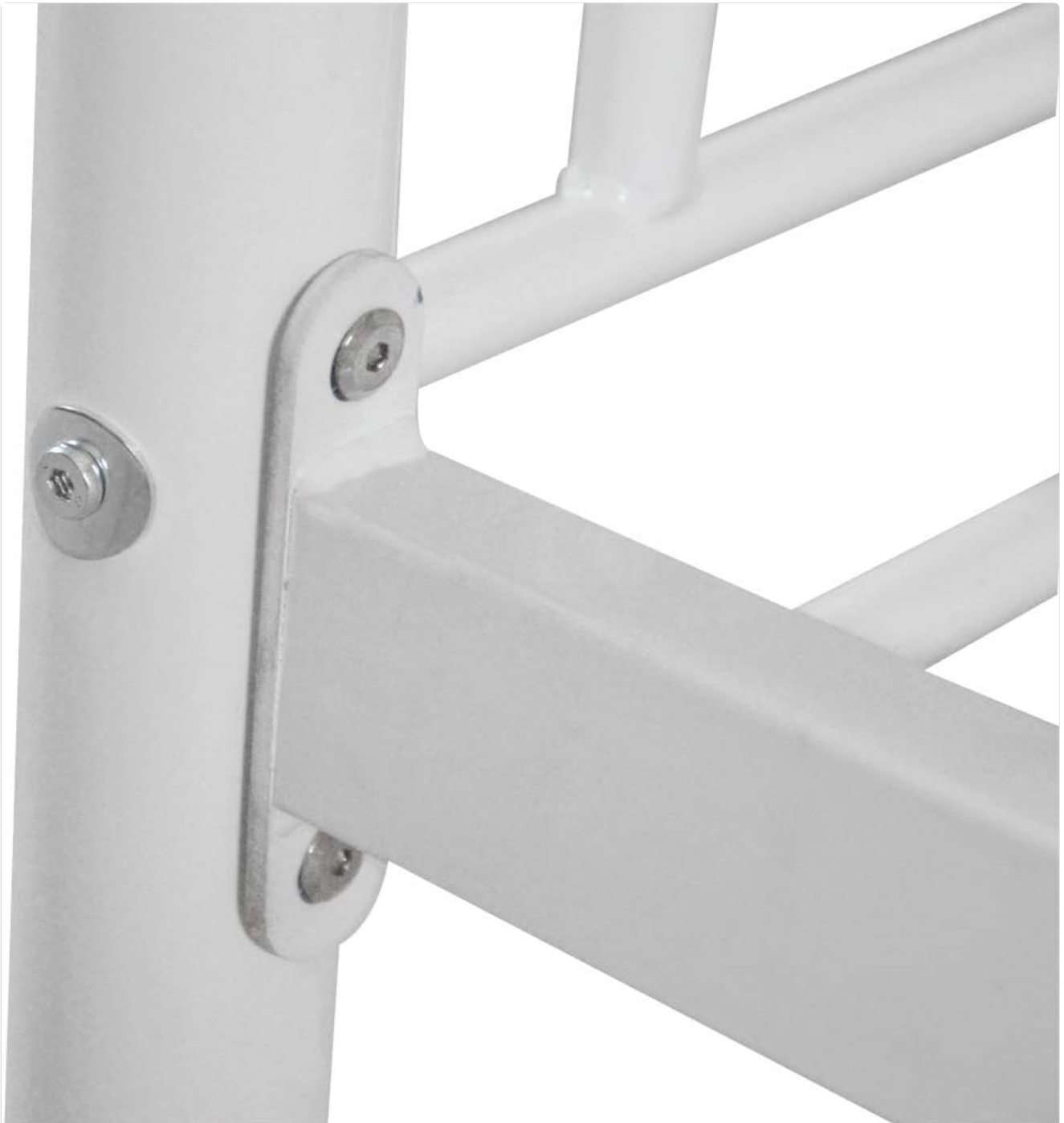
Figure 3: Example of a secure metal joint connection, crucial for the bed's stability. Ensure all connections are tightened properly during assembly.