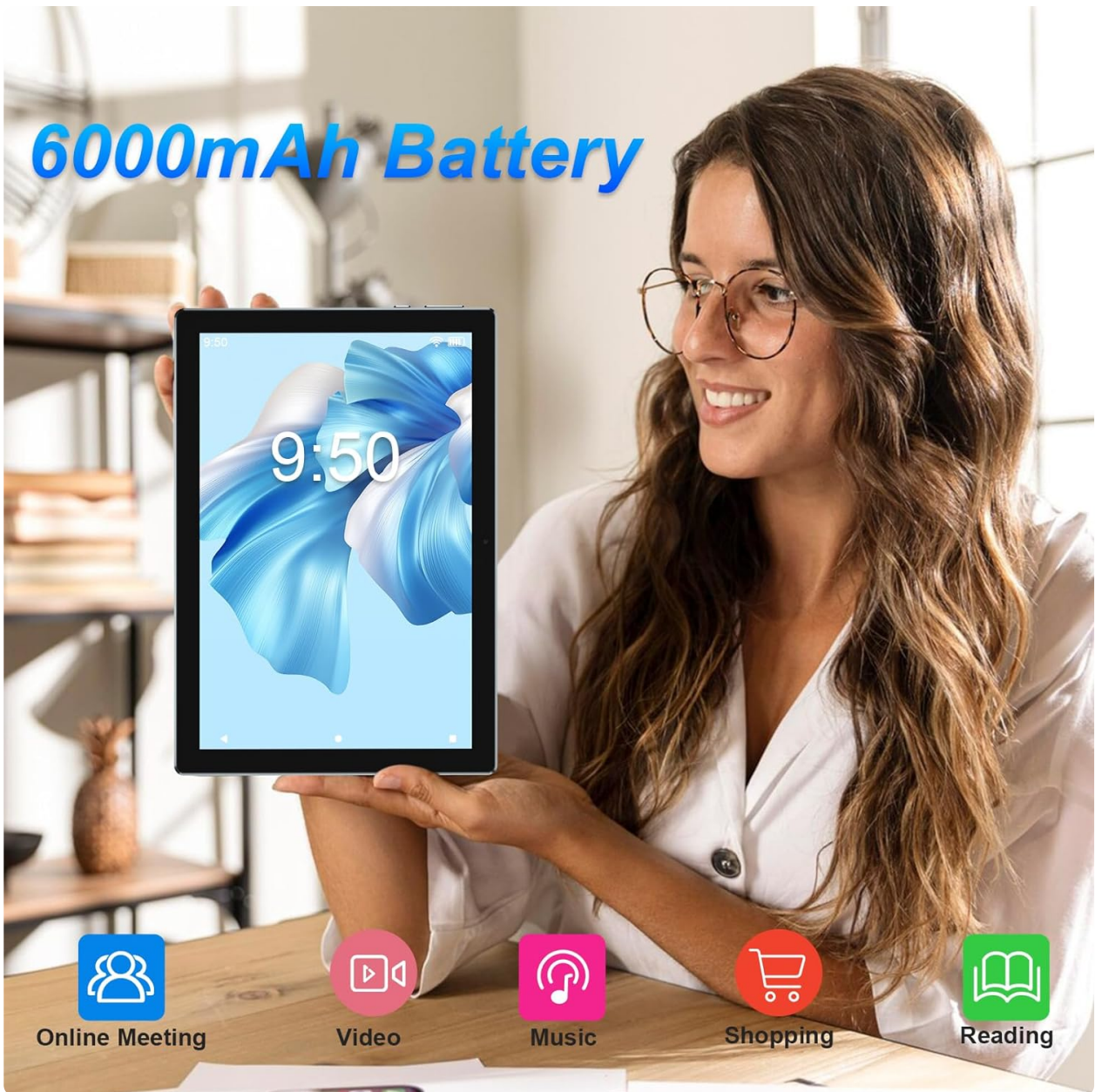
Image: A woman holding the tablet, with text indicating the 6000mAh battery capacity, suitable for online meetings, video, music, shopping, and reading.