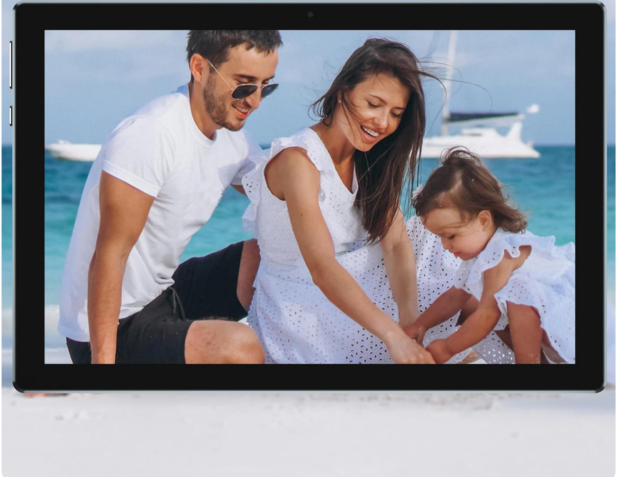
Image: The tablet displaying a clear family photo, highlighting its 2MP front and 8MP rear camera capabilities and HD large screen.

1280X800 HD Large Screen, Wide Viewing Angle Screen