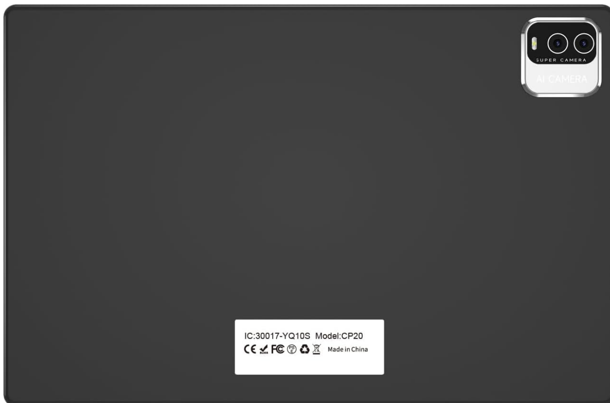
Image: The rear view of the tablet, showing the camera module and regulatory information, which helps in locating ports.

To expand storage, locate the TF card slot on the side of the tablet. Gently insert a Micro SD card (up to 2TB) into the slot until it clicks into place. Ensure the tablet is powered off before inserting or removing the card.