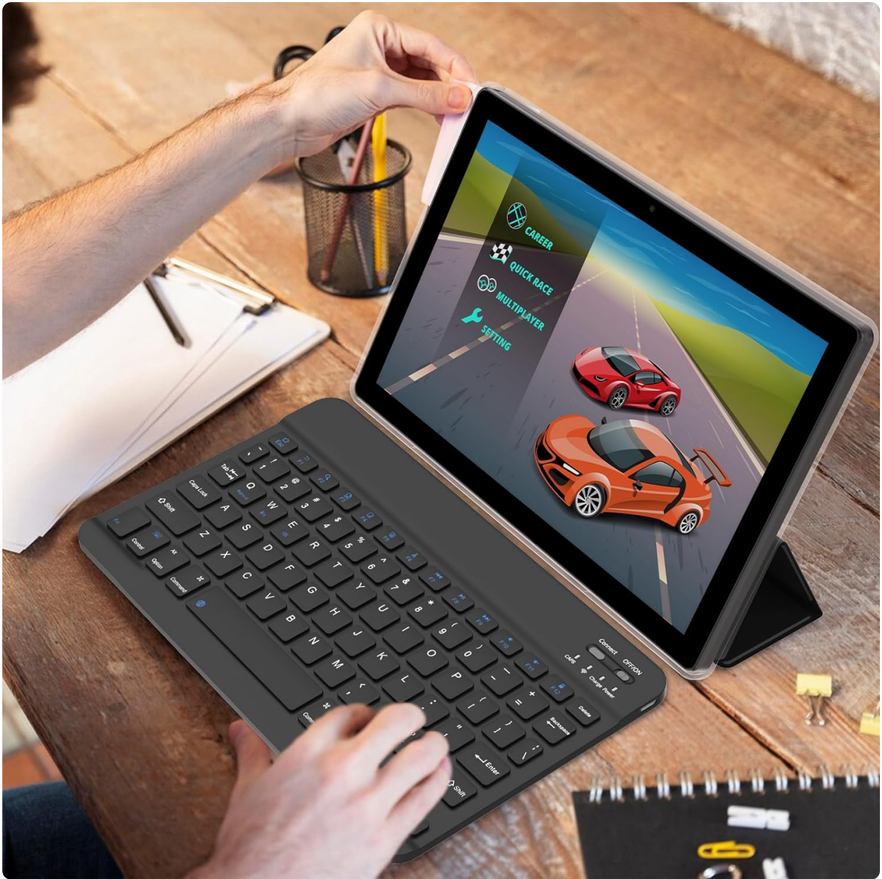
Image: A person interacting with the tablet in laptop mode, using the keyboard to play a racing game, demonstrating its versatility.