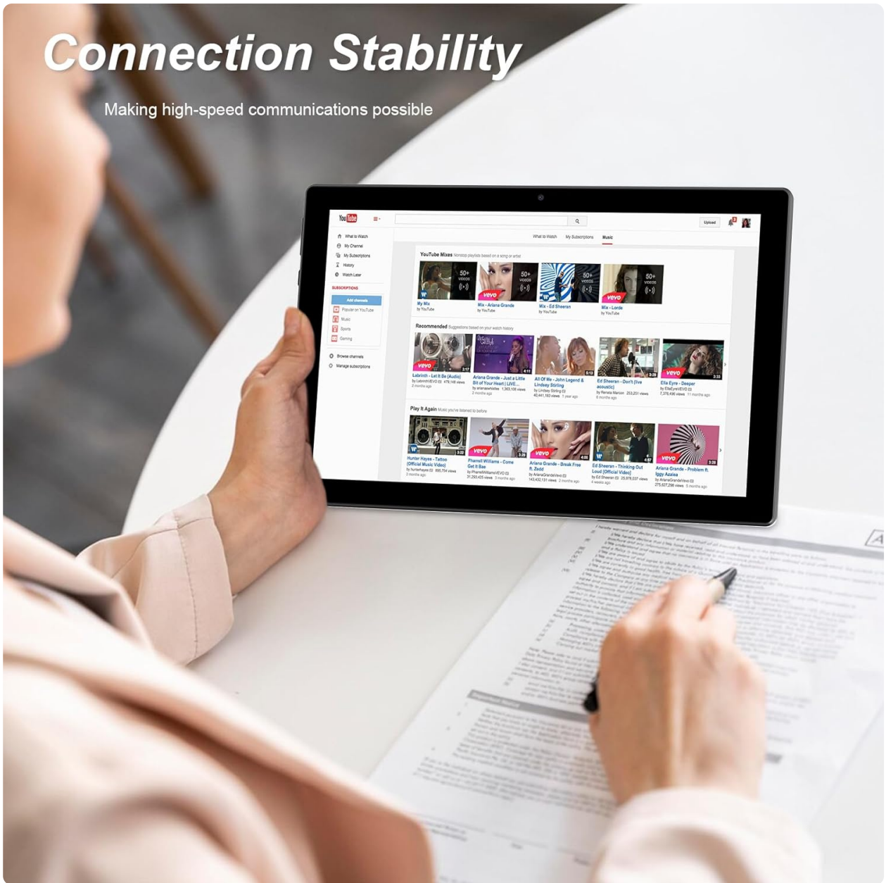
Image: The tablet showing a YouTube interface, demonstrating stable and high-speed communication capabilities.

Making high-speed communications possible