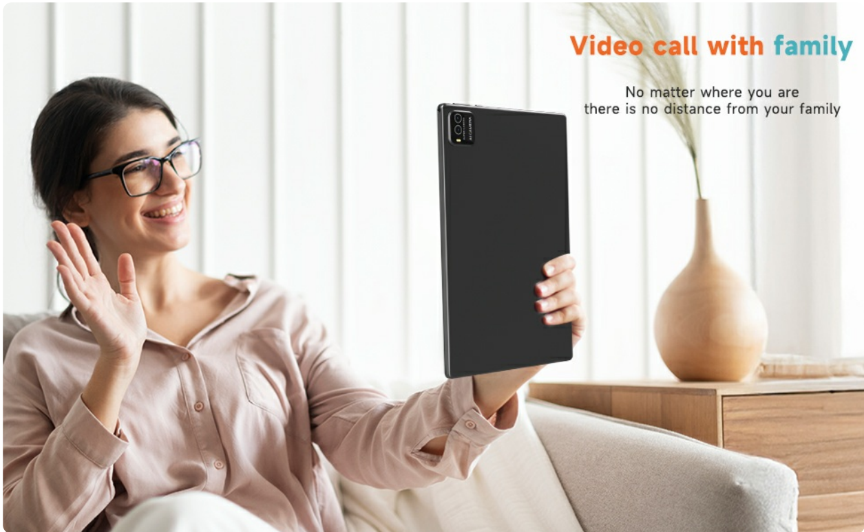
Image: A woman engaged in a video call on the tablet, demonstrating its capability for family communication.

Open the Camera app from the home screen or app drawer. You can switch between the front and rear cameras, select photo or video mode, and adjust settings as needed.