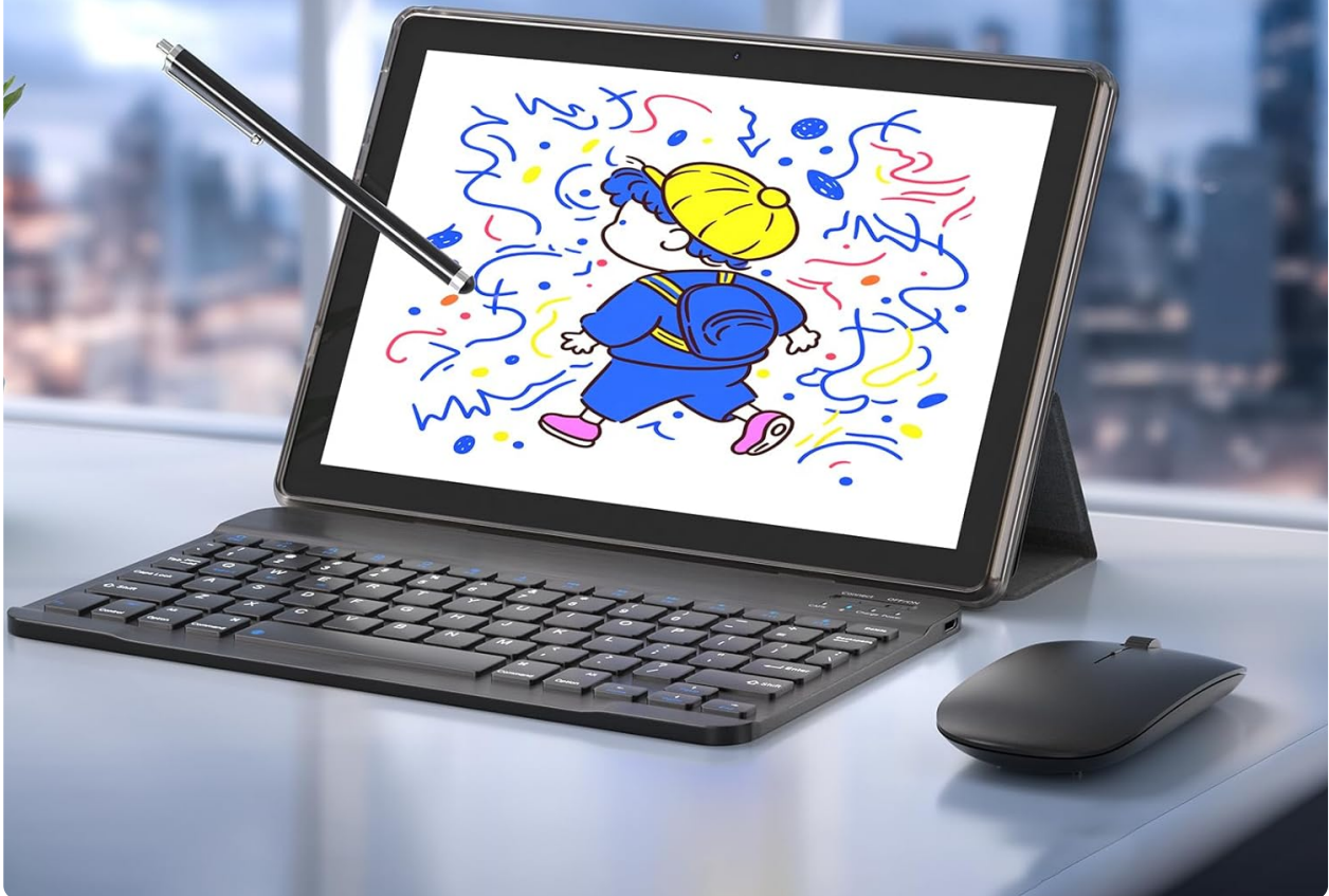
Image: The tablet displaying the Android 15.0 system interface, highlighting its smooth operation.

It runs smoothly like silk, offering an ultimate experience.