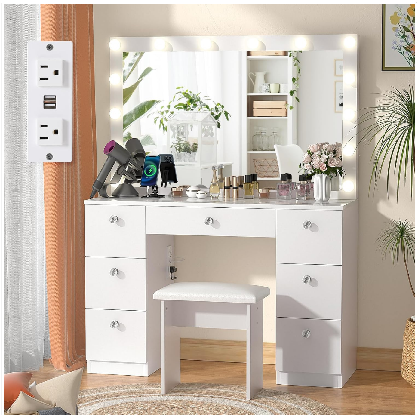
Image: The SMOOL Vanity featuring a built-in power outlet with two standard sockets and two USB ports on the left side of the tabletop.

The vanity is equipped with 2 standard plug sockets and 2 USB ports for convenient charging of your devices and powering beauty tools.