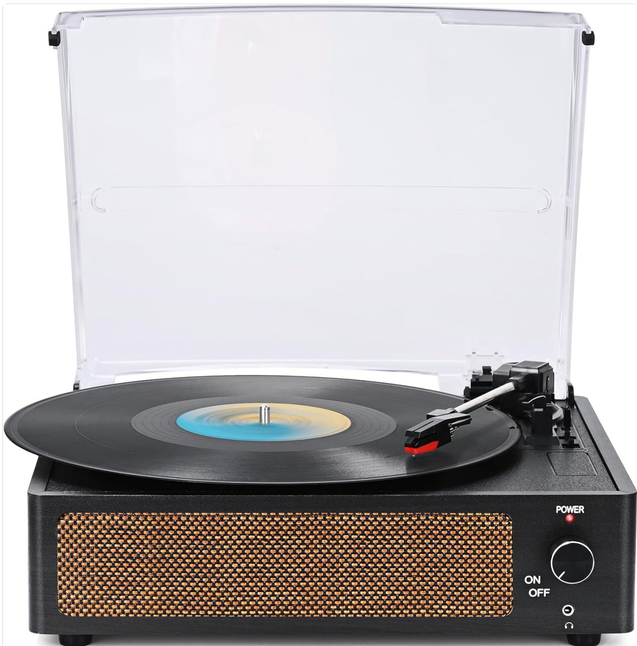
Figure 1: WOCKODER R608 Vinyl Record Player Overview