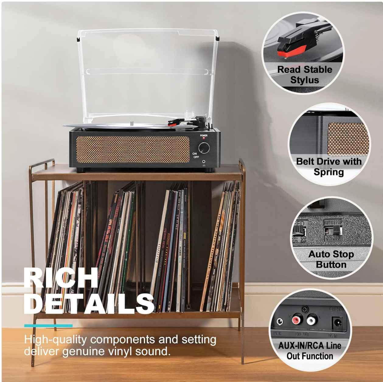
Figure 4: Rich Details and Components