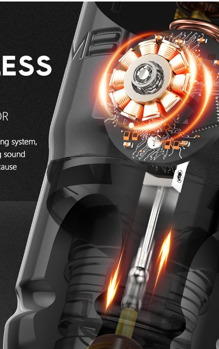
Image: Detailed view of the brushless motor and its specifications.