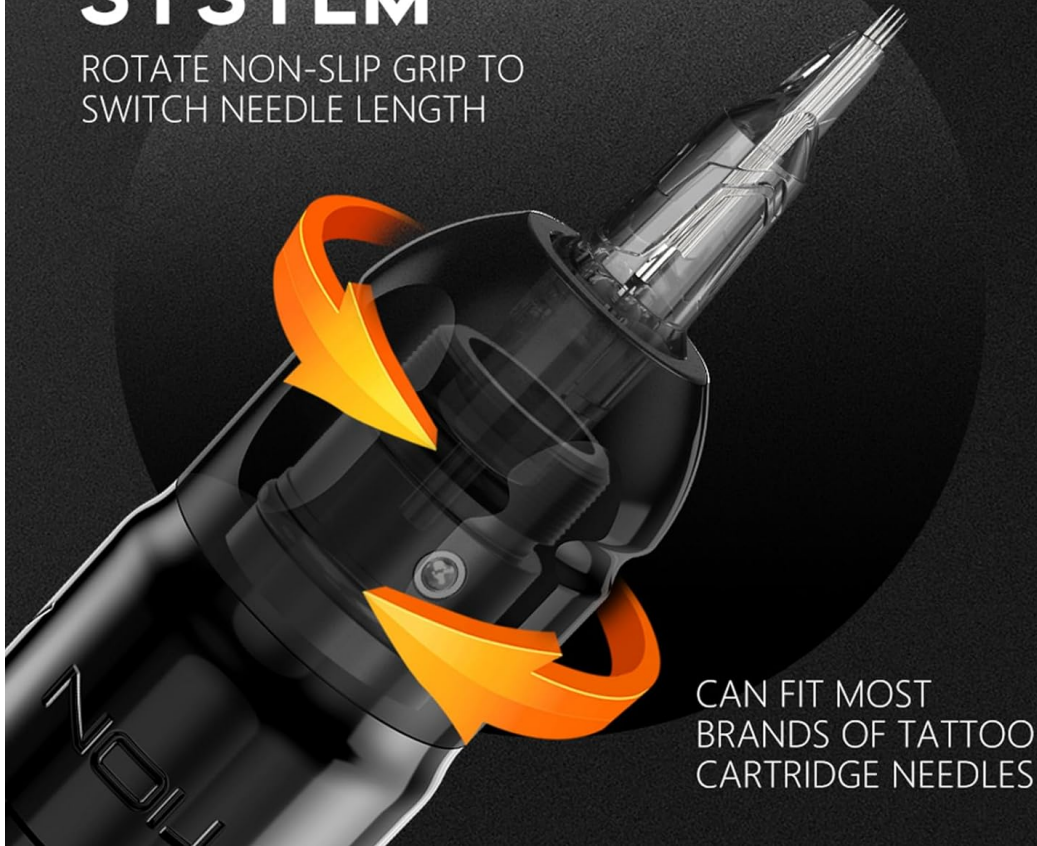
Image: Using the click adjust system to set needle depth.

ROTATE NON-SLIP GRIP TO SWITCH NEEDLE LENGTH