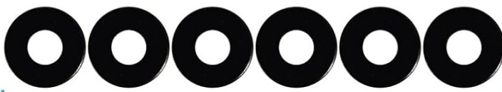
M8 Washer (6)