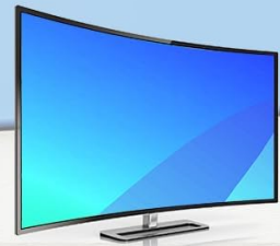
Image: This diagram illustrates how the hardware kit is designed to adapt to a wide range of TV mount types, including fixed, tilt, full-motion, and stand mounts, compatible with both flat and curved televisions.