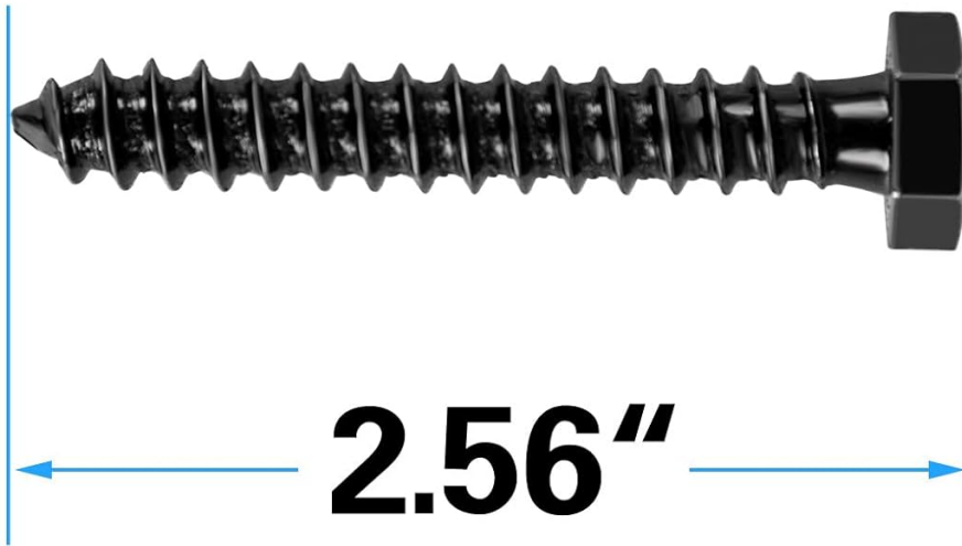
Image: Close-up of an M8*65mm lag bolt, highlighting its rustproofed zinc layer and 2.56-inch length.