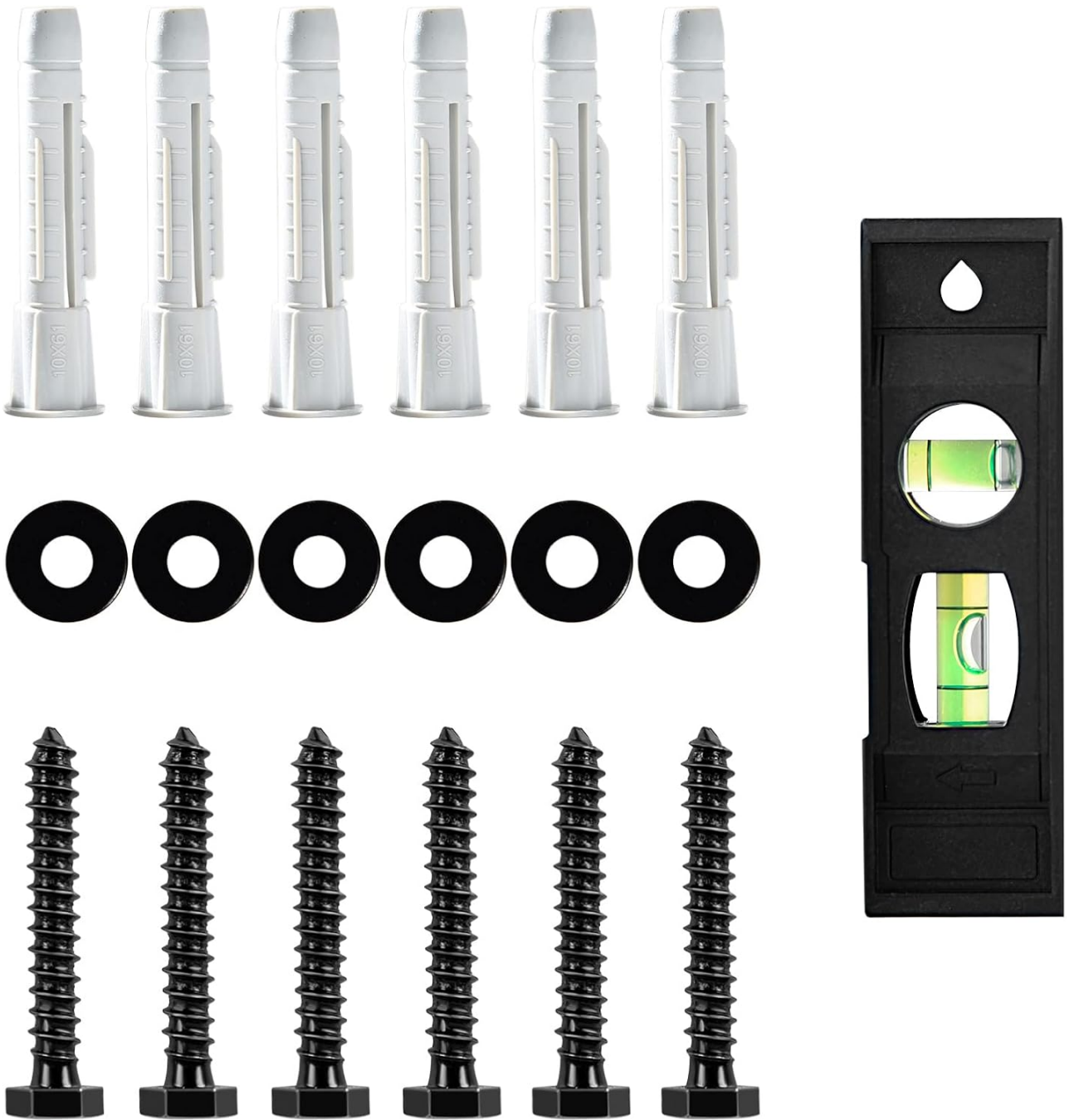
Image: Overview of the MU0041-B Wall Plate Mounting Kit components, including lag bolts, washers, concrete wall anchors, and a bubble level.