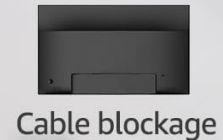
Image: This illustration demonstrates the utility of flexible spacer lengths (1.5mm, 5mm, 6.5mm, 15mm, 16.5mm, 20mm) for addressing common installation challenges such as screws being too long, mounting curved TVs, and preventing cable blockage.