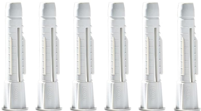
Concrete Wall Anchor (6)