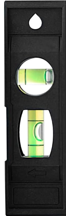
Bubble Level (1)

Image: Detailed breakdown of the 19 pieces included in the MU0041-B kit: 6 M8*65mm Lag Bolts, 6 M8 Washers, 6 Concrete Wall Anchors, and 1 Bubble Level.