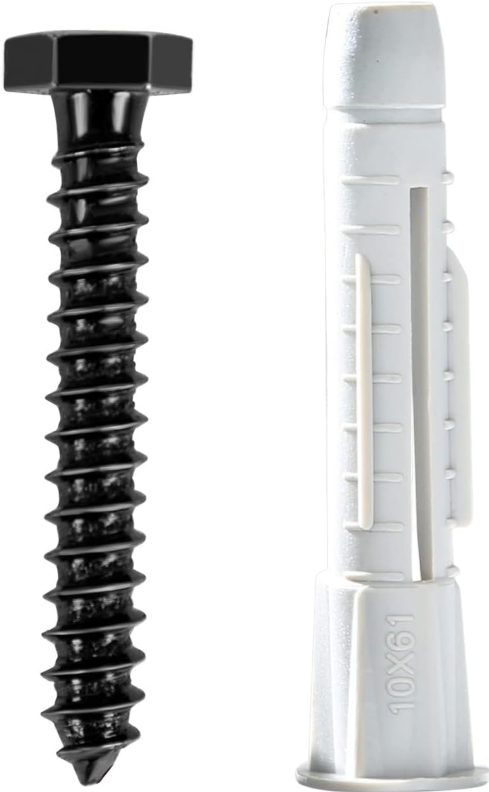
Image: Illustration demonstrating the compatibility and secure fit between a lag bolt and a concrete wall anchor.