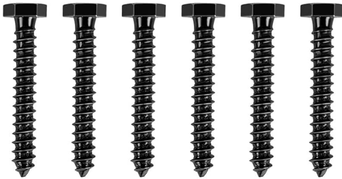
M8*65mm Lag Bolt (6)