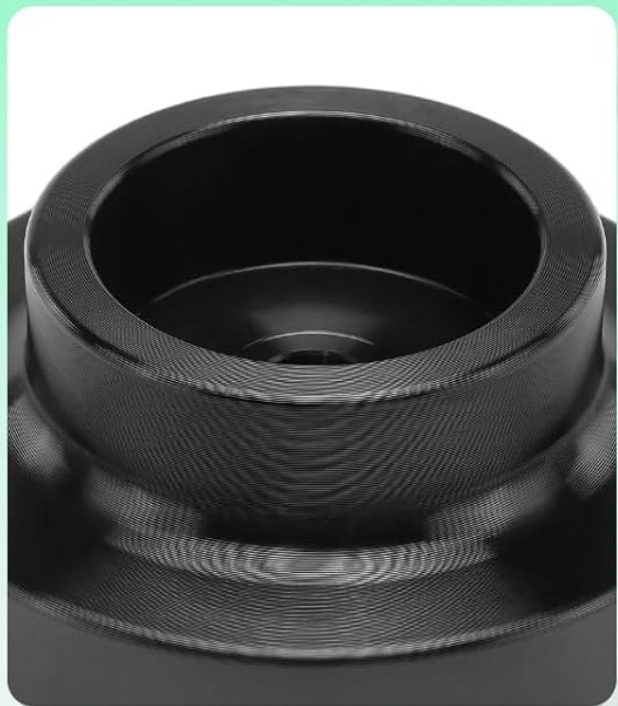
Image: Detailed close-up shots of the product, showcasing the precision machining and anodized finish of the spacers.