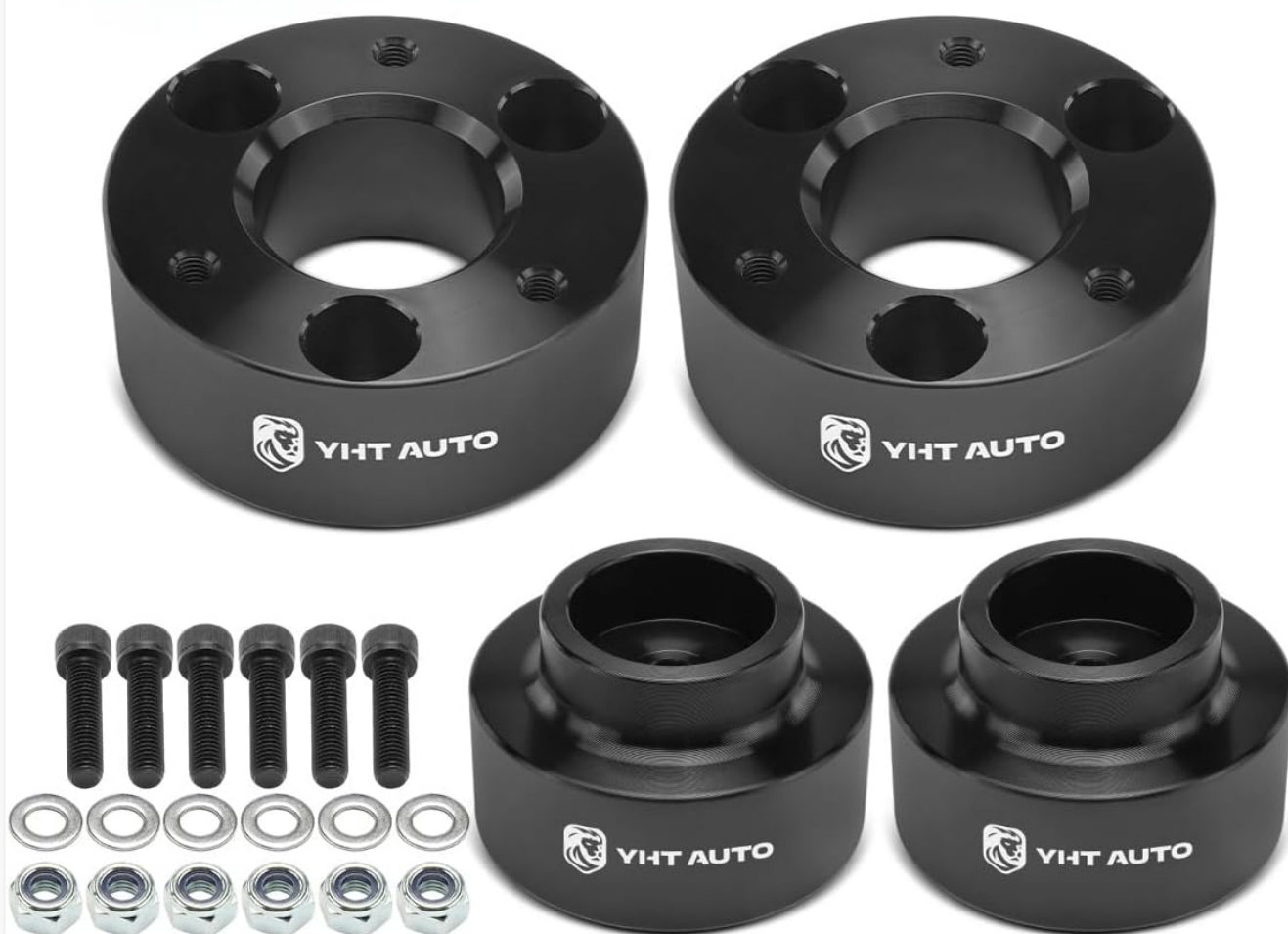
Image: The YHTAUTO Leveling Lift Kit components, including the front and rear spacers, nuts, and bolts.