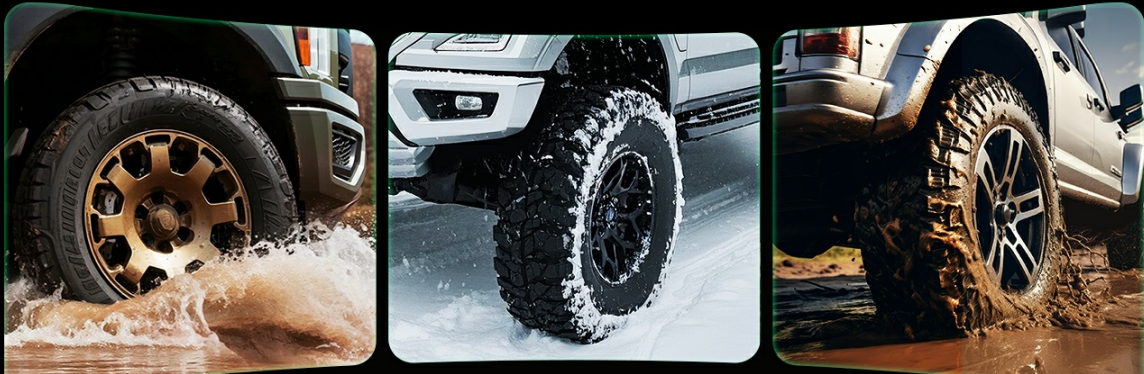
Image: Visual examples of a truck maintaining traction in various challenging environments such as mud and snow.