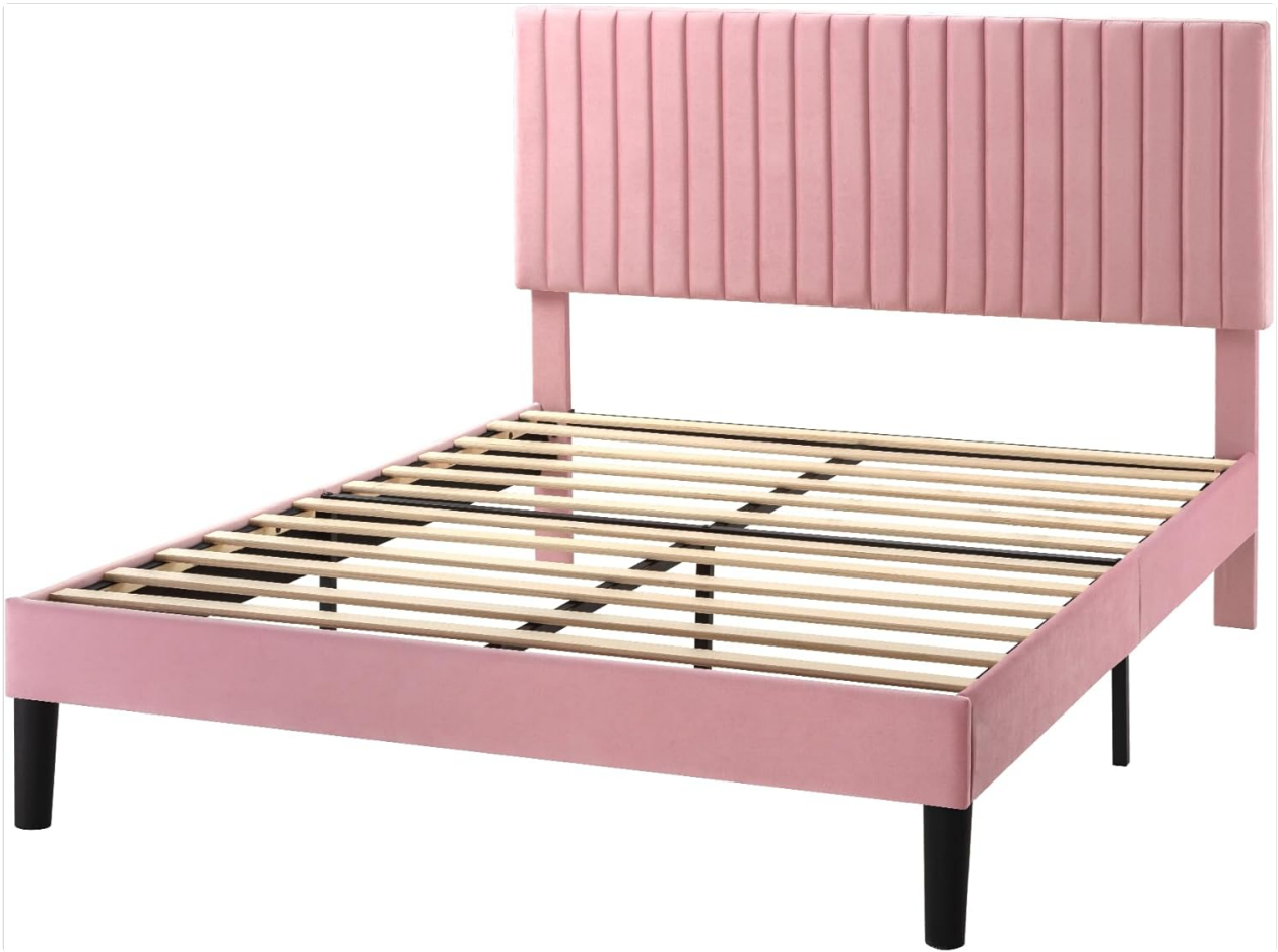
Image: Assembled bed frame without mattress.