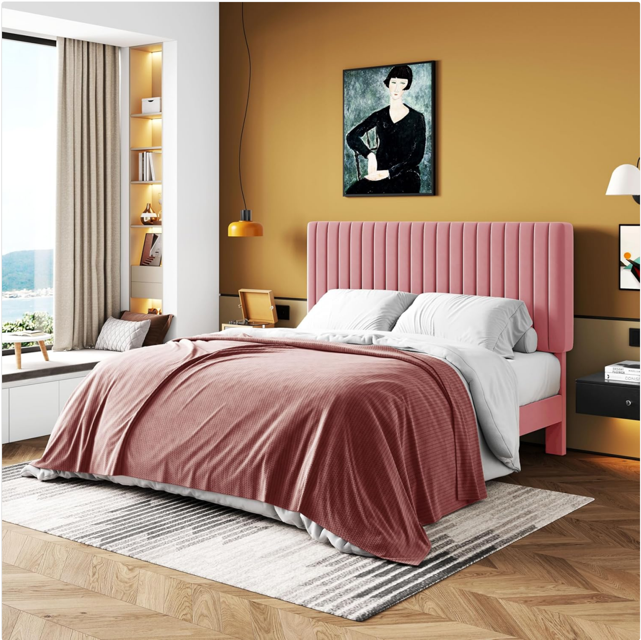
Image: HOOMIC Full Size bed frame with mattress and bedding.