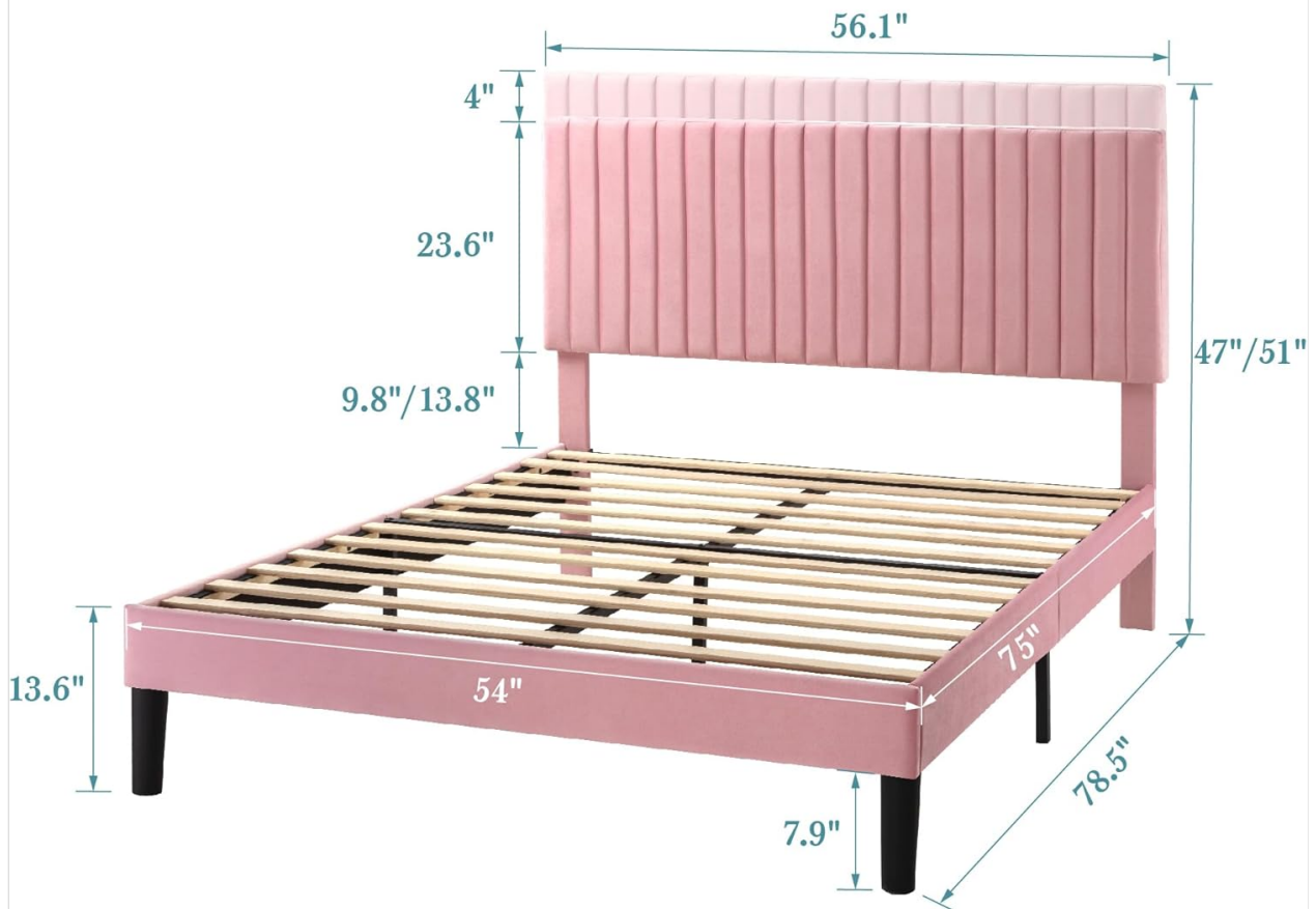
Image: Full Size Bed Frame Dimensions.