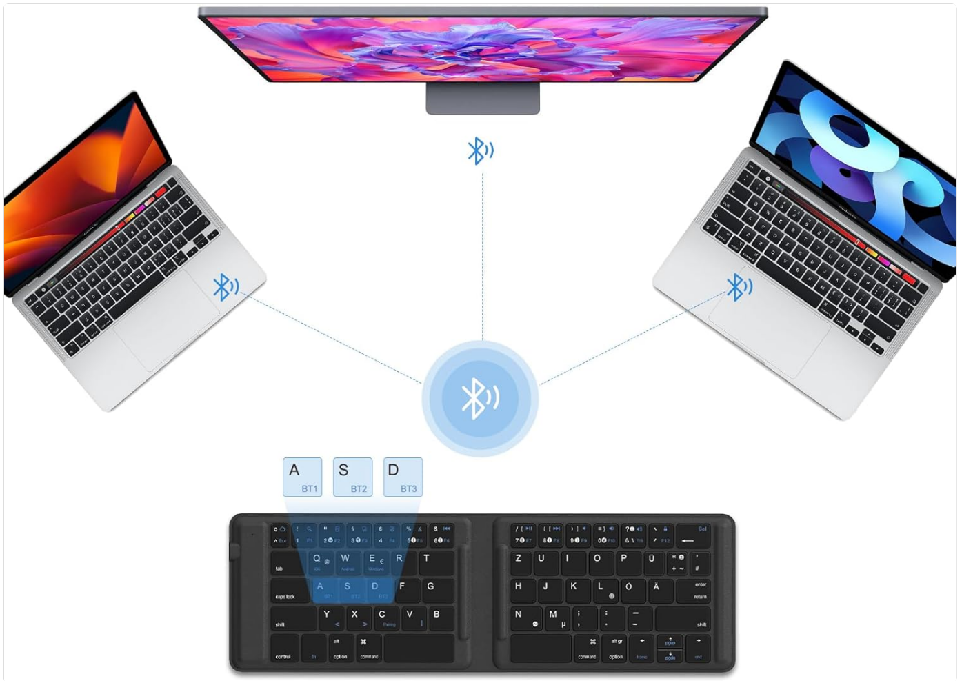
Image: This image illustrates the keyboard's ability to connect to multiple devices (laptops shown) via Bluetooth channels BT1, BT2, and BT3, allowing users to switch between paired devices easily.