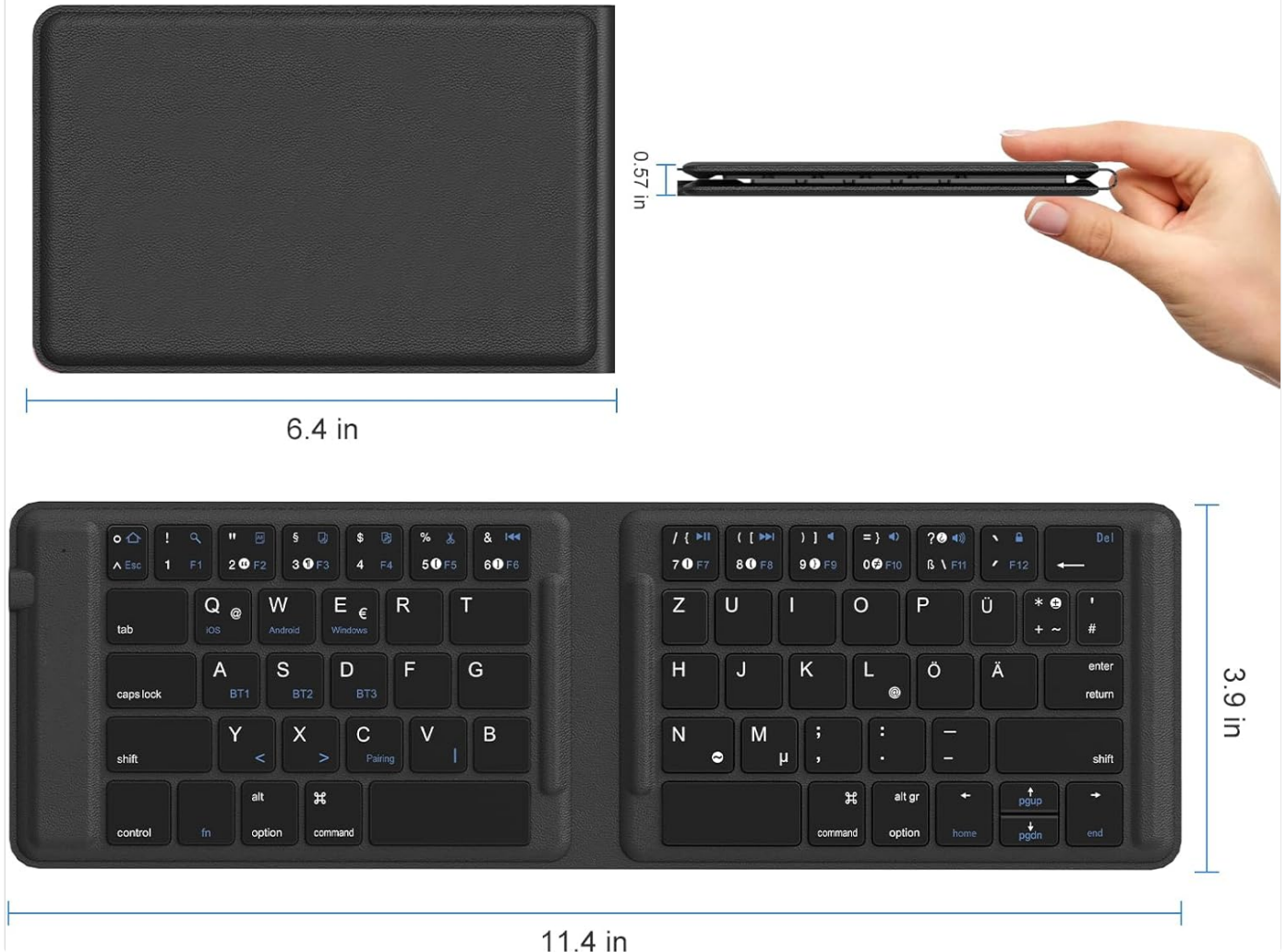
Image: This image provides a detailed view of the keyboard's ultra-flat design and its dimensions when both folded and unfolded, highlighting its portability and compact form factor.