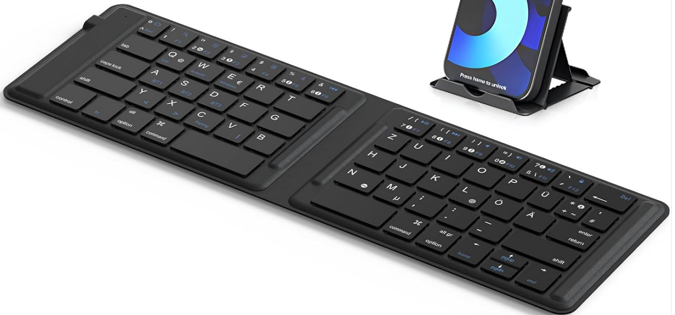
Image: The keyboard is shown alongside its adjustable phone stand, which is holding a smartphone. The image emphasizes the stand's 5-level adjustability for optimal viewing angles.