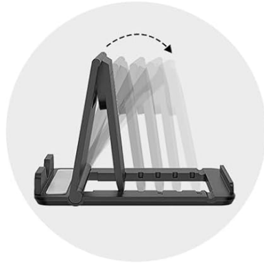
Einstellbarer Winkel in 5 Stufen