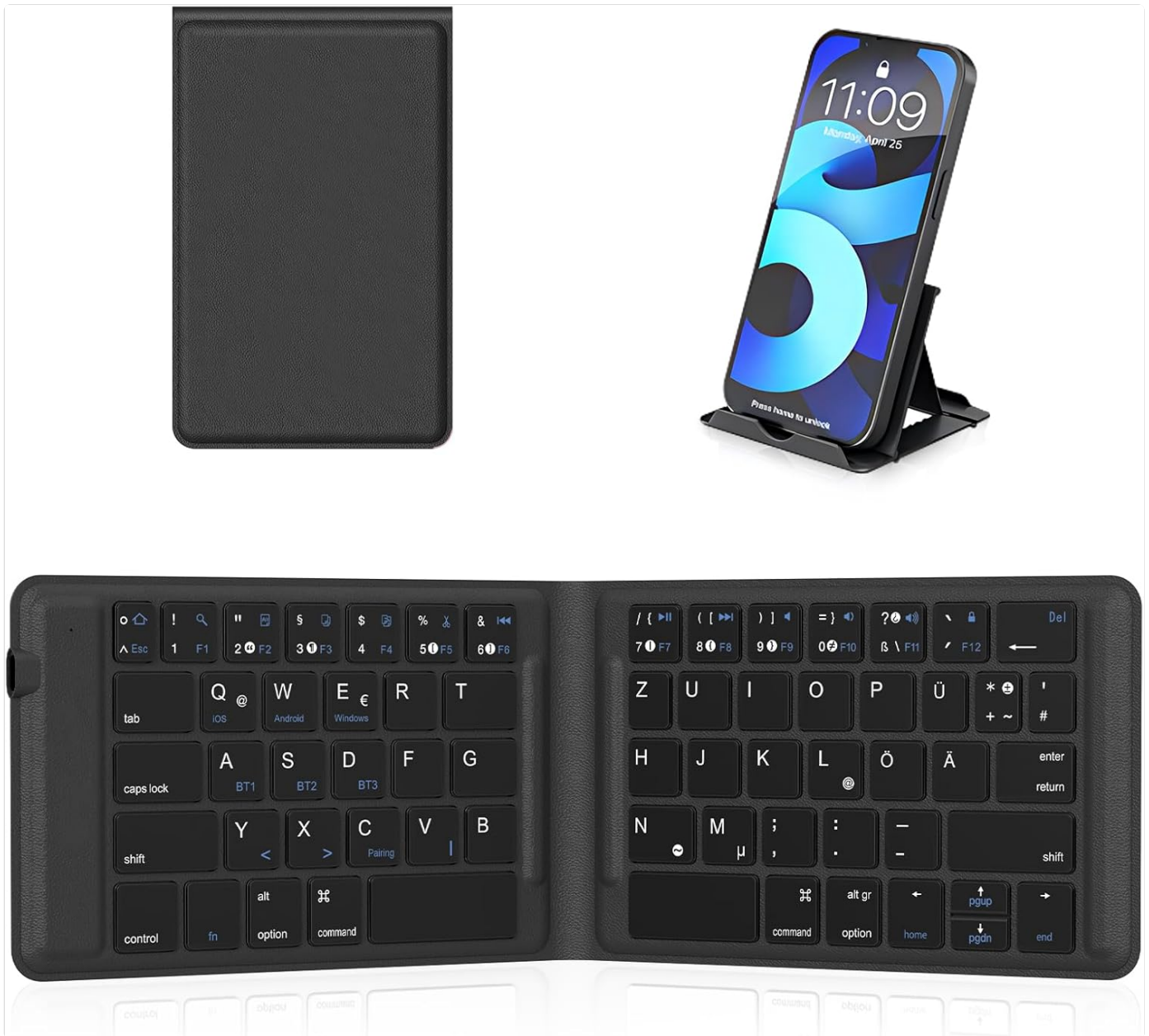
Image: The OMOTON Foldable Wireless Bluetooth Keyboard shown in both its compact, folded state and its fully unfolded, ready-to-use configuration. A smartphone is displayed on the included adjustable stand, demonstrating a typical setup for mobile productivity.