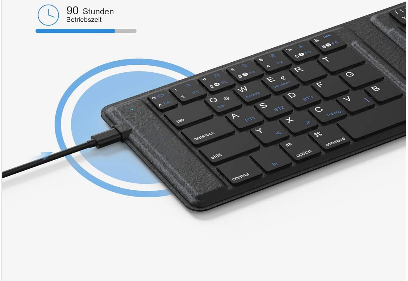
Image: The keyboard is shown connected to a charging cable, illustrating the charging process. Indicators for 2-3 hours charging time and 90 hours operating time are displayed, highlighting the keyboard's rechargeable battery capabilities.