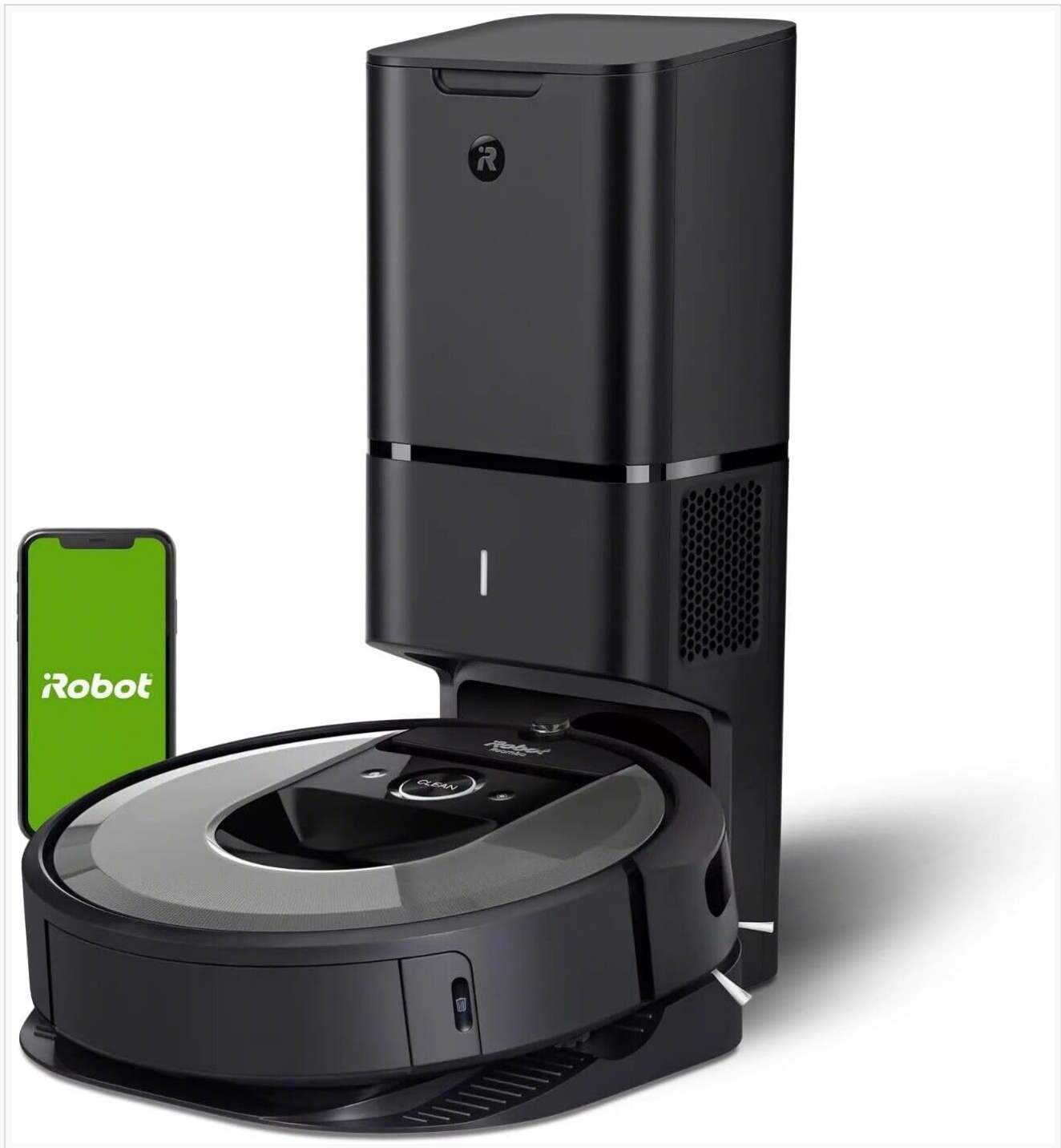
The iRobot Roomba i8+ robot vacuum and its Clean Base, shown alongside a smartphone displaying the iRobot Home app interface.