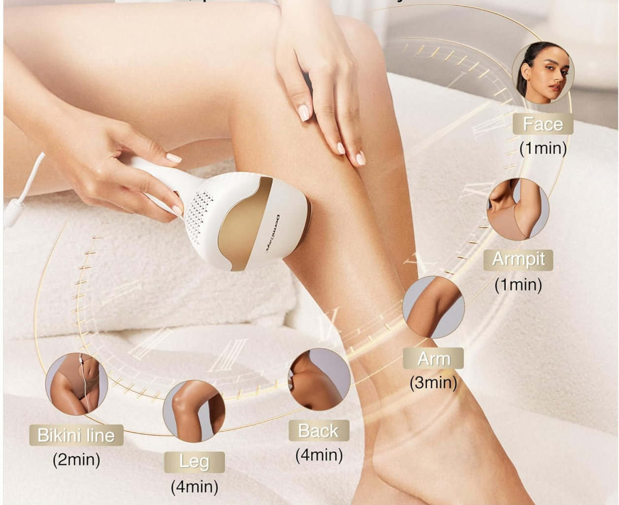
Image: Estimated treatment times for various body parts, totaling 15 minutes for a full body session.