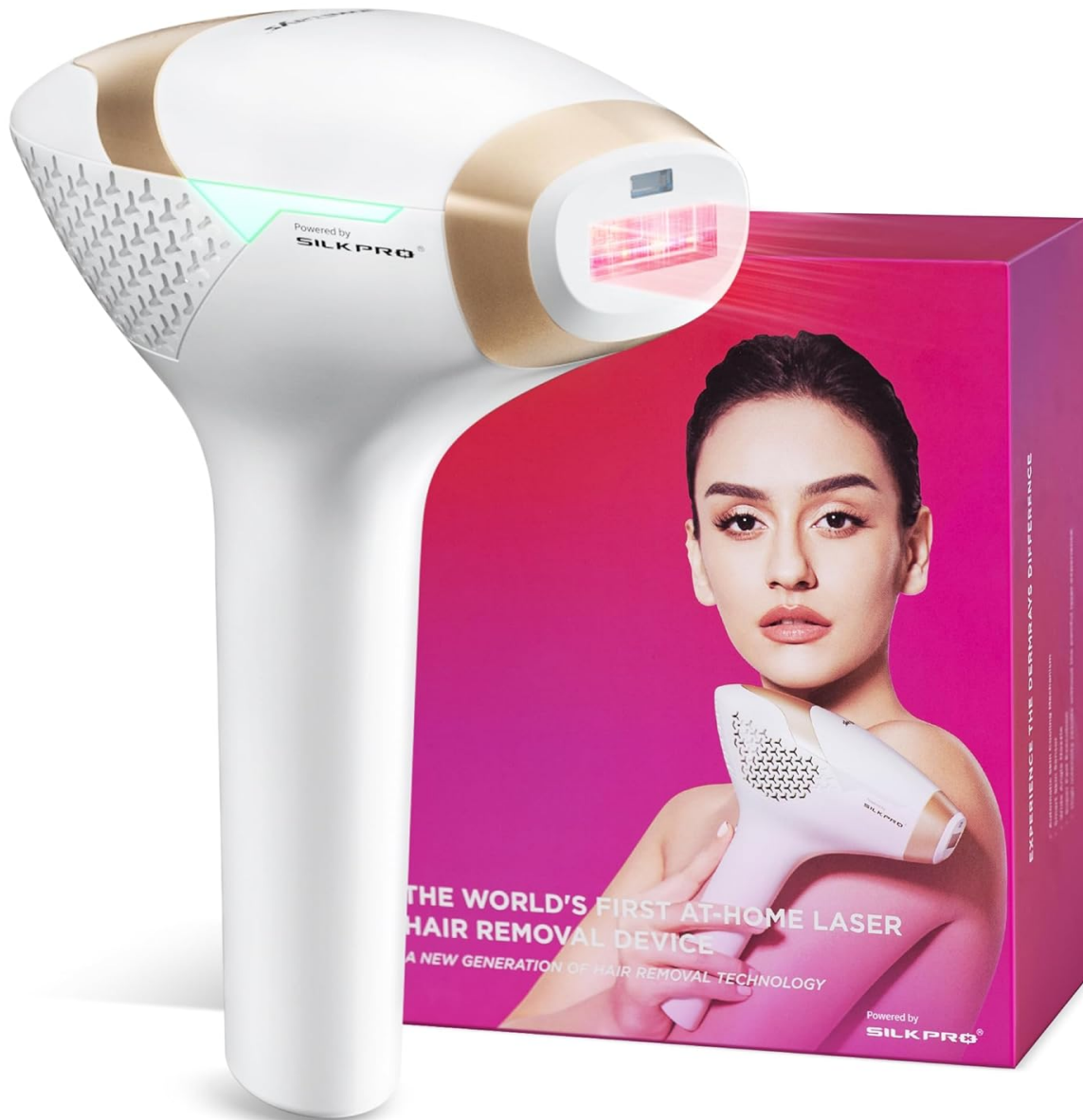
Image: The DermRays 810nm Diode Laser Hair Removal device and its packaging.