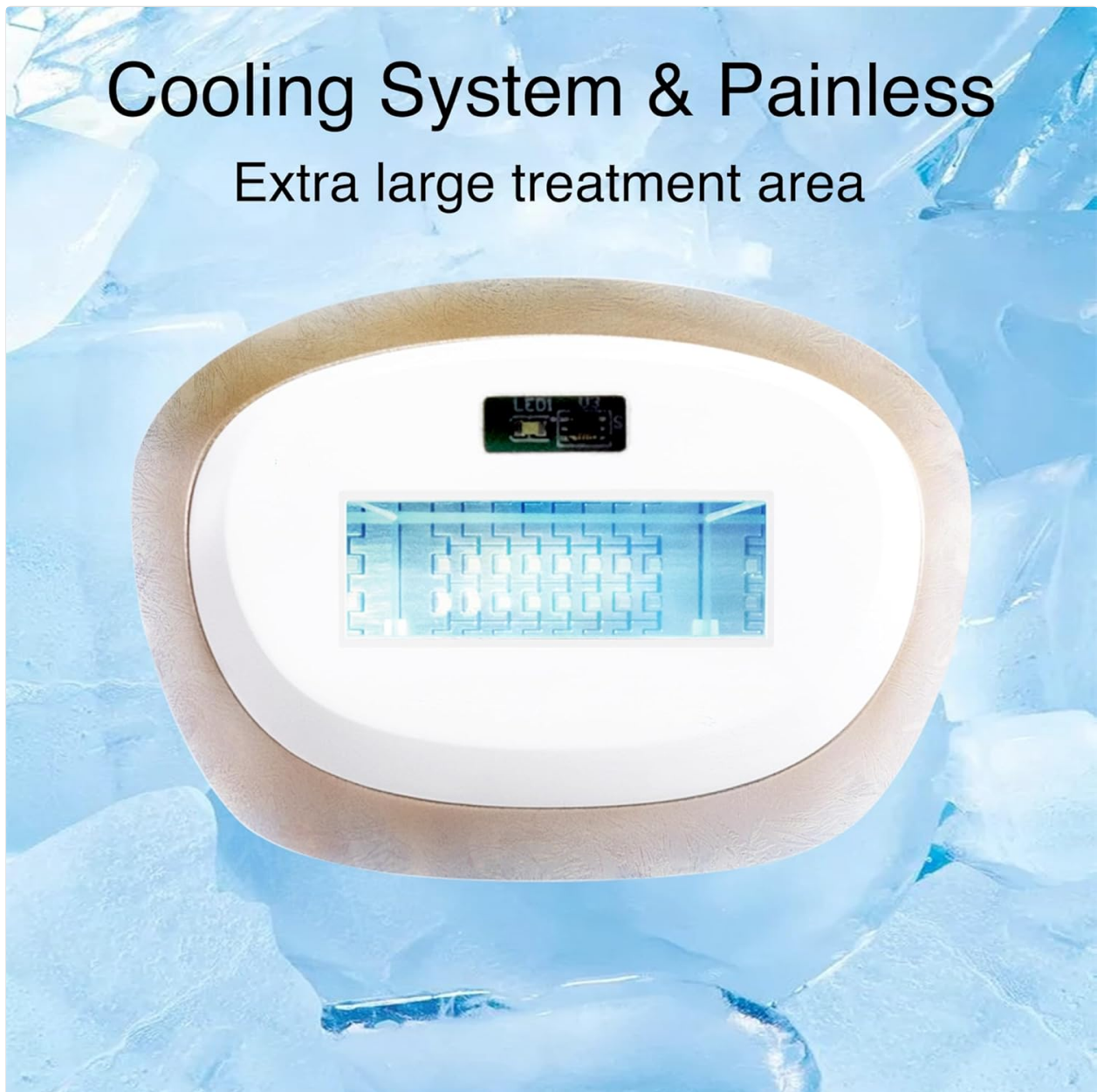
Image: Illustration of the device's cooling system and large treatment area.