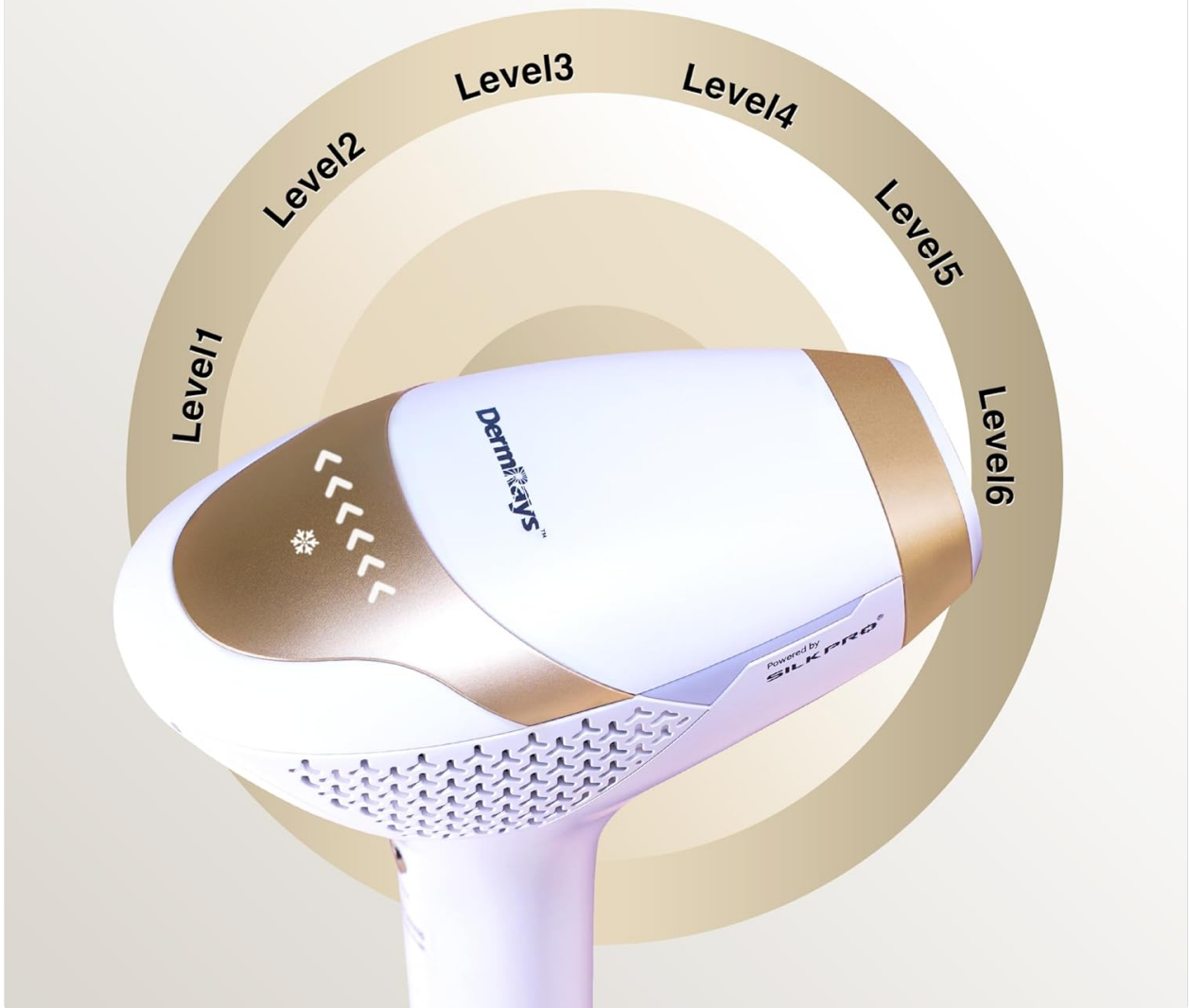
Image: Diagram showing the six adjustable energy levels of the device.