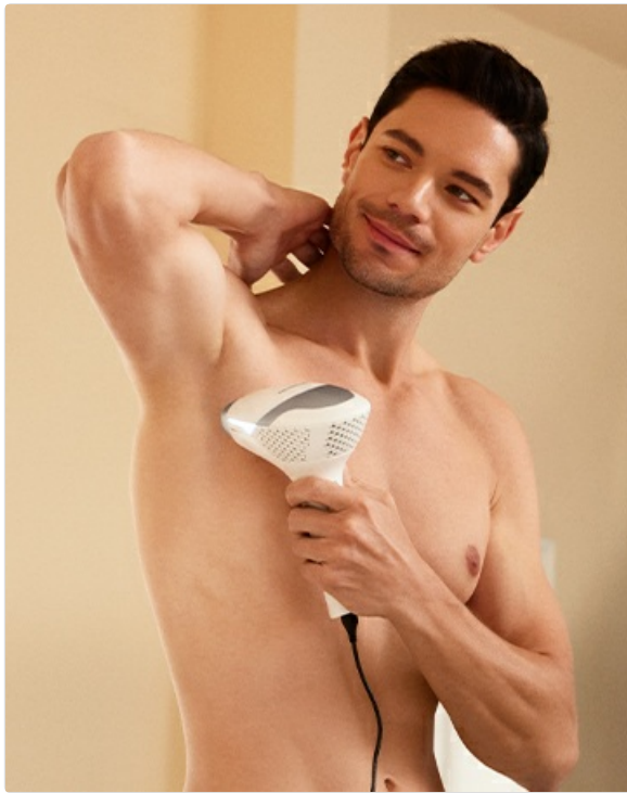
Image: Visual guide for skin preparation and device power-on.