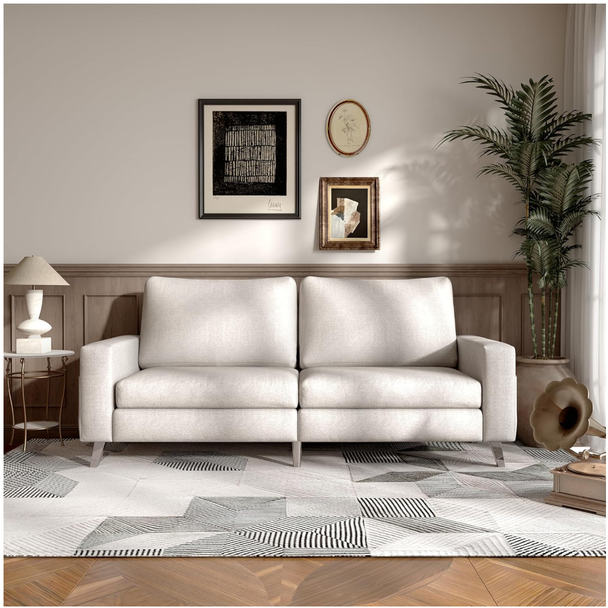
Image: The Esright Cream Sofa Couch, a two-seater, presented in a modern living room environment, showcasing its design and cream upholstery.