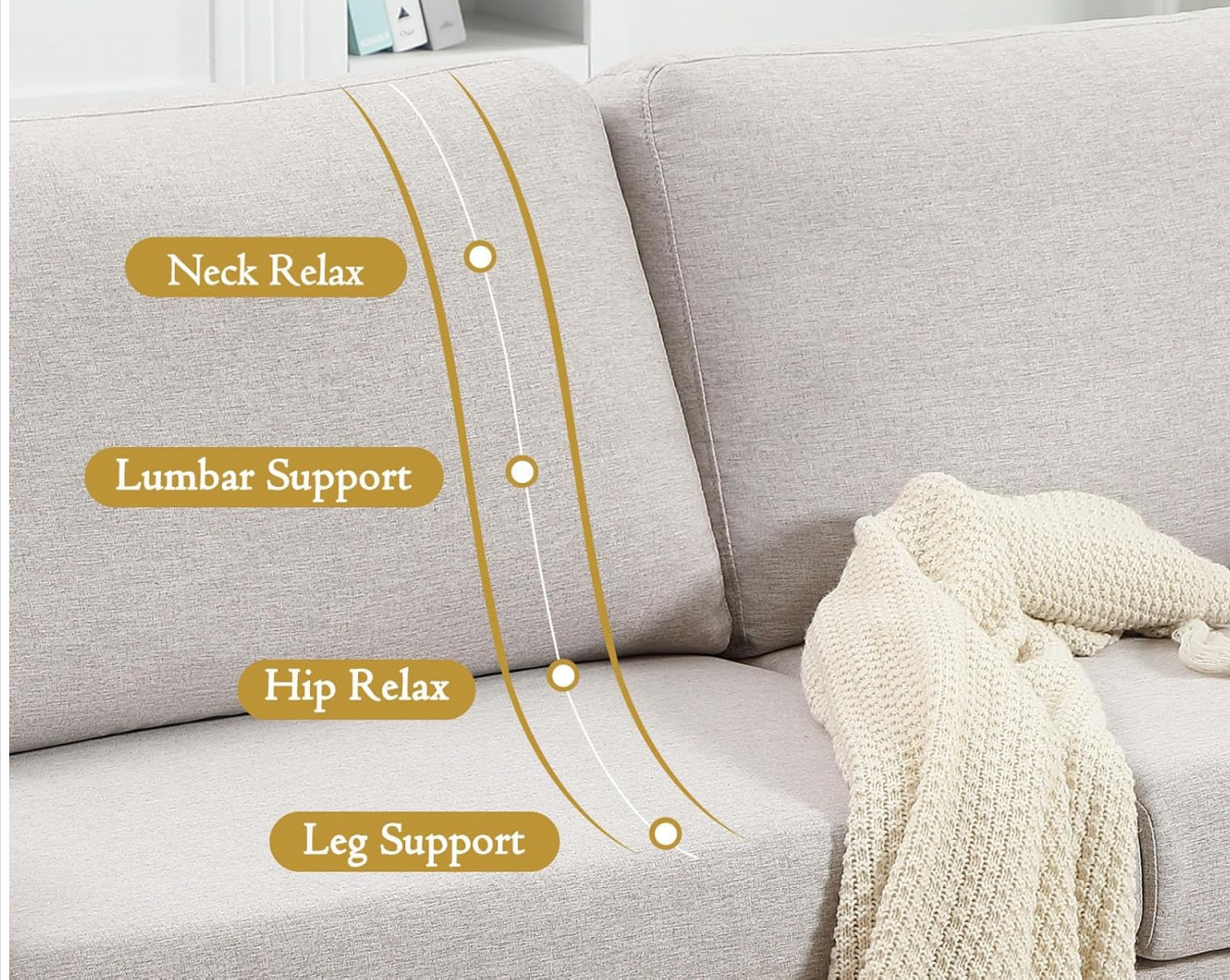
Image: A diagram highlighting the ergonomic design of the sofa, indicating support for the neck, lumbar, hips, and legs.