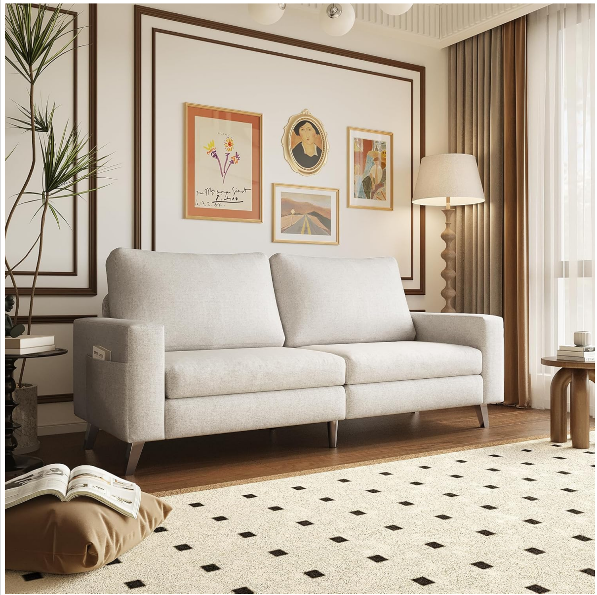
Image: An angled view of the Esright Cream Sofa Couch, showing its full profile and how it fits into a living space.