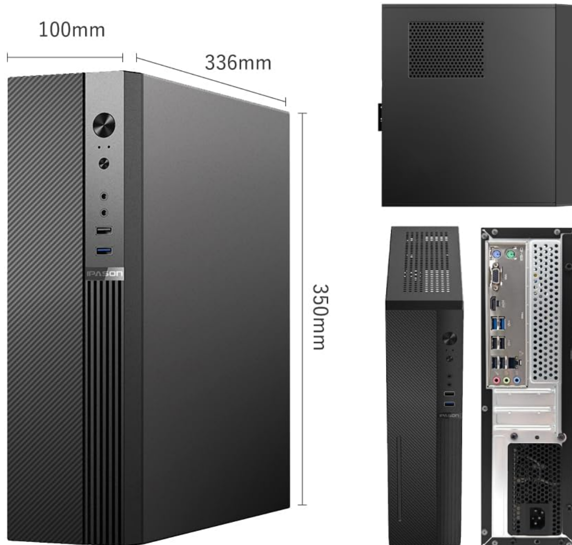
Figure 4.2: Dimensions and various views of the IPASON G-SLIM Desktop PC, including the rear panel with its array of connectivity ports.