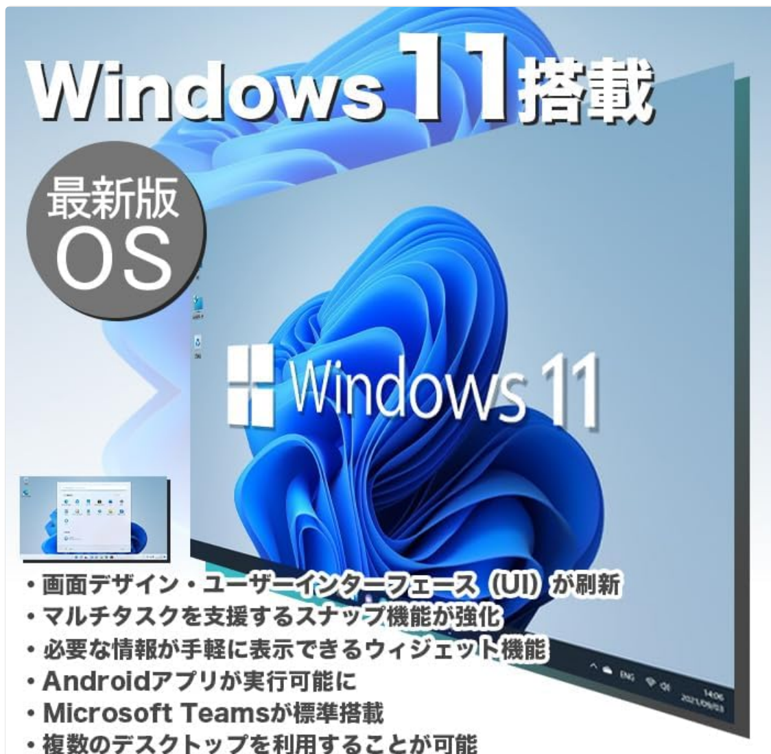
Figure 6.1: Windows 11 interface, showcasing its new design and features.

Your IPASON G-SLIM Desktop PC comes pre-installed with Windows 11, offering a modern and intuitive user experience.