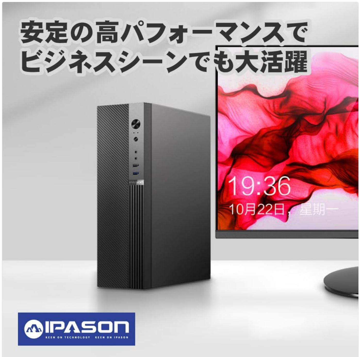
Figure 7.2: The IPASON G-SLIM Desktop PC is designed for stable high performance, suitable for various business scenarios.

Utilizes a 256GB NVMe M.2 SSD, providing significantly faster data transfer speeds compared to traditional SATA SSDs (approximately 7 times faster), resulting in quicker boot times and application loading.