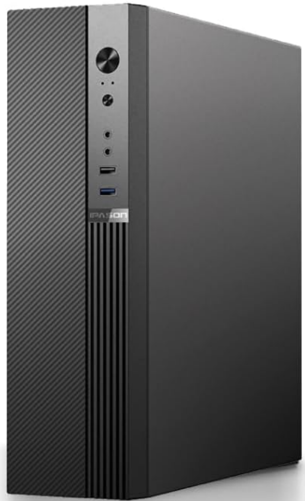
Figure 2.1: The IPASON G-SLIM Desktop PC undergoes rigorous testing to ensure reliability and stability, including 3C certification, drop tests, and temperature/noise control tests.