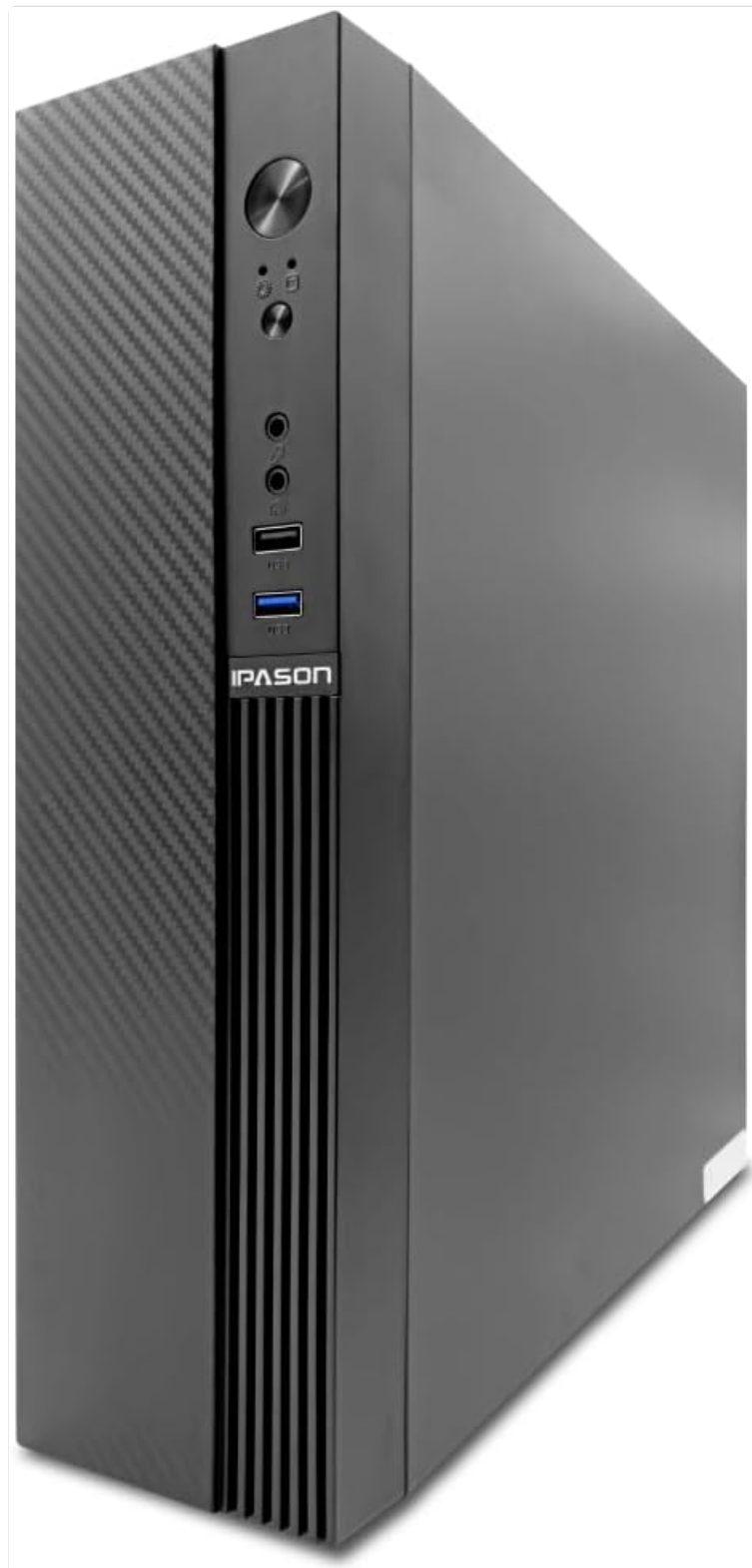
Figure 4.1: Front view of the IPASON G-SLIM Desktop PC, highlighting its sleek design and accessible front ports.