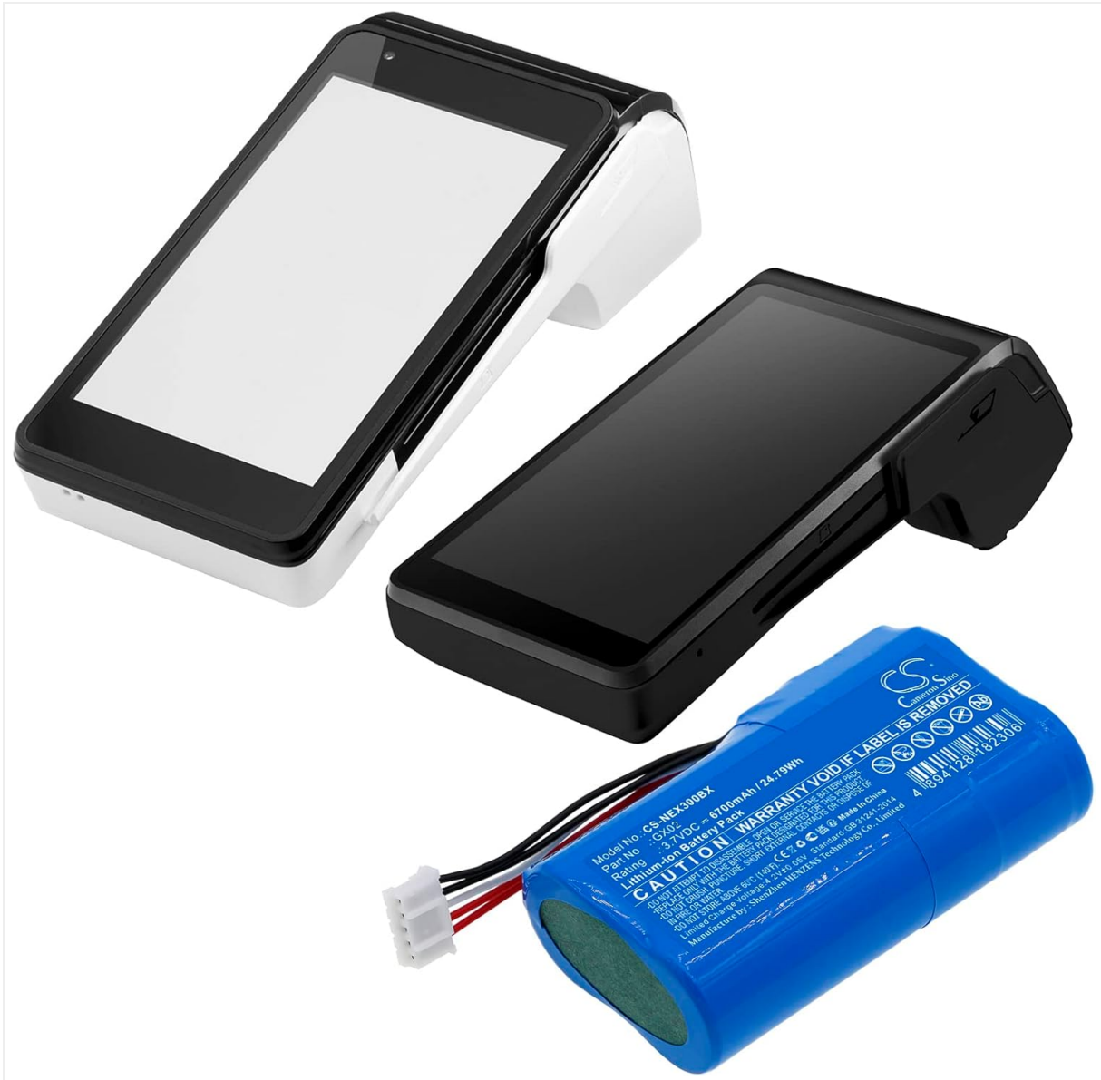
Image: The SPANN CS-NEX300BX battery shown alongside compatible NEXGO payment terminals.