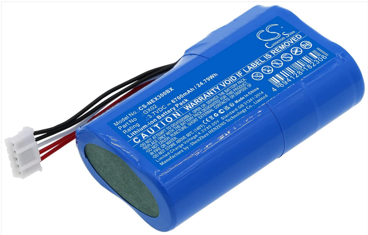
Image: SPANN CS-NEX300BX battery showing safety warnings on its label.