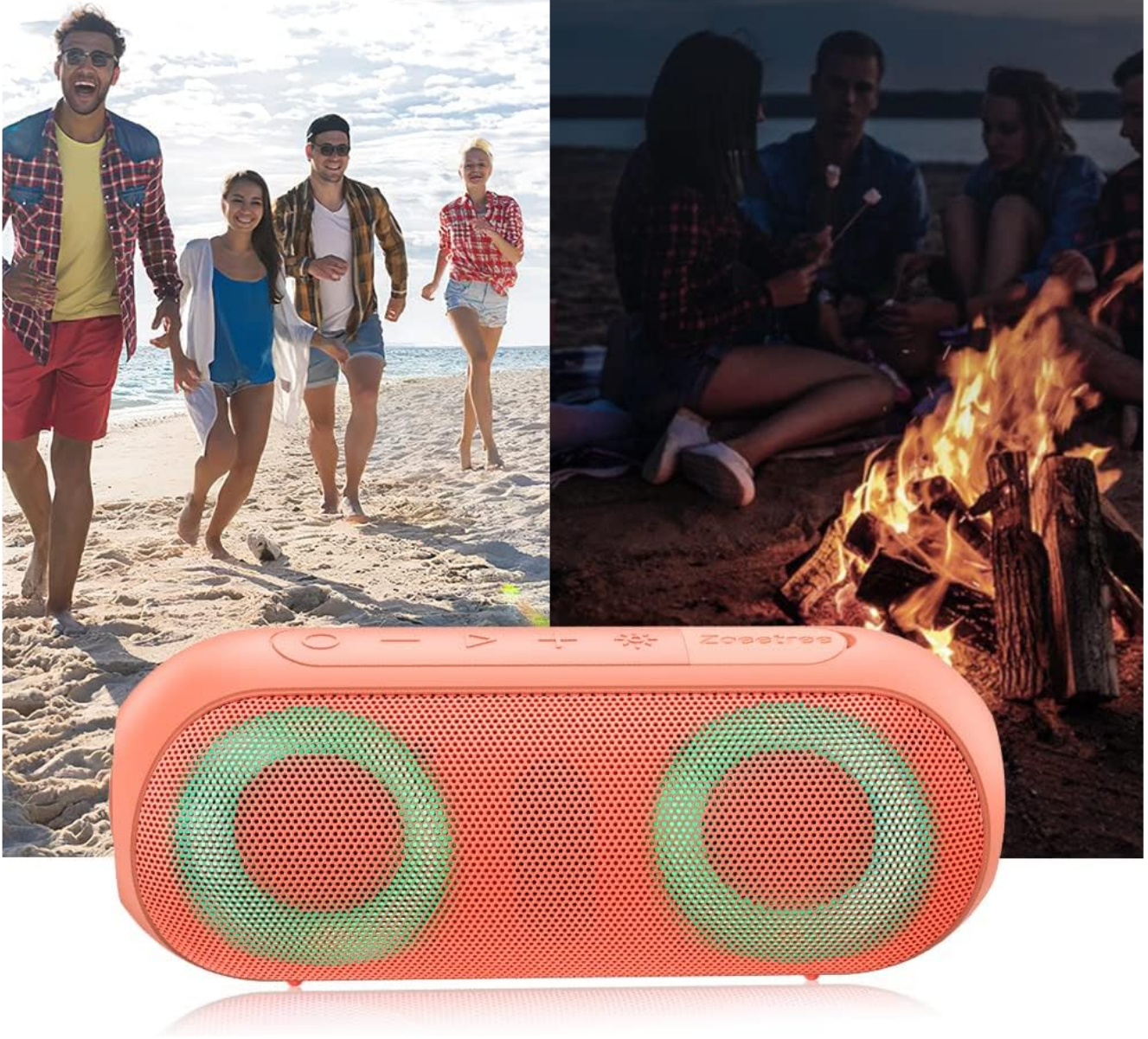
Image: The NOTABRICK speaker positioned below a split image showing people enjoying a beach during the day and gathered around a campfire at night, illustrating its suitability for all-day companionship and superb battery life.