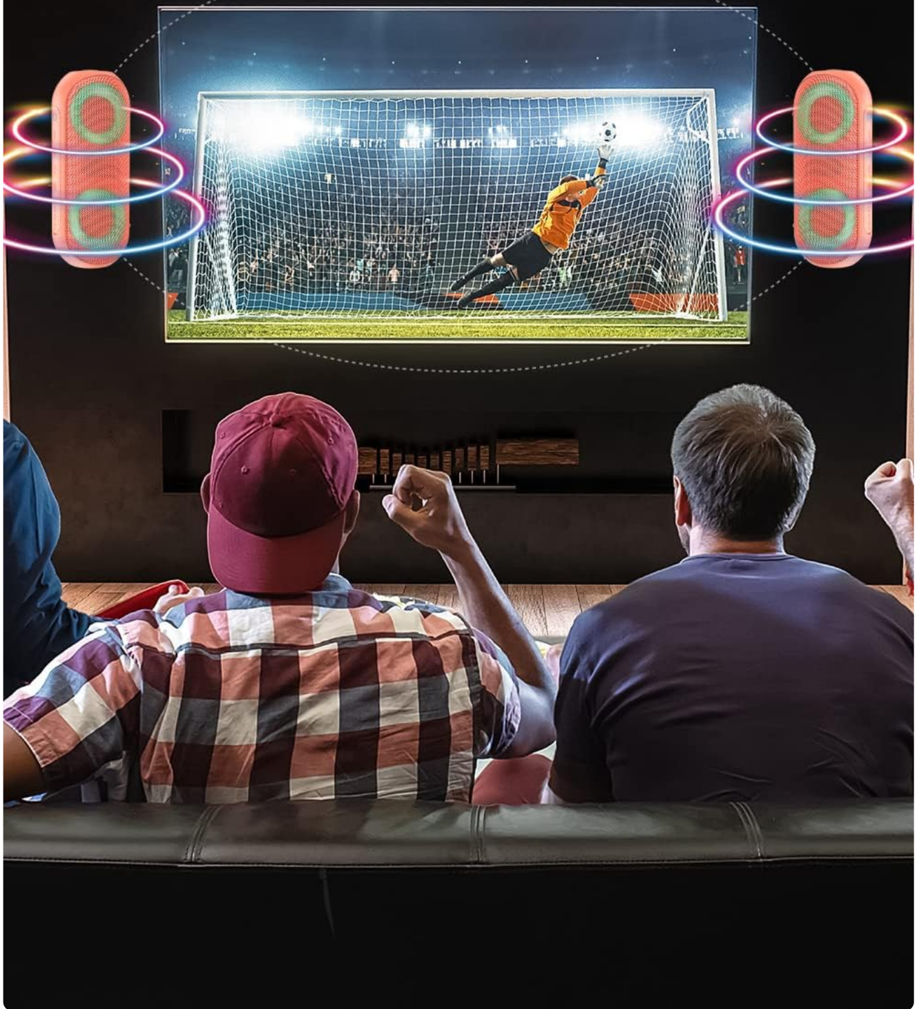
Image: Two NOTABRICK speakers are depicted wirelessly paired, creating a 360-degree immersive surround sound experience for two individuals watching a soccer game on a television, highlighting the TWS function.