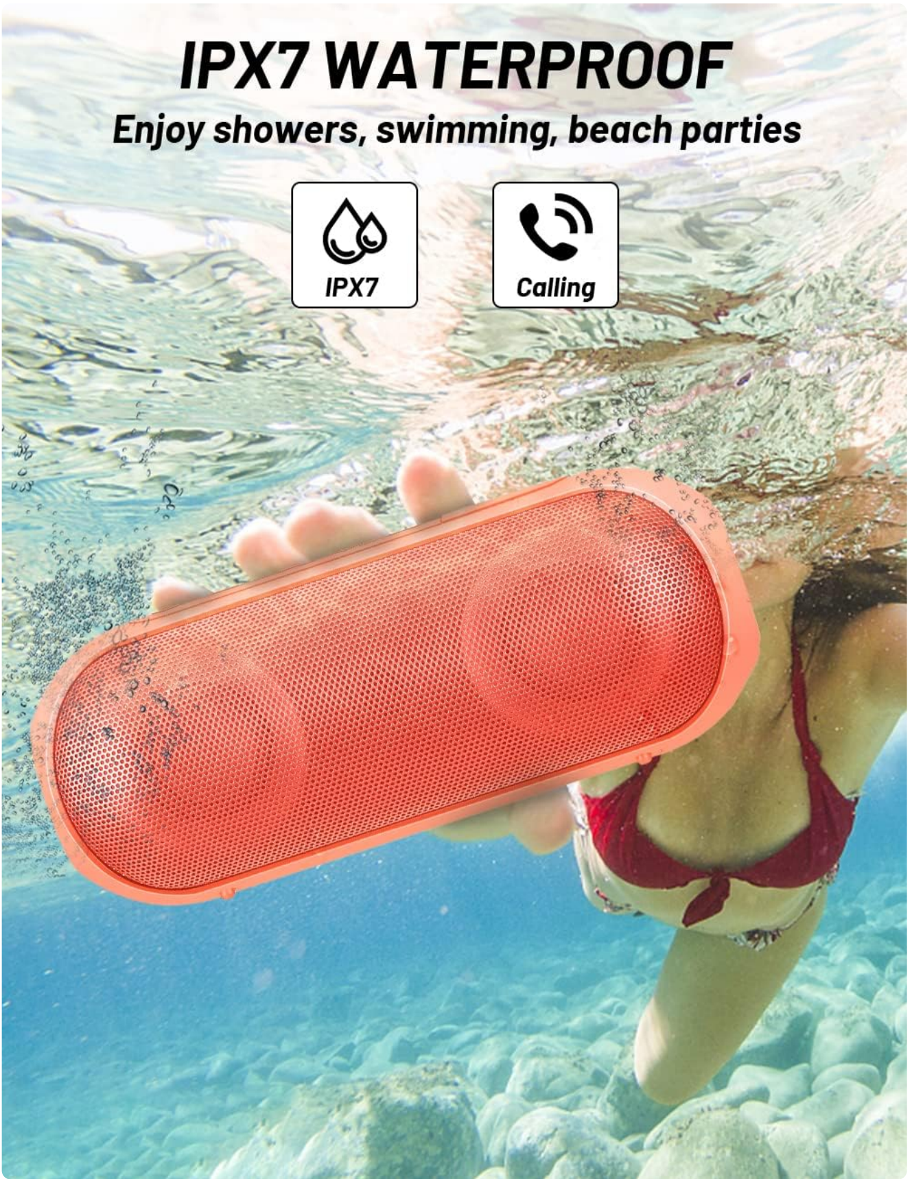
Image: A person holding the orange NOTABRICK speaker partially submerged in clear water, demonstrating its IPX7 waterproof feature for use in aquatic environments.