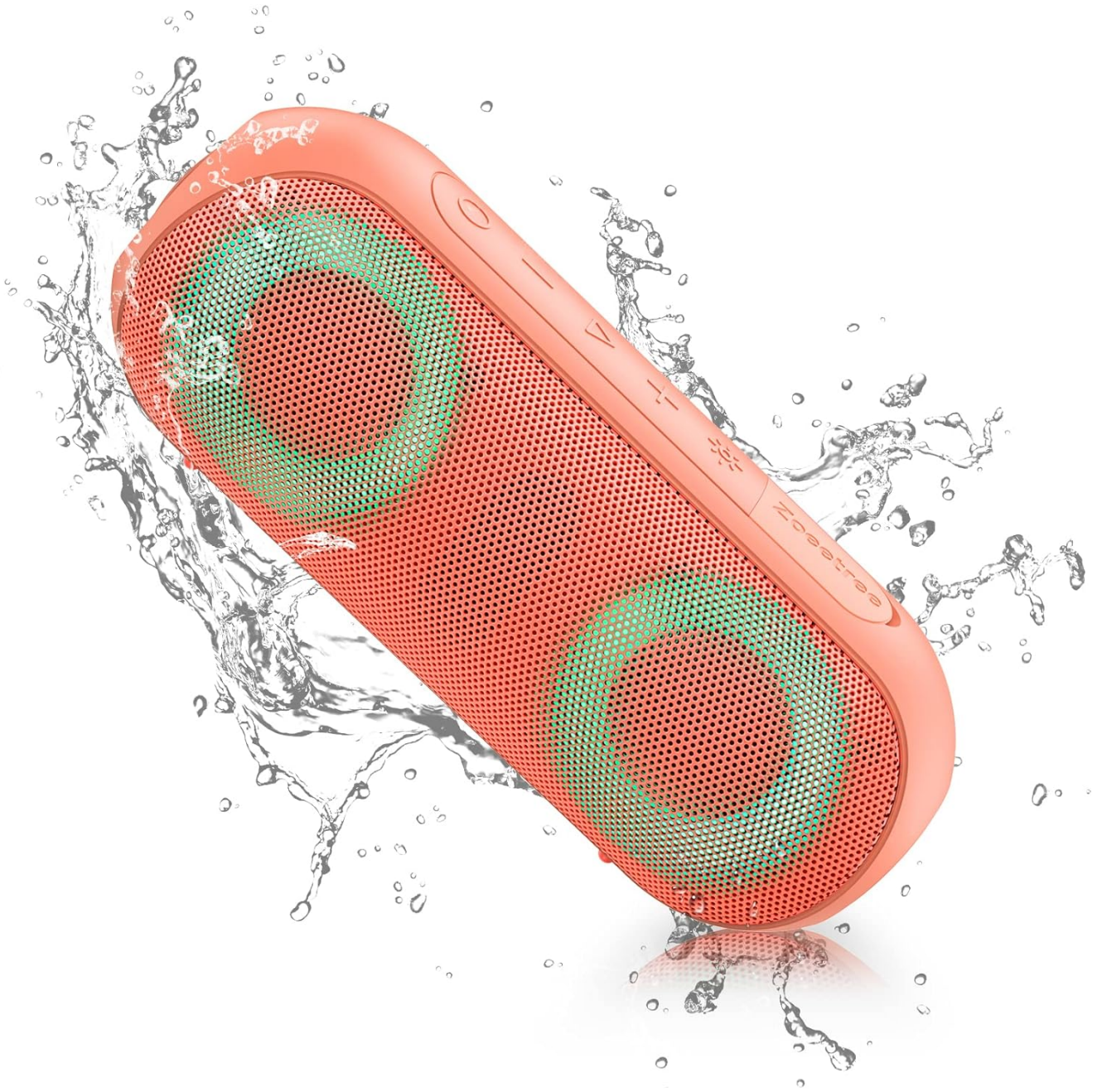
Image: The NOTABRICK Portable Bluetooth Speaker in orange, shown with water splashing around it, highlighting its IPX7 waterproof capability.