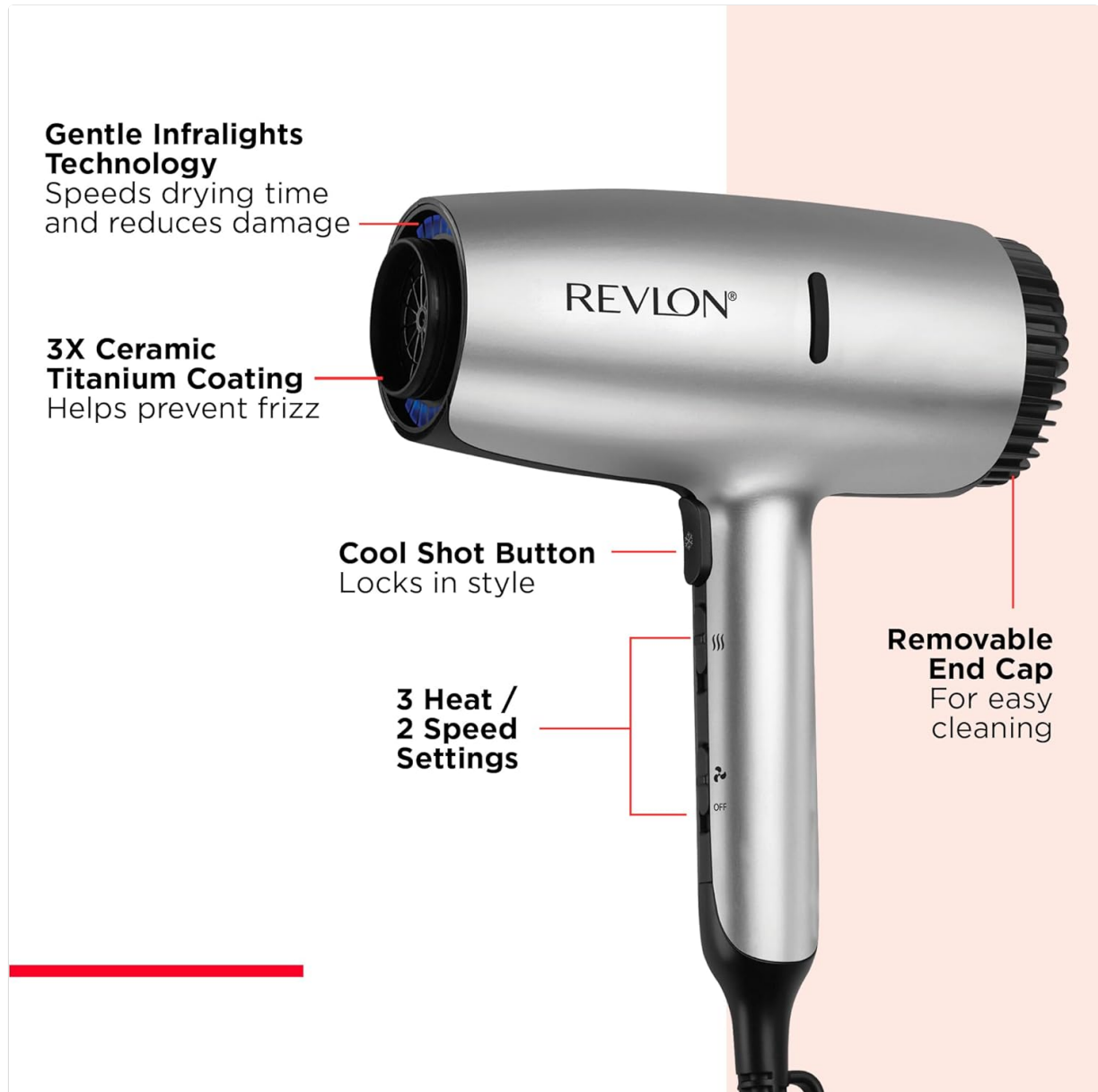
Image: Overview of the hair dryer highlighting key features such as Gentle Infralights Technology, 3X Ceramic Titanium Coating, Cool Shot Button, 3 Heat/2 Speed Settings, and Removable End Cap.

*Compared to RVDR5010, Revlon Frizz Control Styler.