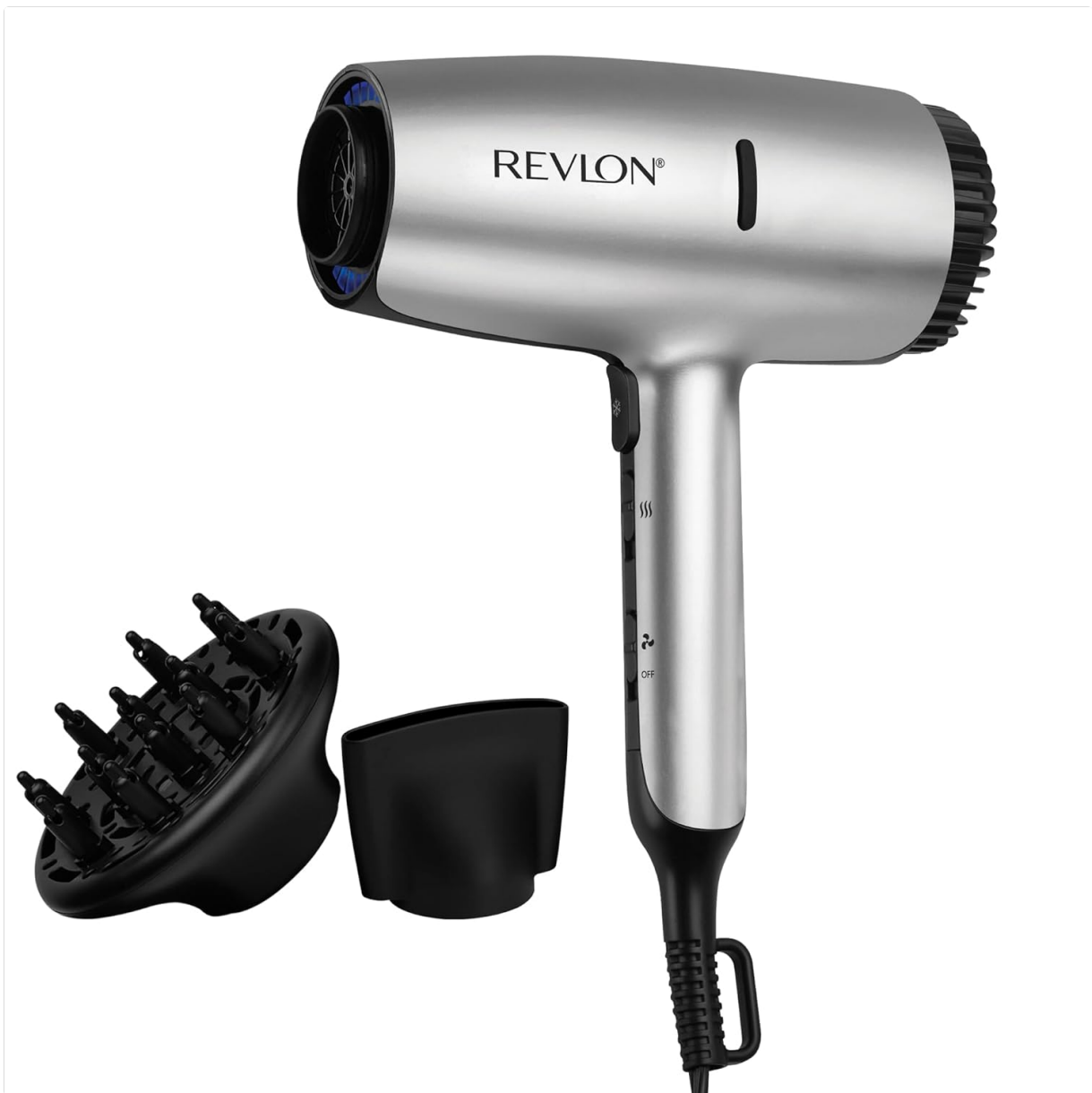
Image: REVLON Dry Max Hair Dryer with its included diffuser and concentrator attachments.