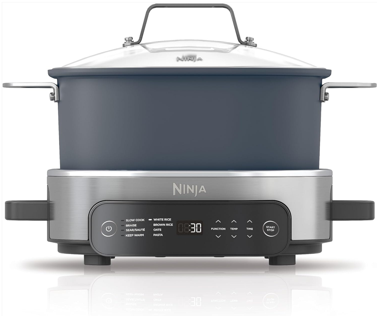
The Ninja MC1101 Foodi Everyday Possible Cooker Pro in Midnight Blue, showing the main unit, cooking pot, and control panel.