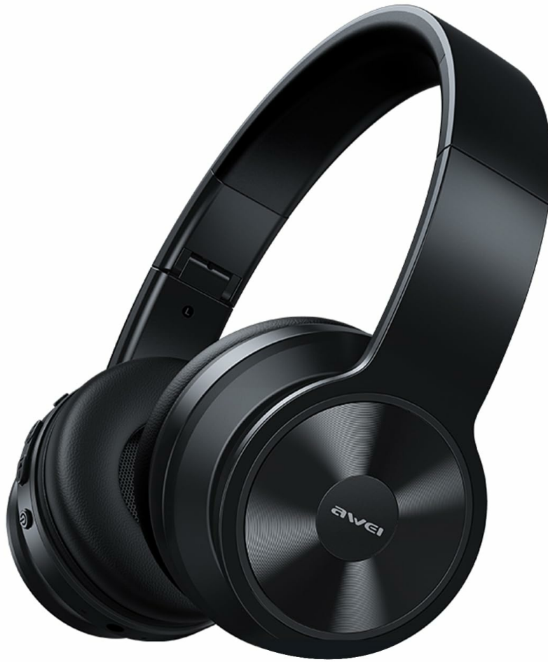
Image: AWEI A996BL over-ear headphones, showcasing their design.

The AWEI A996BL headphones feature advanced Bluetooth 5.3 technology for stable connections, 40mm drivers for immersive stereo sound, and a comfortable, foldable design with soft protein earpads. Enjoy up to 16 hours of playtime on a single charge, with the flexibility of both wireless and wired (AUX) listening modes.