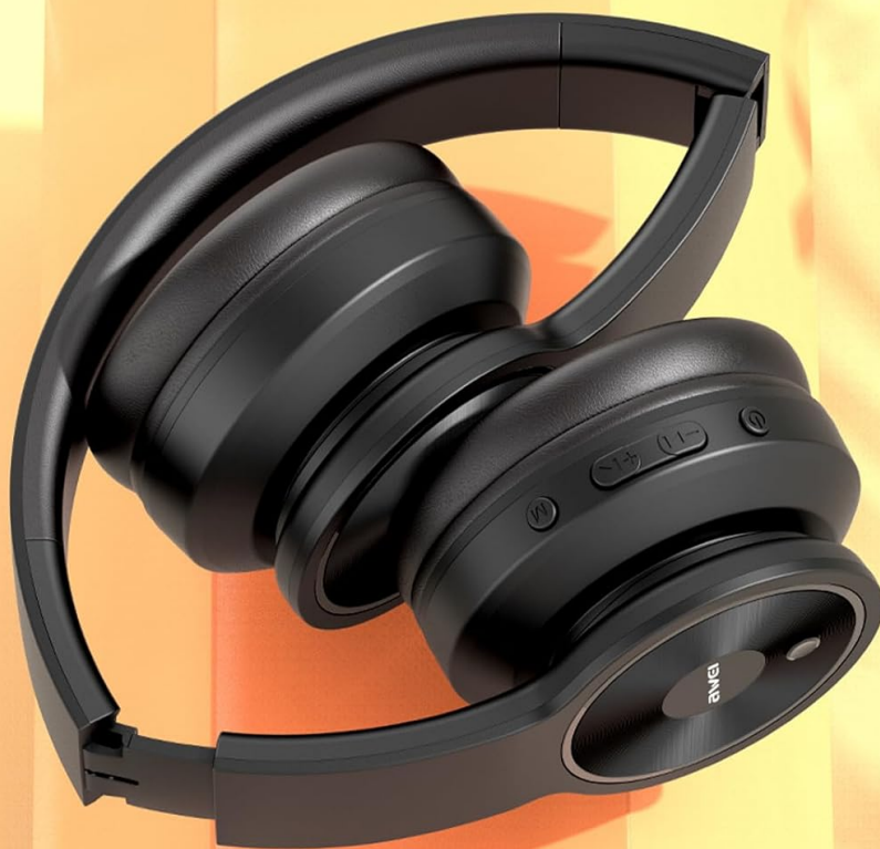
Image: The AWEI A996BL headphones in a folded position, demonstrating their portable and easy-to-store design.

Countless adjustments and optimizations have been made to materials, shapes, and functions, et