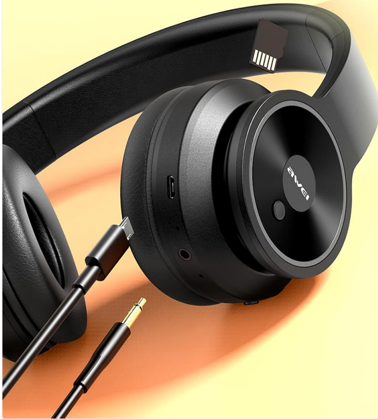
Image: Headphones showing both USB-C charging port and 3.5mm AUX port, illustrating wired and wireless options.

When the headset is out of power, it can be connected to the device through AUX, which is also suitable for desktop computers without Bluetooth