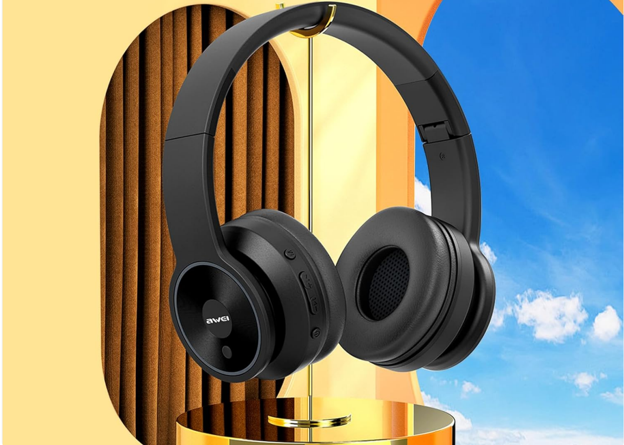
Image: Right earcup of the AWEI A996BL headphones, highlighting the control buttons.