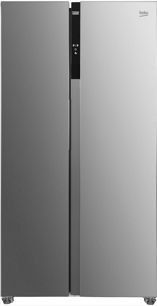
Front view of the Beko GNO5323XPN refrigerator, showcasing its sleek stainless steel design and integrated display panel.