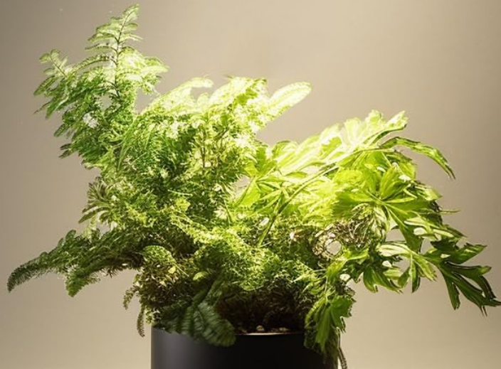
Image: VALIKIY Grow Light providing full spectrum warm white light to a plant.