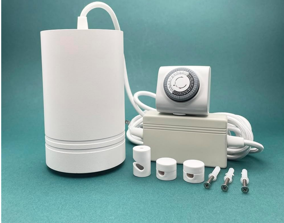
Image: Contents of the VALIKIY Hanging Grow Light package.