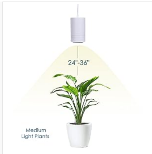
Image: Installation diagram for the VALIKIY Hanging Grow Light.