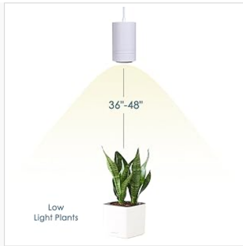
Image: Recommended distance for low light plants.