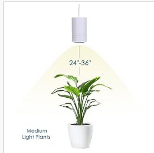
Image: Recommended distance for medium light plants.