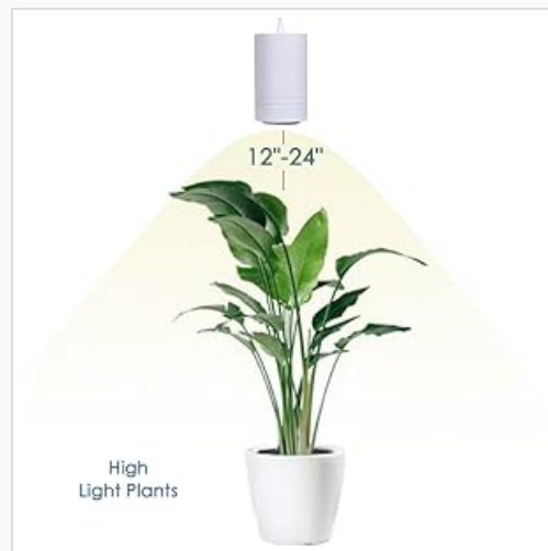
Image: Recommended distance for high light plants.