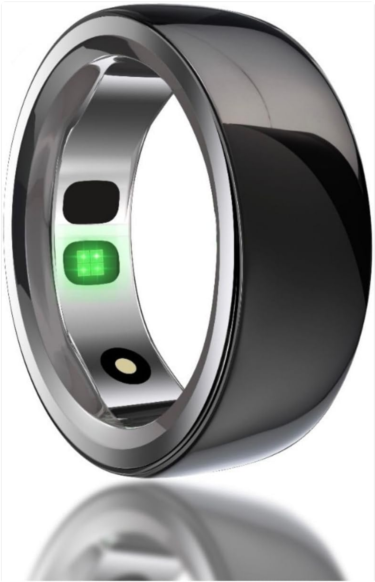
Image: The HiFuture Future Ring, showcasing its sleek design and internal sensors.