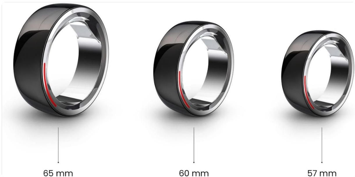
Image: Comparison of different HiFuture Future Ring sizes (57mm, 60mm, 65mm).