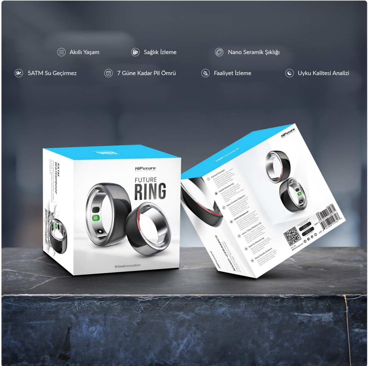
Image: The HiFuture Future Ring packaging, showing the product box.

Upon unboxing your HiFuture Future Ring, it is recommended to fully charge the device before first use. Use the provided charging cable and connect it to a compatible USB power source.