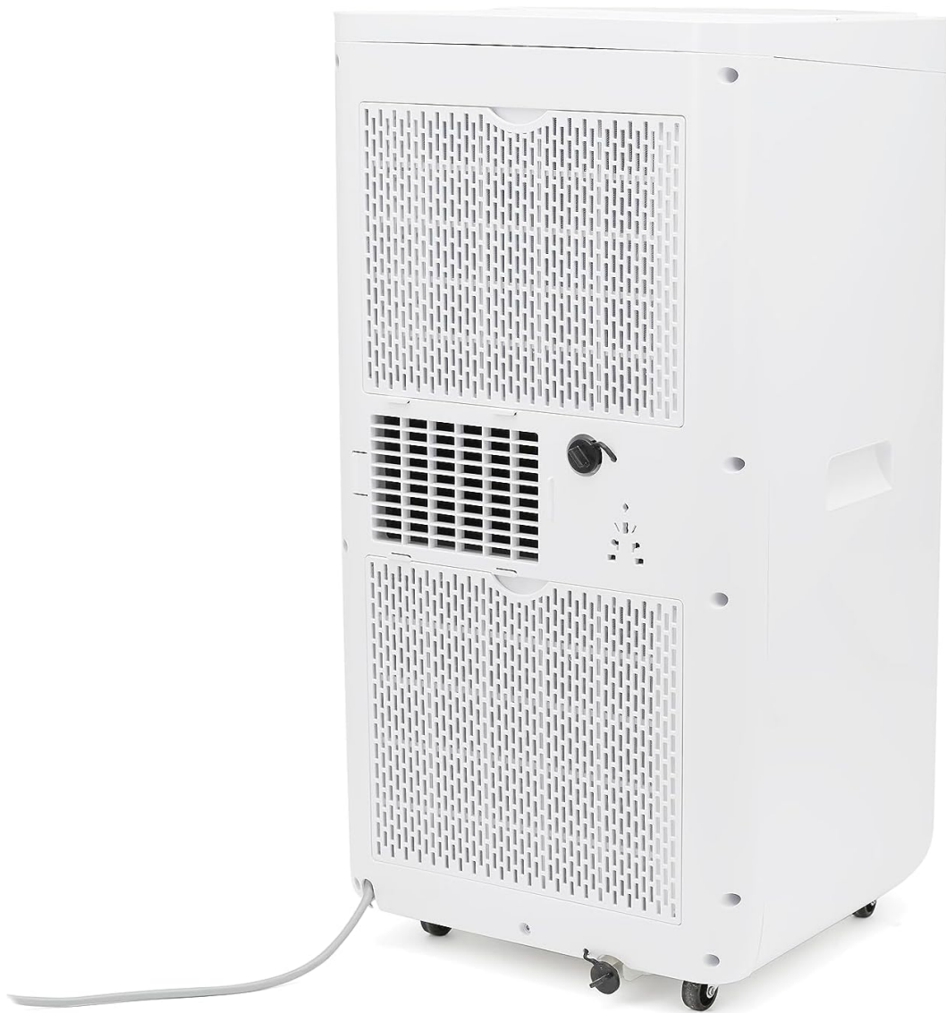
Figure 4.1: Rear view of the unit, showing the exhaust port where the hose connects to expel hot air.