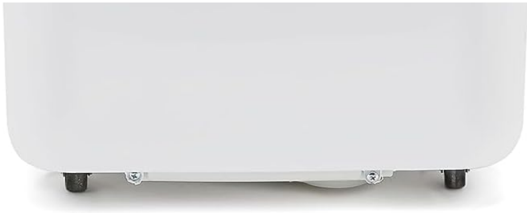
Figure 3.1: Front view of the Wood's Como 12k Smart Air Conditioner, showing its sleek white design and the Wood's logo.