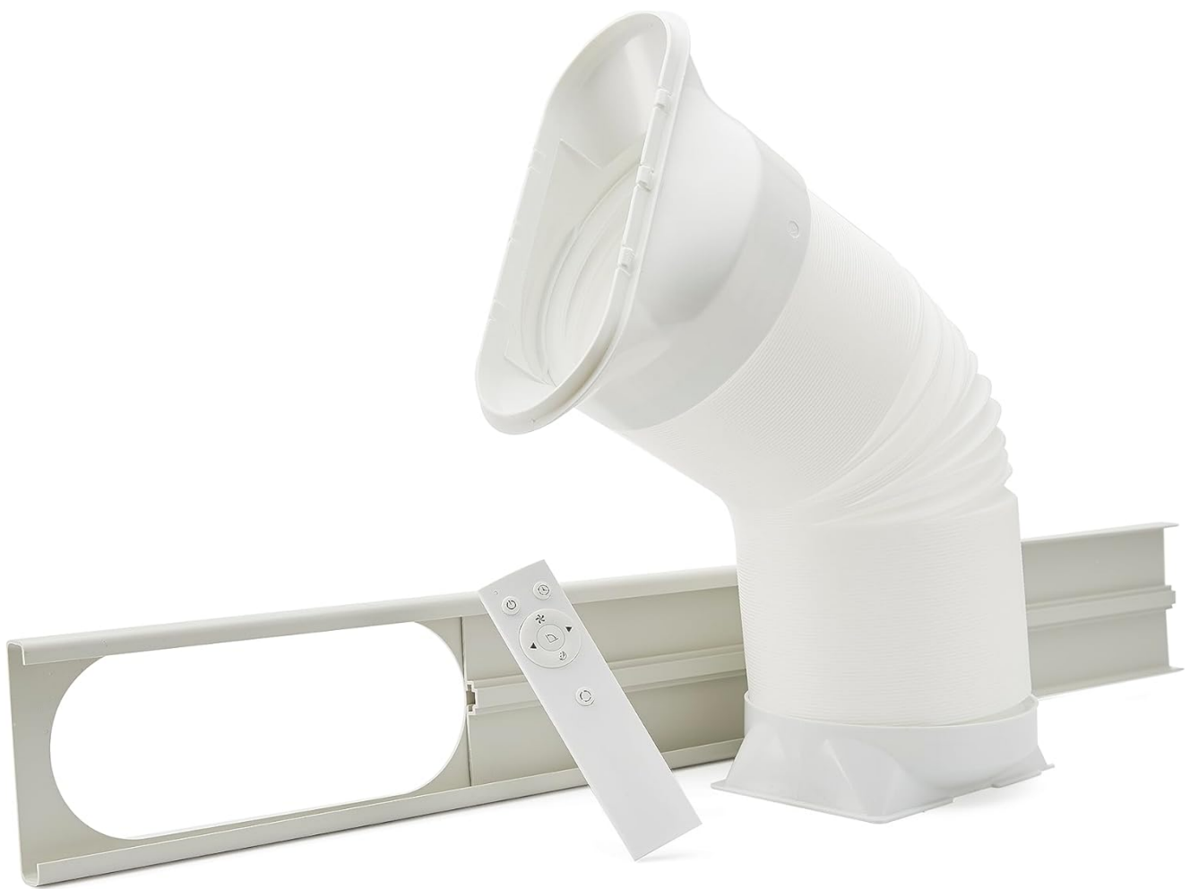
Figure 3.3: Included accessories: remote control, exhaust hose, and window kit for easy installation without drilling.