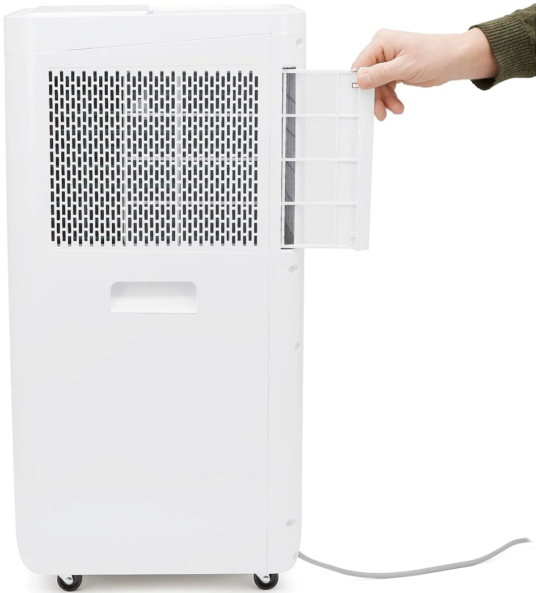
Figure 6.1: A hand demonstrating the removal of the washable air filter from the side of the unit.