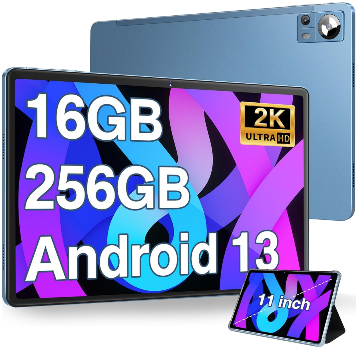
The DMOAO D11 Android 13 Tablet, featuring an 11-inch 2K FHD display.