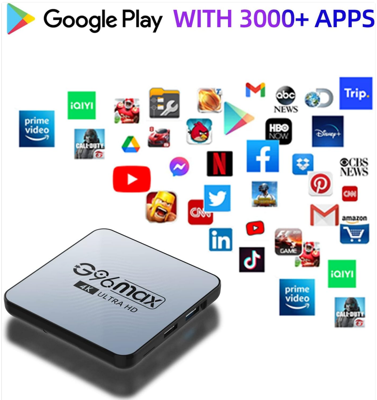
Image: A visual representation of the Google Play Store interface, surrounded by numerous popular application icons, indicating the wide range of apps available for download.

The CHROX G96max TV Box comes with the Google Play Store pre-installed, allowing access to thousands of applications.