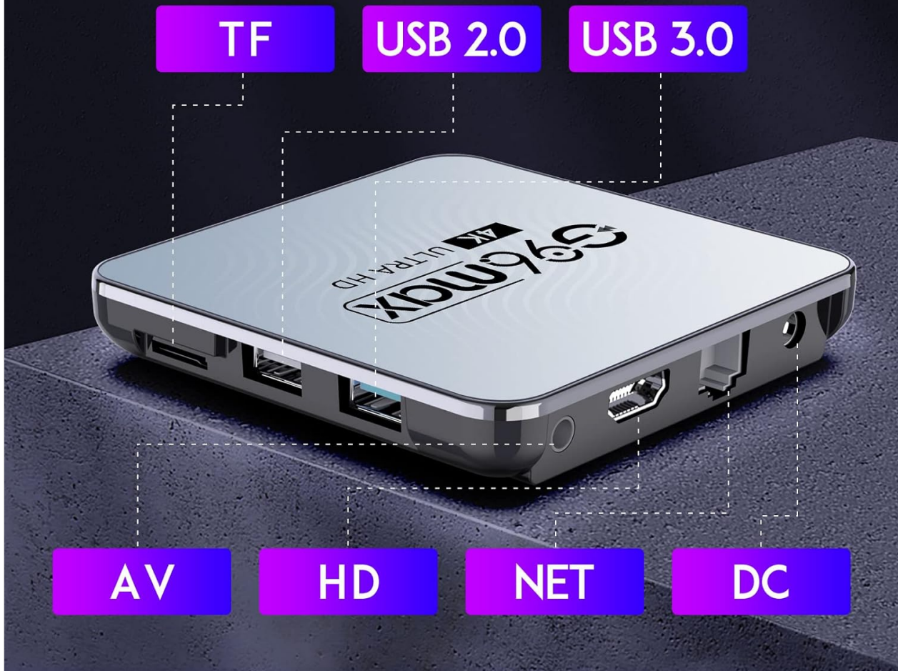
Image: A detailed view of the CHROX G96max TV Box, highlighting its various input/output ports including TF card slot, USB 2.0, USB 3.0, AV, HDMI, Ethernet (NET), and DC power input.