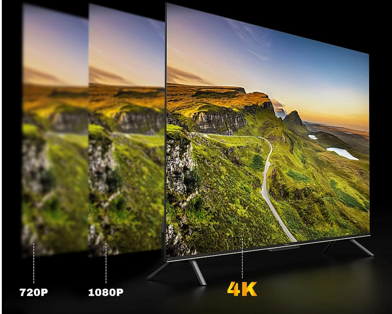
Image: A visual comparison demonstrating the clarity and detail difference between 720p, 1080p, and 4K video resolutions, emphasizing the TV Box's 4K decoding capability.