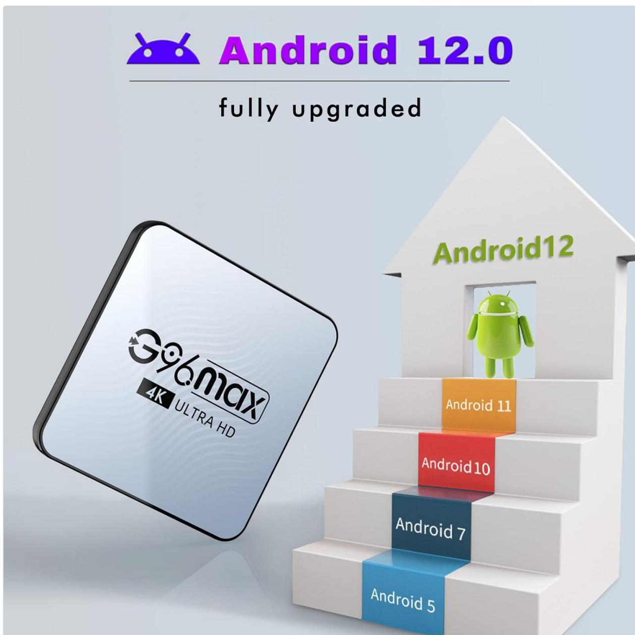
Image: An illustration showing the progression of Android versions, highlighting Android 12.0 as the latest upgrade for the G96max TV Box.

Use the provided IR remote control or the wireless mini keyboard to navigate the Android 12.0 interface. The remote typically includes directional buttons, an 'OK' button for selection, 'Back' button, 'Home' button, and volume controls.