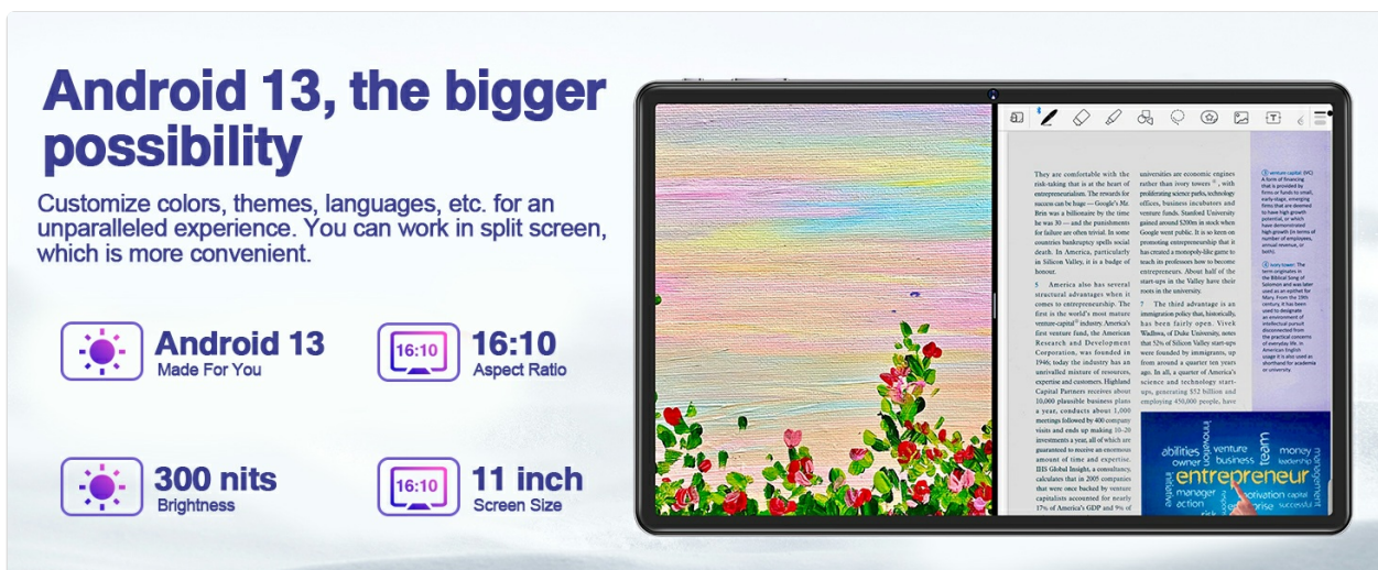
Image: The DMOAO D11 tablet utilizing split-screen mode, showing two different applications open simultaneously for enhanced productivity.

4. Choose the second application from your recent apps or app drawer to fill the other half of the screen.