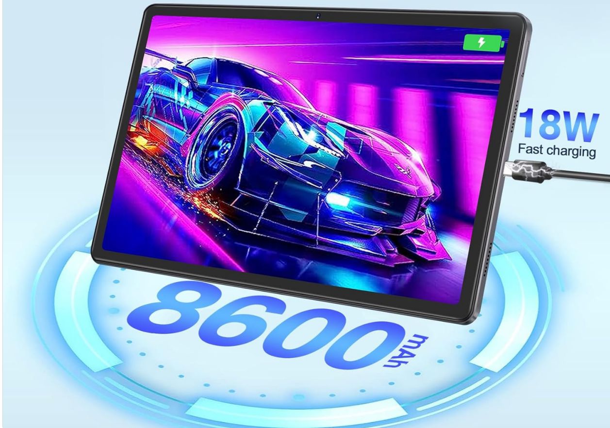
Image: The DMOAO D11 tablet connected to its charger, emphasizing its 8600mAh battery and fast charging feature.