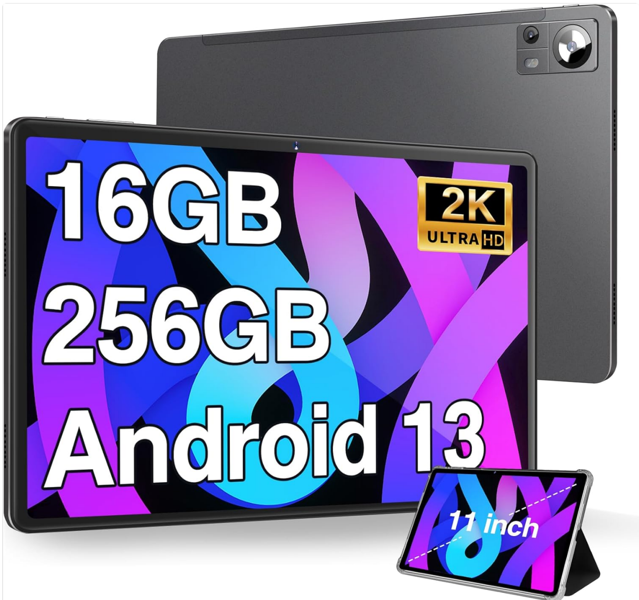
Image: Front and back views of the DMOAO D11 tablet, showcasing the 11-inch display and the rear camera setup.

Familiarize yourself with the physical components and features of your DMOAO D11 tablet.