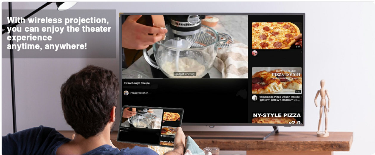
Image: The DMOAO D11 tablet demonstrating wireless projection, allowing users to view tablet content on a larger external display.