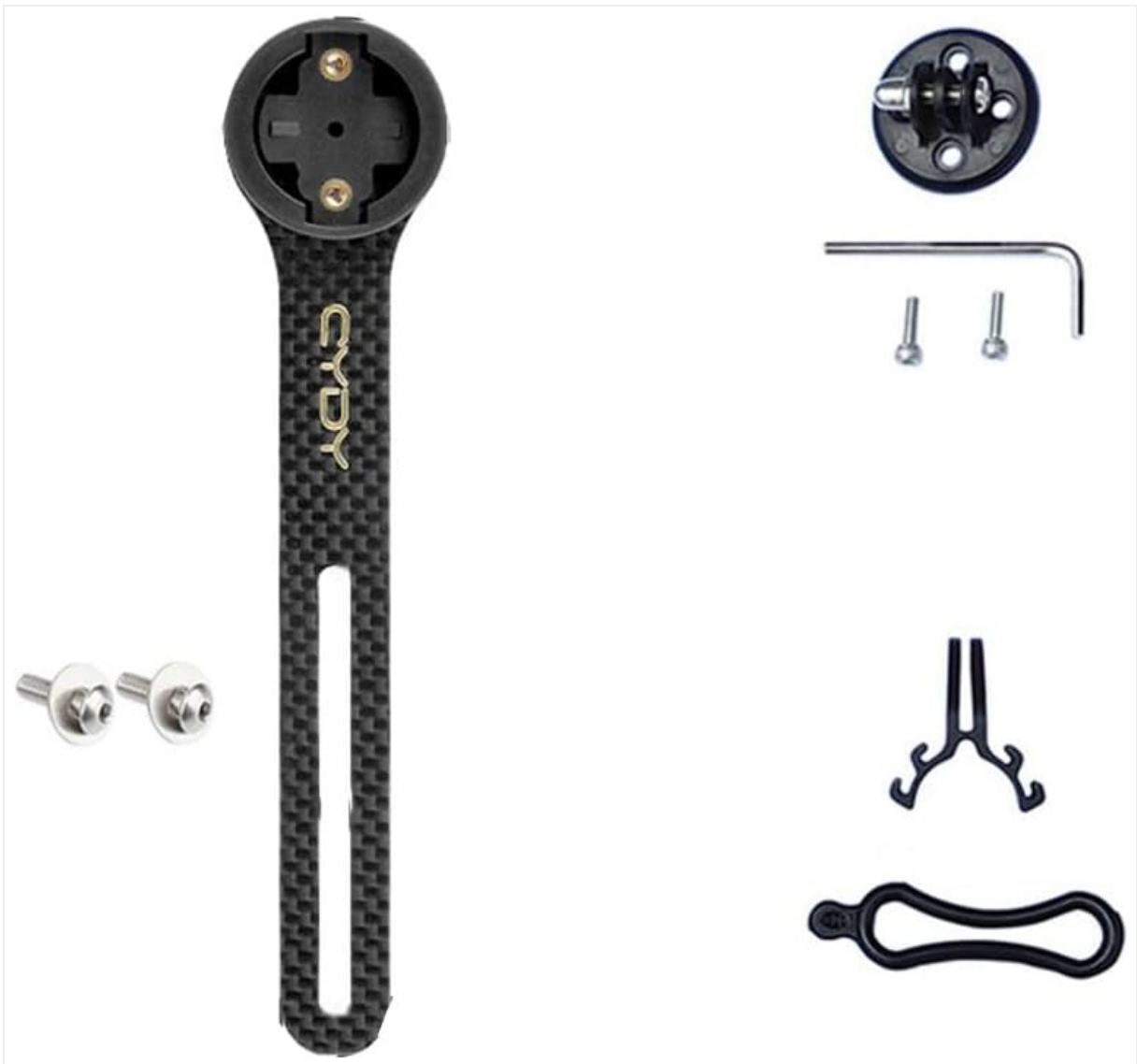
Image: Overview of the product contents, including the carbon fiber mount, screws, Allen wrench, camera mount adapter, and light clip.