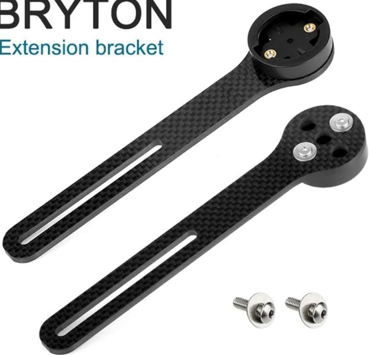
Image: Two views of the carbon fiber extension bracket, showcasing its sleek design and the attachment points for the computer base and accessories.