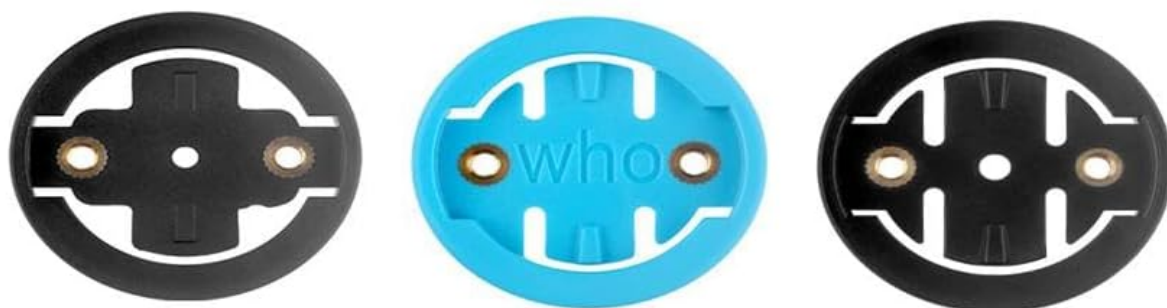
Image: Display of the three included computer bases, compatible with Bryton, Garmin, and Wahoo bike computers, highlighting the mount's versatility.