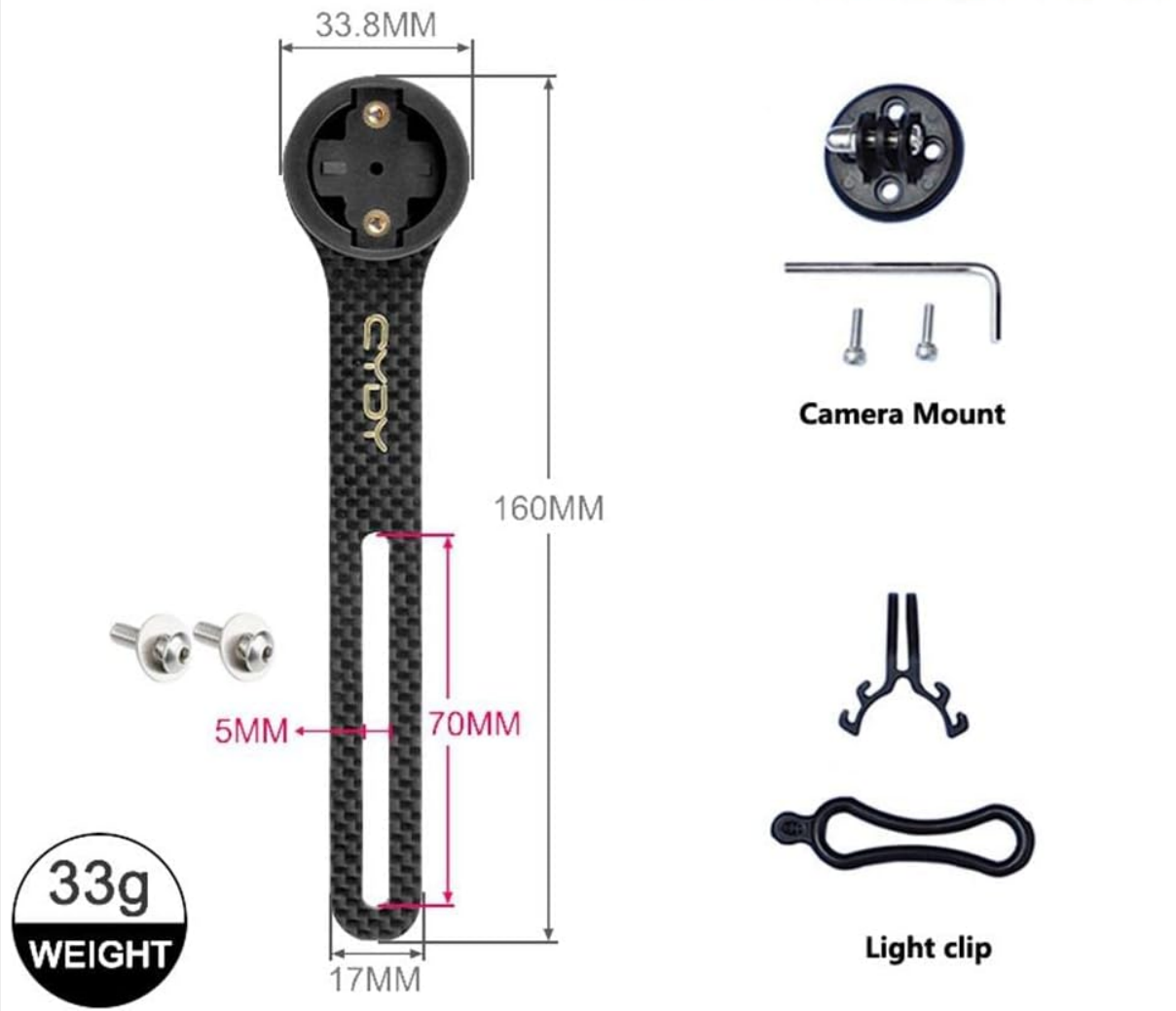
Image: Detailed diagram illustrating the mount's dimensions (length 160mm, width 33.8mm, slot length 70mm, slot width 5mm, base width 17mm) and its lightweight 33g design.