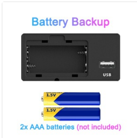
Illustration of the battery backup compartment, requiring 2 AAA batteries (not included).