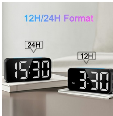
The alarm clock showing both 12-hour (PM) and 24-hour time formats.