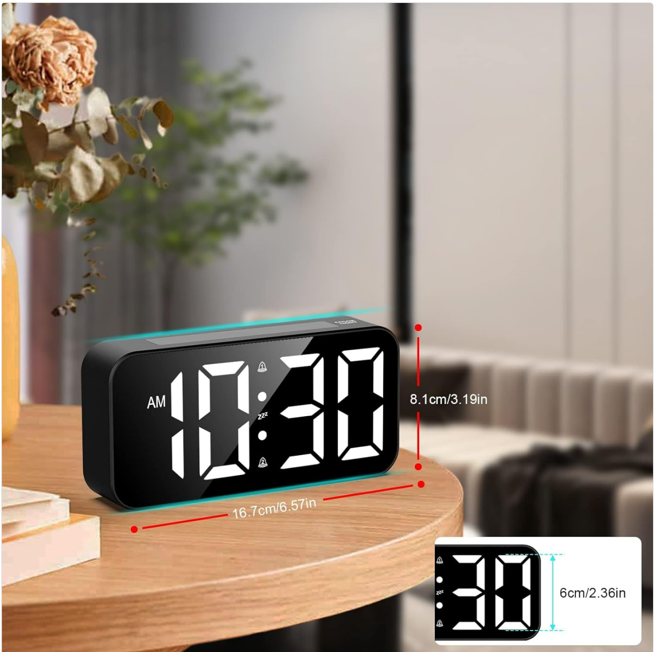
The alarm clock with its physical dimensions (length, width, height) indicated for reference.