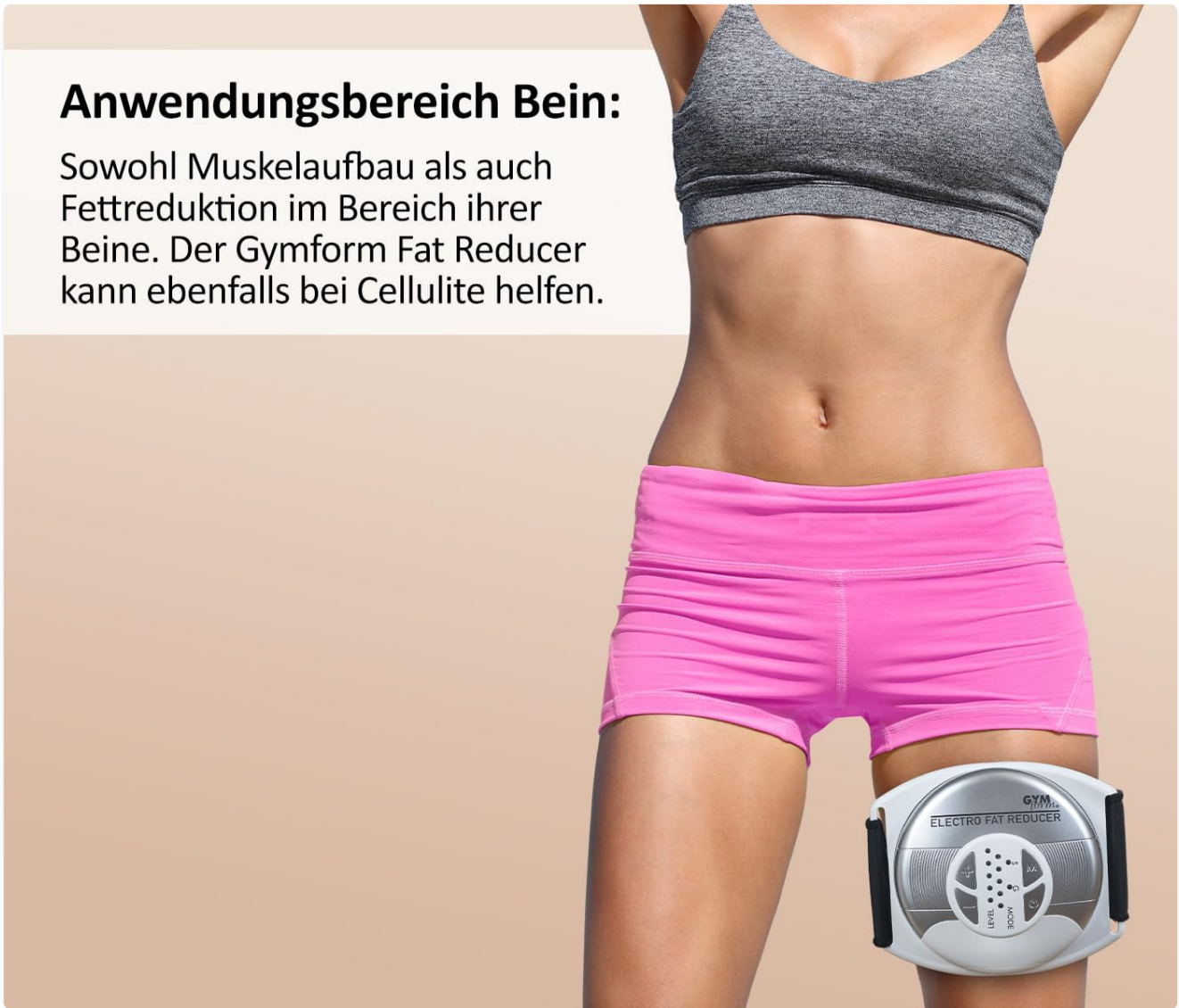
Image 5.3: A woman demonstrating the Gymform Electro Fat Reducer attached to her upper thigh, illustrating its application for muscle building, fat reduction, and cellulite improvement in the leg area.

Sowohl Muskelaufbau als auch Fettreduktion im Bereich ihrer Beine. Der Gymform Fat Reducer kann ebenfalls bei Cellulite helfen.