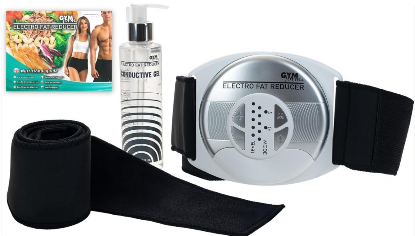
Image 1.1: Overview of the Gymform Electro Fat Reducer kit, showing the main device, two black elastic bands, a bottle of conductive gel, and a nutritional guide booklet.