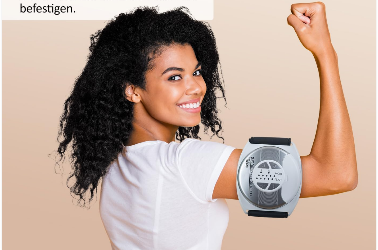
Image 5.1: A woman demonstrating the Gymform Electro Fat Reducer attached to her upper arm, illustrating its use for muscle building in that area.

Für einen schnelleren Muskelaufbau können Sie das Gerät an Ihren Arm befestigen.