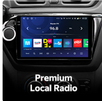
Figure 5.1: Premium Local Radio Interface

The system functions as a comprehensive multimedia player, supporting various audio and video formats. Enjoy premium local radio with RDS support. The audio output mode is stereo, providing a rich sound experience.