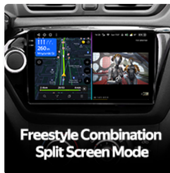
Freestyle Combination Split Screen Mode