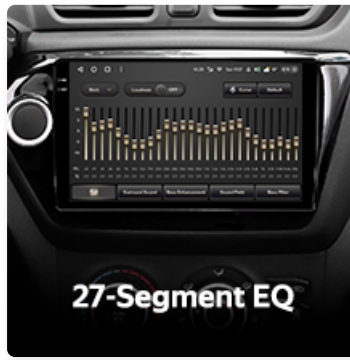
Figure 5.3: 27-Segment Equalizer