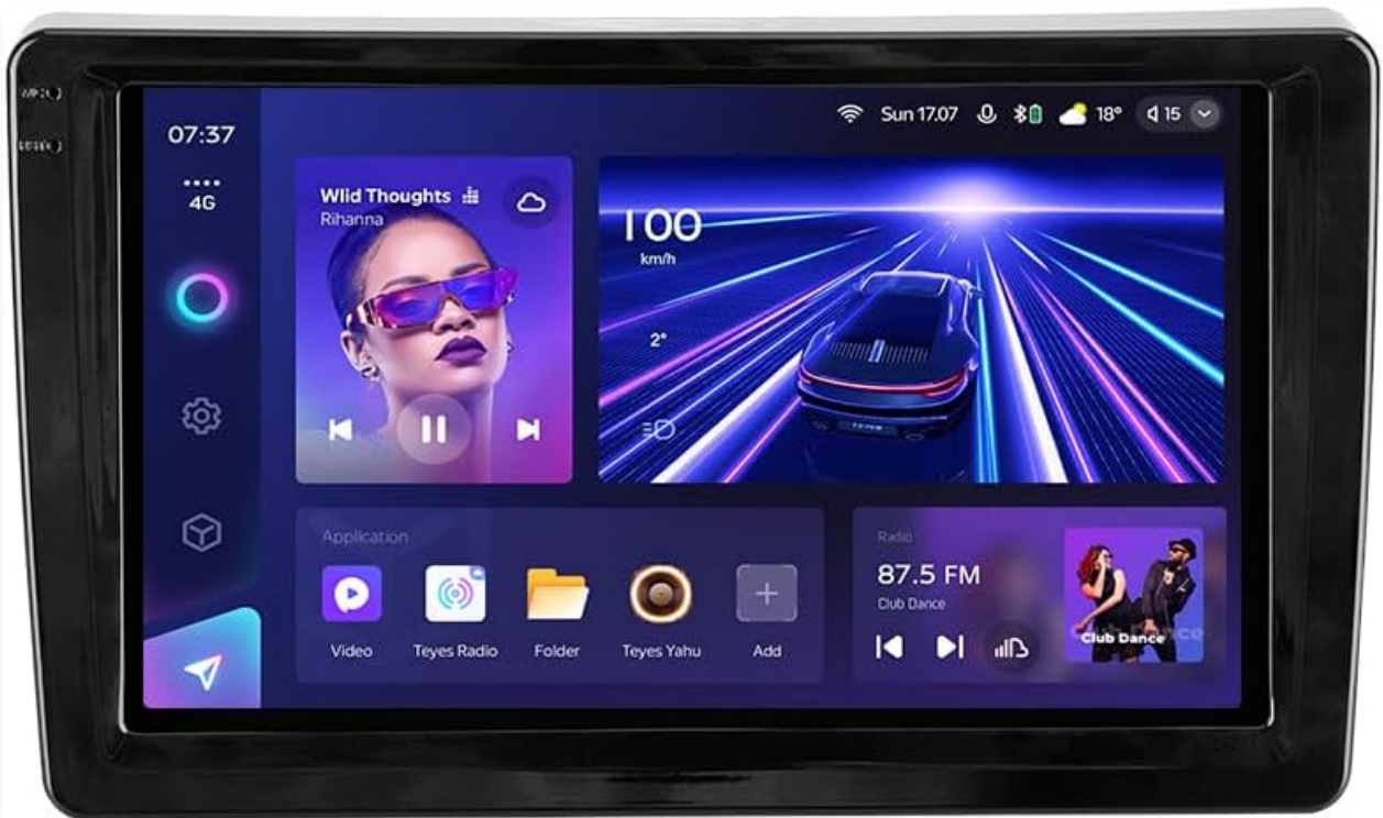
Figure 1.1: TEYES CC3 2K Head Unit Interface

The TEYES CC3 2K is an advanced car radio multimedia system designed to enhance your driving experience with cutting-edge technology. Featuring a high-resolution 2K in-cell display, Android 10 operating system, and comprehensive navigation capabilities, this head unit integrates seamlessly into compatible vehicles, offering superior audio-visual performance and smart connectivity. This manual provides detailed instructions for installation, operation, maintenance, and troubleshooting.