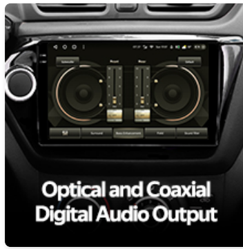
Optical and Coaxial Digital Audio Output