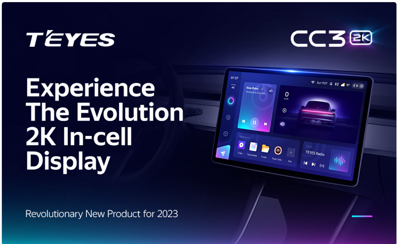
2K In-cell Display