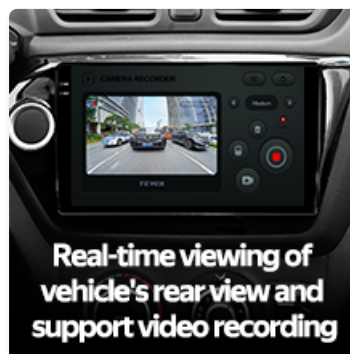
Real-time Rear View & Video Recording