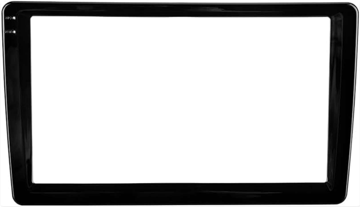
Figure 2.1: TEYES CC3 2K Package Contents