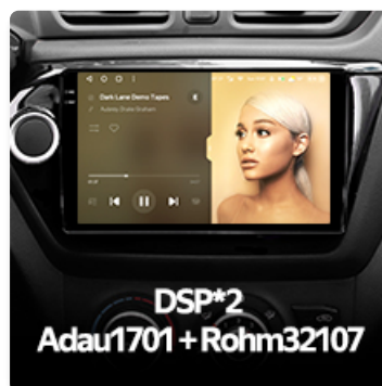
Figure 5.2: Dual DSP Audio Processing

Fine-tune your audio experience with the dual DSP (ADAU1701 + ROHM32107) and a 27-segment equalizer. The system also features optical and coaxial digital audio output for high-fidelity sound.