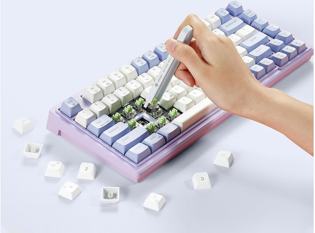
Image: A hand using a switch puller to remove a hot-swappable switch from the Hexgears M2 keyboard.

Enhanced Keystroke Smoothness & Reduced Friction 5-Pin Sockets, Pre-Lubed Linear Switches & Stabilizers