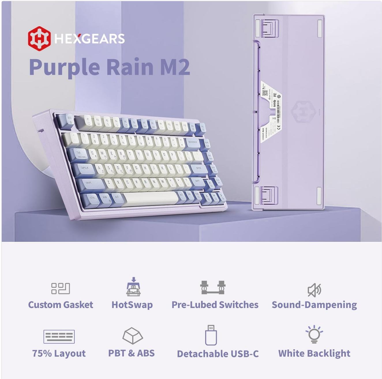
Image: The Hexgears M2 keyboard illuminated with its white backlight, enhancing the aesthetic of a workspace.

The keyboard features a white backlight. You can adjust lighting patterns and brightness using the FN key combinations or through the dedicated software (if available). The software allows for extensive customization of lighting effects.