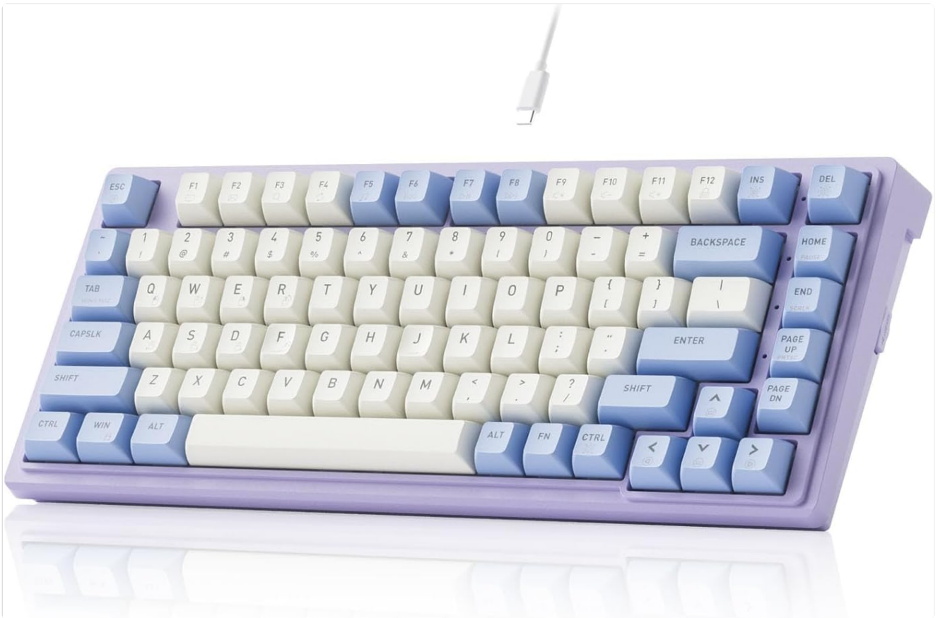
Image: The Hexgears M2 keyboard in purple and white, with its detachable USB-C cable shown above it.