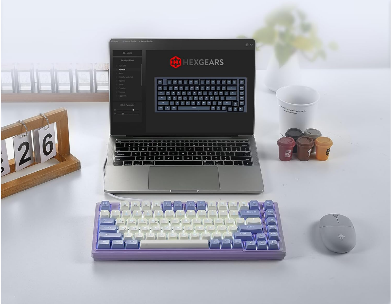
Image: The Hexgears M2 keyboard shown with a laptop displaying the macro configuration software interface.

Create Key Shortcuts for Work Tasks & Gaming