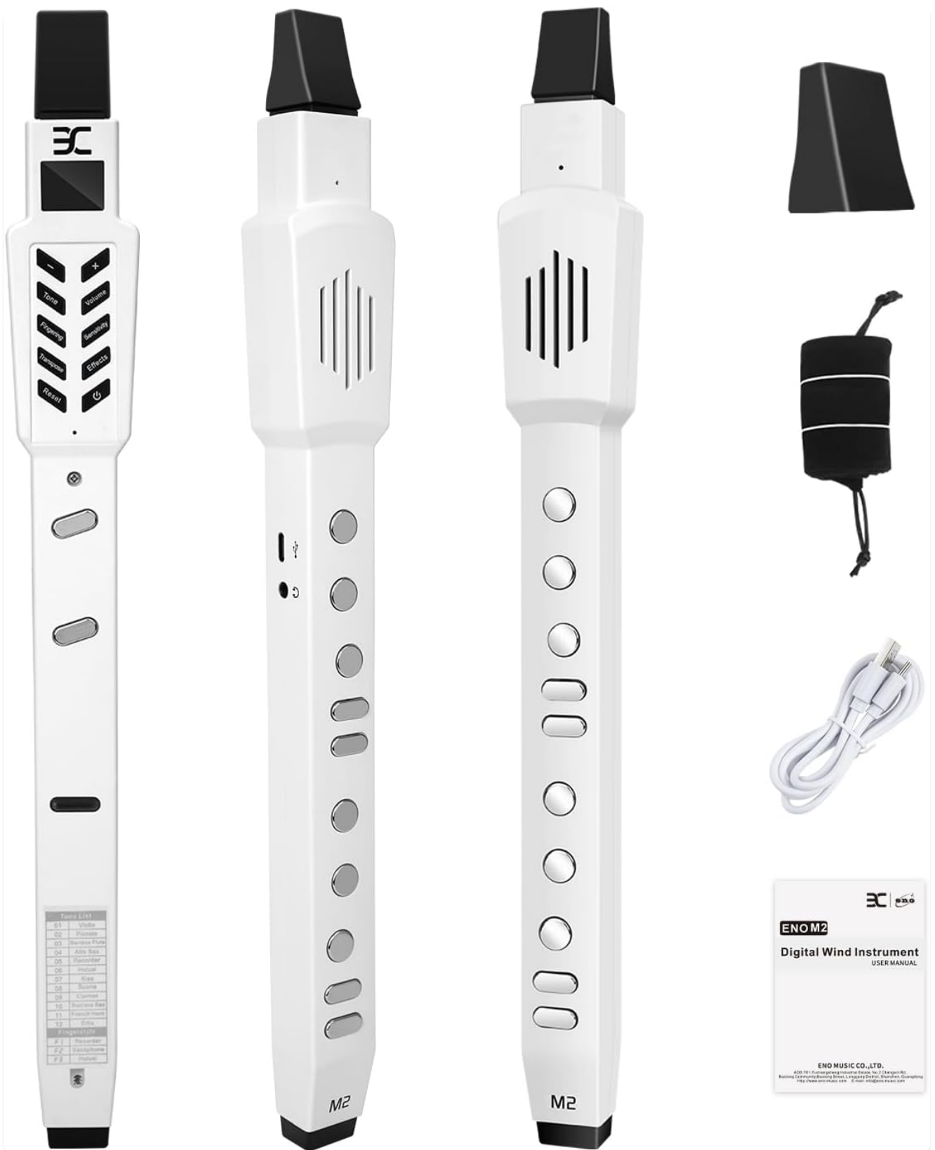
Image: The EX Digital Wind Instrument M2 shown with its complete set of accessories, including the instrument itself, a protective mouthpiece cover, a USB-C charging cable, a soft carrying pouch, and the user manual.