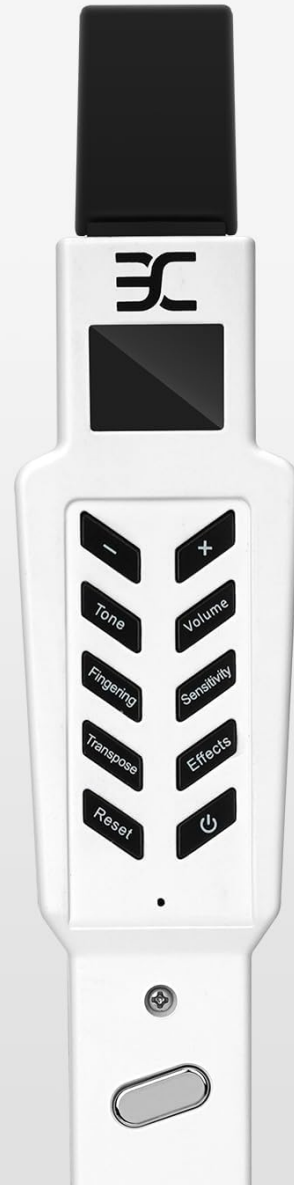
Image: A visual representation of the 12 available tone options on the EX Digital Wind Instrument M2, including various wind and string instrument sounds.