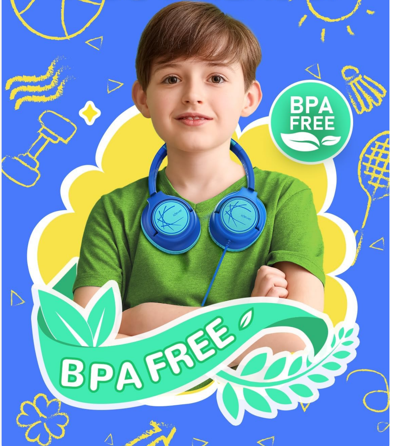
Image: A child wearing the headphones, emphasizing their BPA-free and kid-friendly construction.