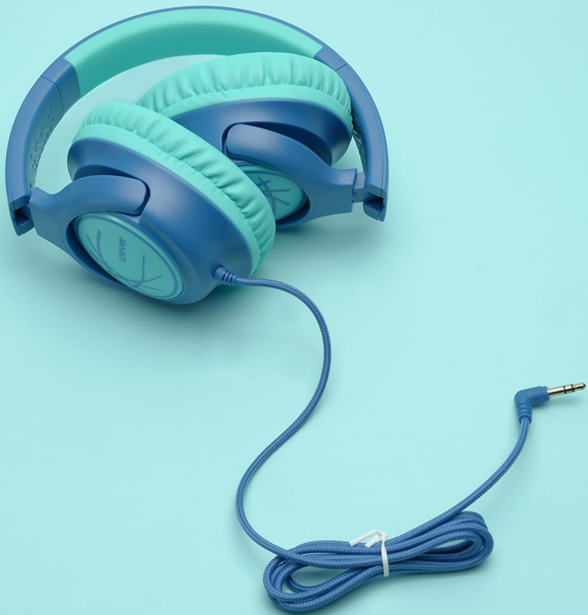
Image: The headphones folded, demonstrating their compact design for easy storage and transport.