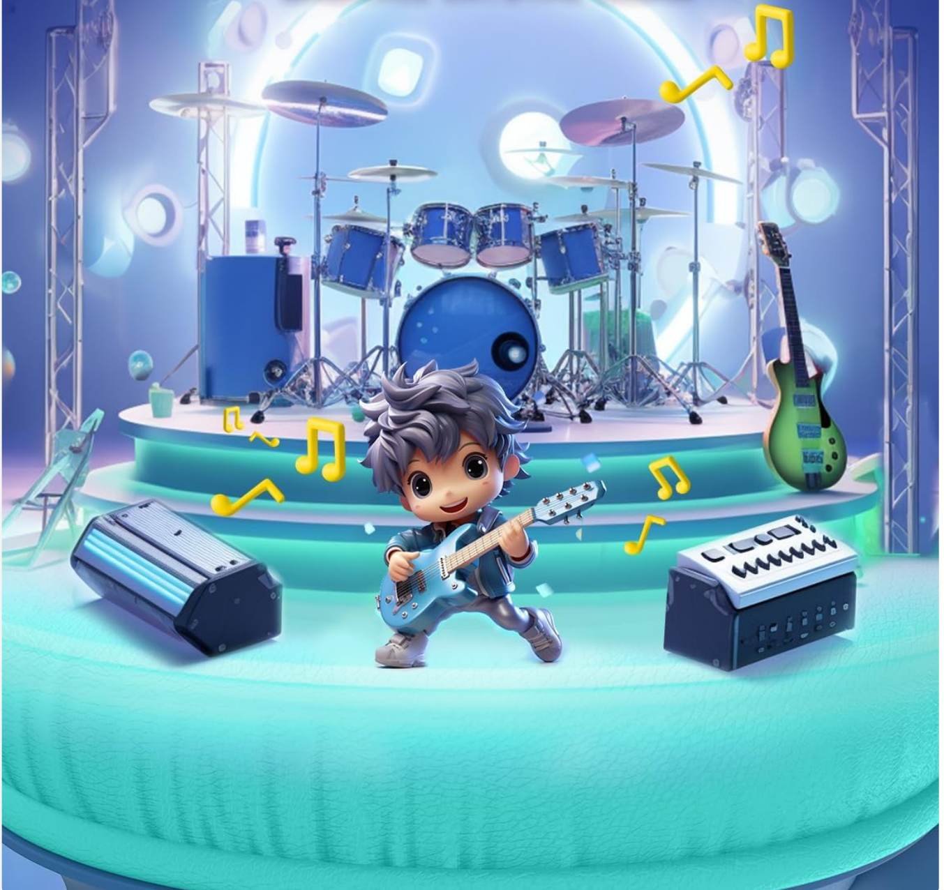
Image: An artistic representation emphasizing the premium stereo sound quality of the headphones.