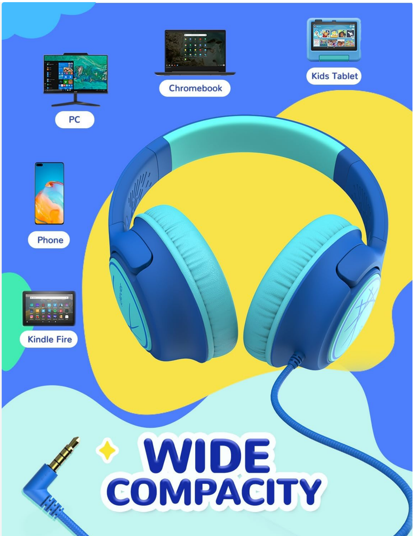
Image: The headphones with illustrations of various compatible devices, highlighting their wide compatibility via the 3.5mm jack.