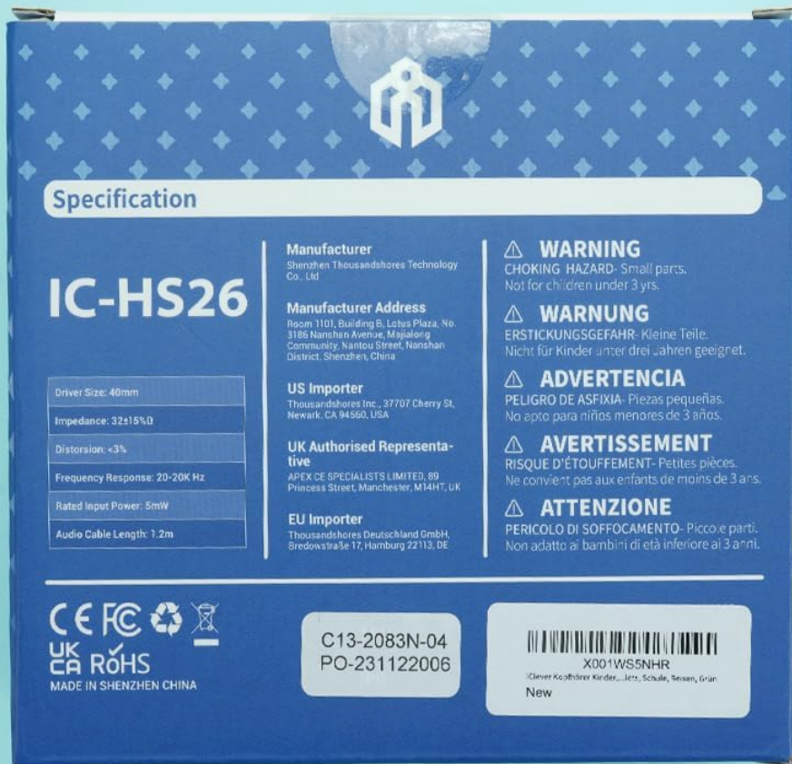
Image: The back of the product packaging, detailing key specifications and warnings.

85dBA Safe Volume Tech, Foldable, Adjustable, Tangle-Free Cord, Durable, Comfortable, HD Stereo Sound