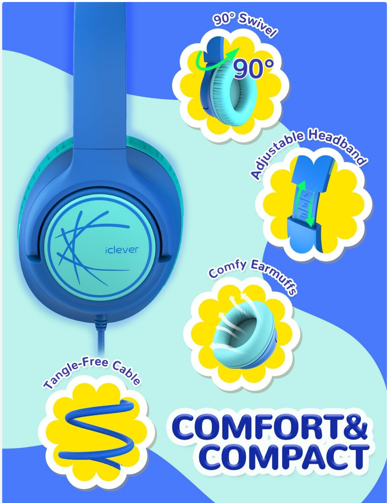
Image: A detailed view of the headphones, pointing out features like 90° swivel ear cups, adjustable headband, comfortable earmuffs, and a tangle-free cable.