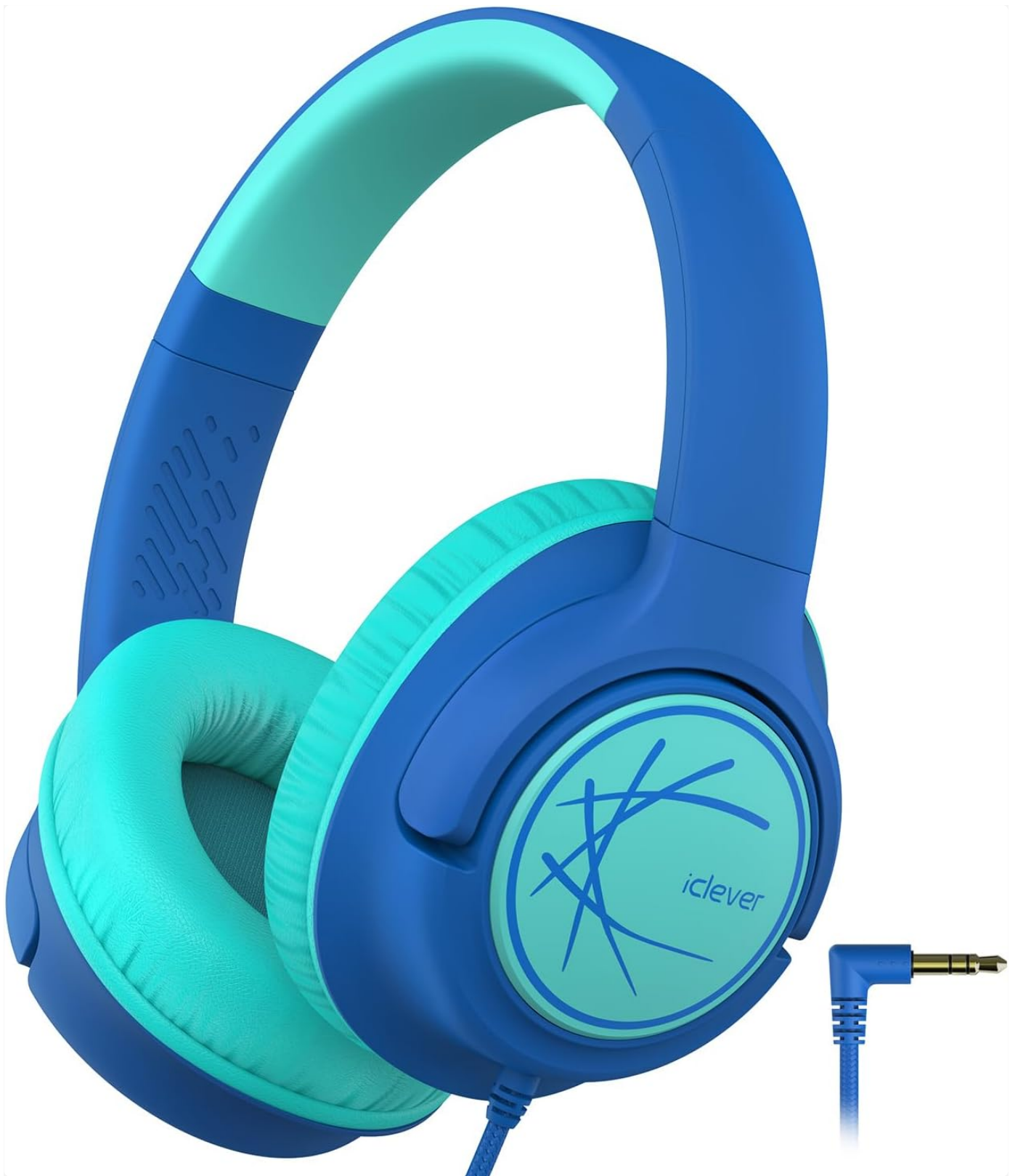
Image: The iClever HS26 headphones, highlighting their comfortable over-ear design and the included 3.5mm audio jack.