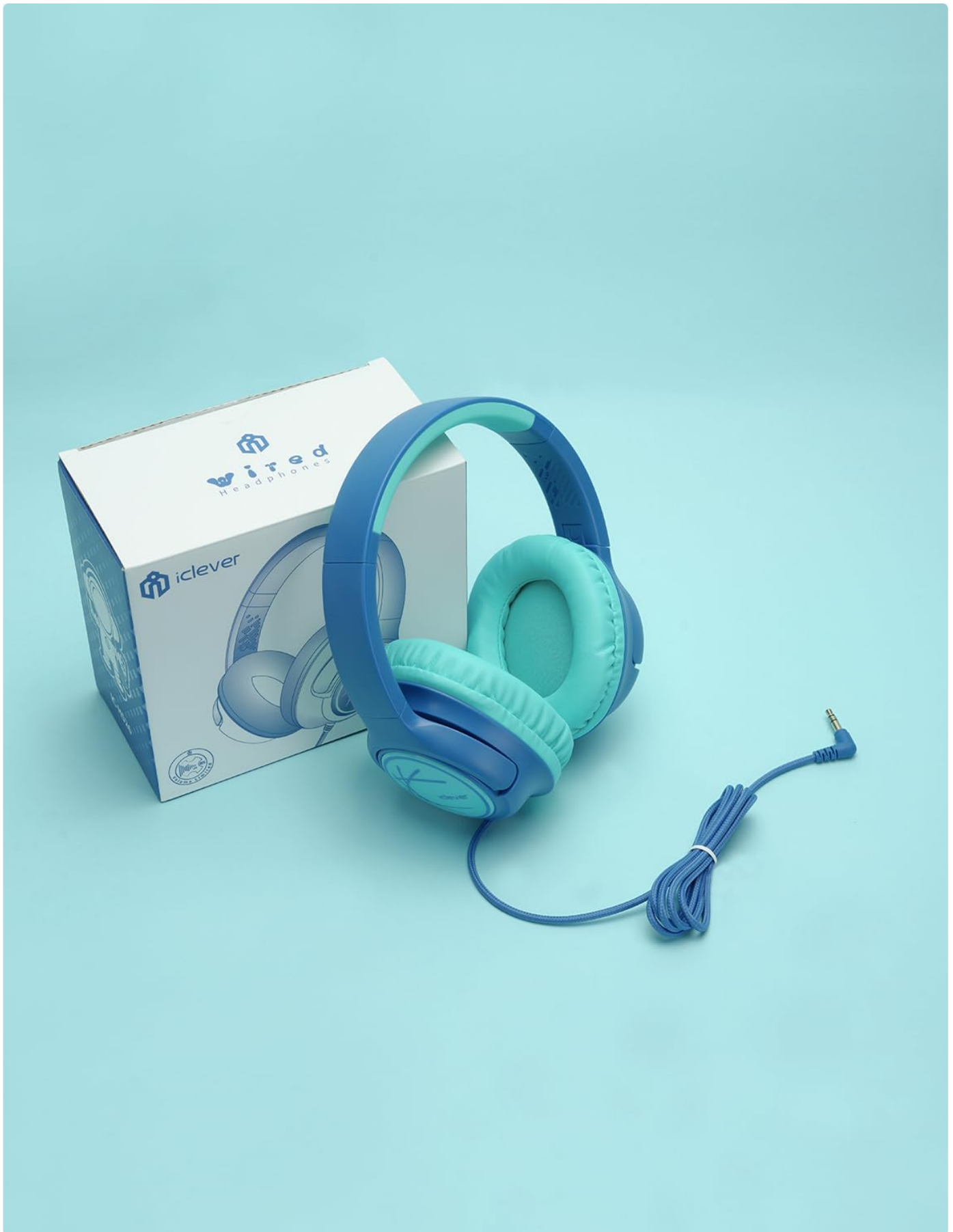
Image: The iClever HS26 headphones displayed next to their retail packaging, indicating what is included in the box.