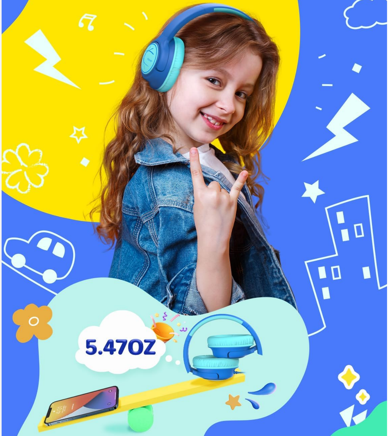
Image: A young girl wearing the headphones, highlighting their ultralight design for comfortable long-term use.