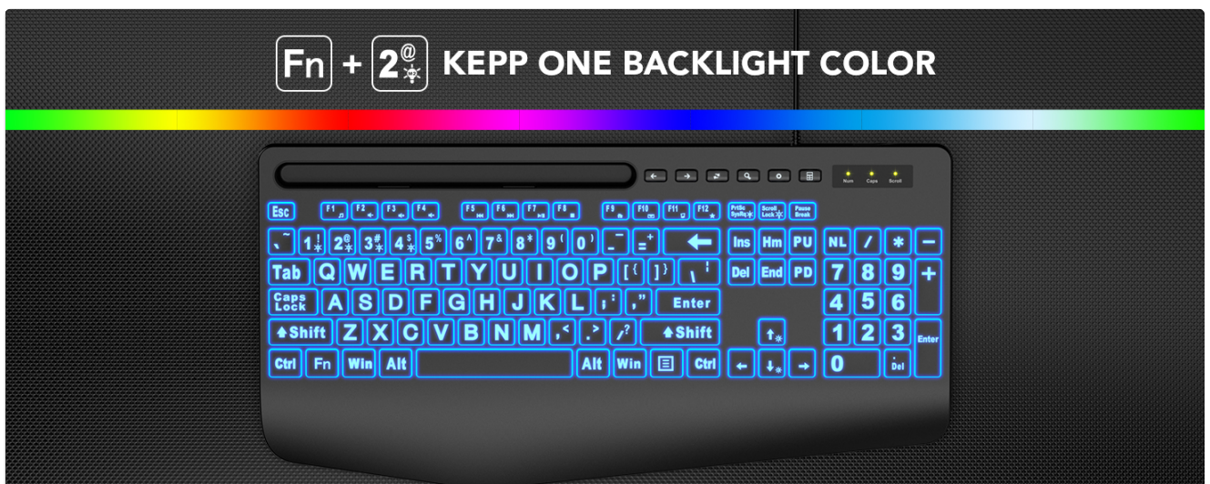
Image: Diagram showing the keyboard with a blue backlight and the instruction "Fn + 2 Keep One Backlight Color", indicating the key