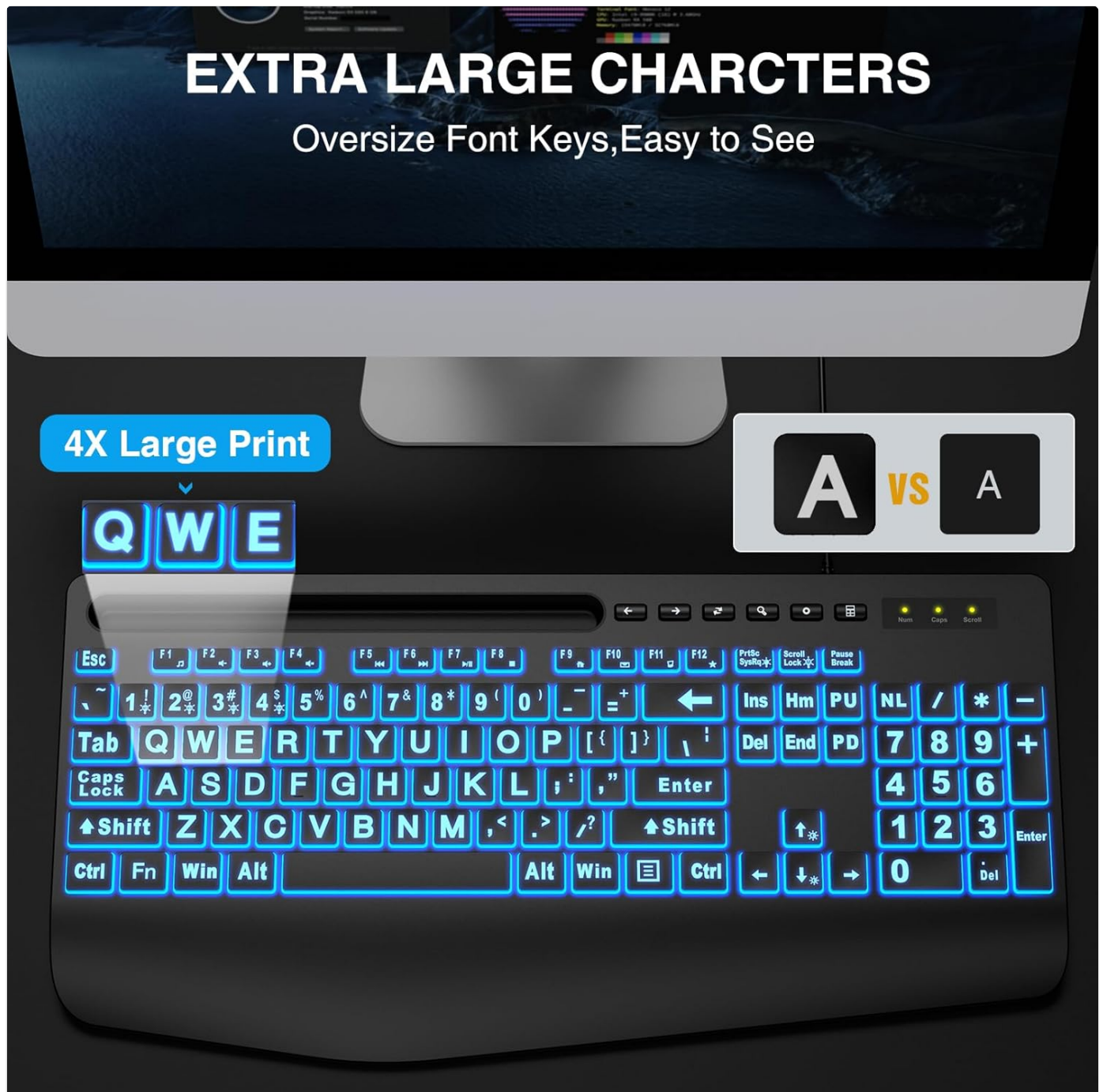
Image: Close-up view of the SABLUTE keyboard highlighting the extra-large characters on the keys, designed for easy visibility and reduced typing errors.

The keyboard functions as a standard QWERTY keyboard. The large print keys are designed to reduce typing errors and eye strain.