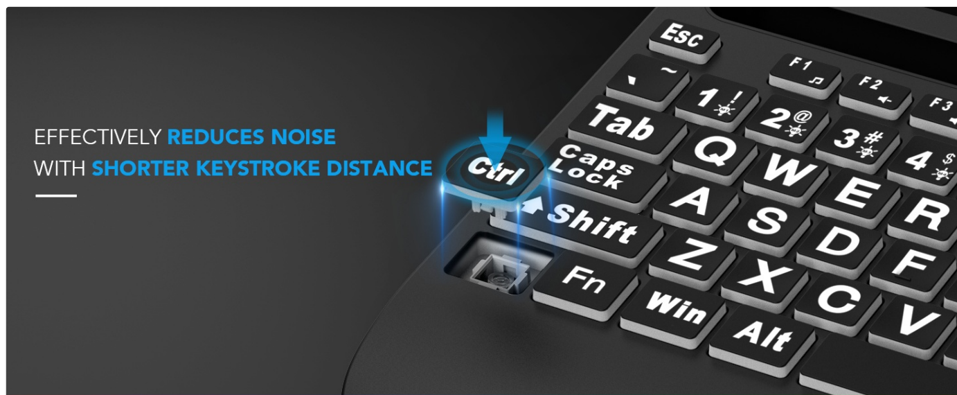
Image: A close-up diagram of a keyboard key, with an arrow pointing down, indicating that shorter keystroke distance effectively reduces noise.

The keyboard is engineered with a shorter keystroke distance, which effectively reduces typing noise, making it suitable for quiet environments.