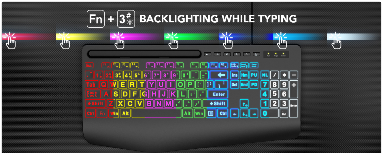
Image: Diagram showing the keyboard with keys lighting up in various colors as if being typed on, with the instruction "Fn + 3 Backlighting While Typing".