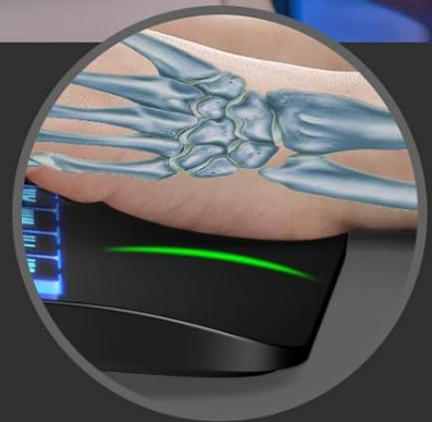
Image: A person's hands positioned comfortably on the SABLUTE keyboard, illustrating the ergonomic design and wrist rest that helps keep hands level.