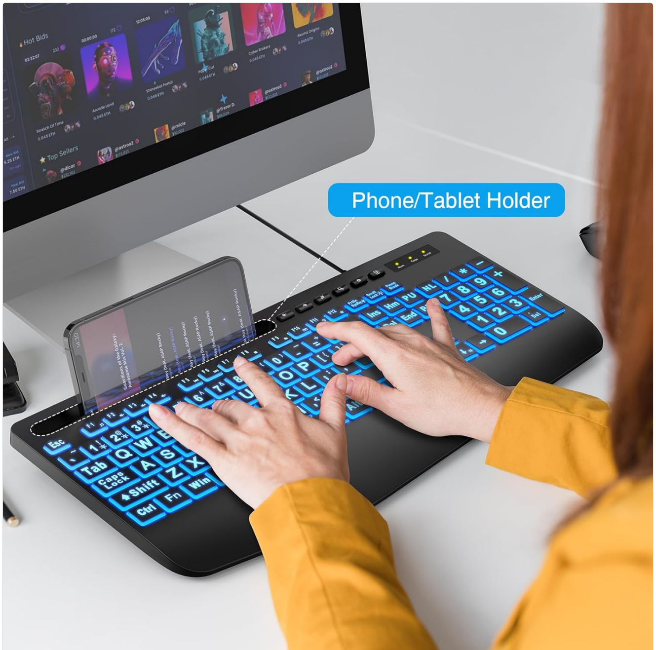
Image: A user typing on the SABLUTE keyboard with a smartphone placed vertically in the integrated holder, highlighting the convenience of the phone/tablet slot.