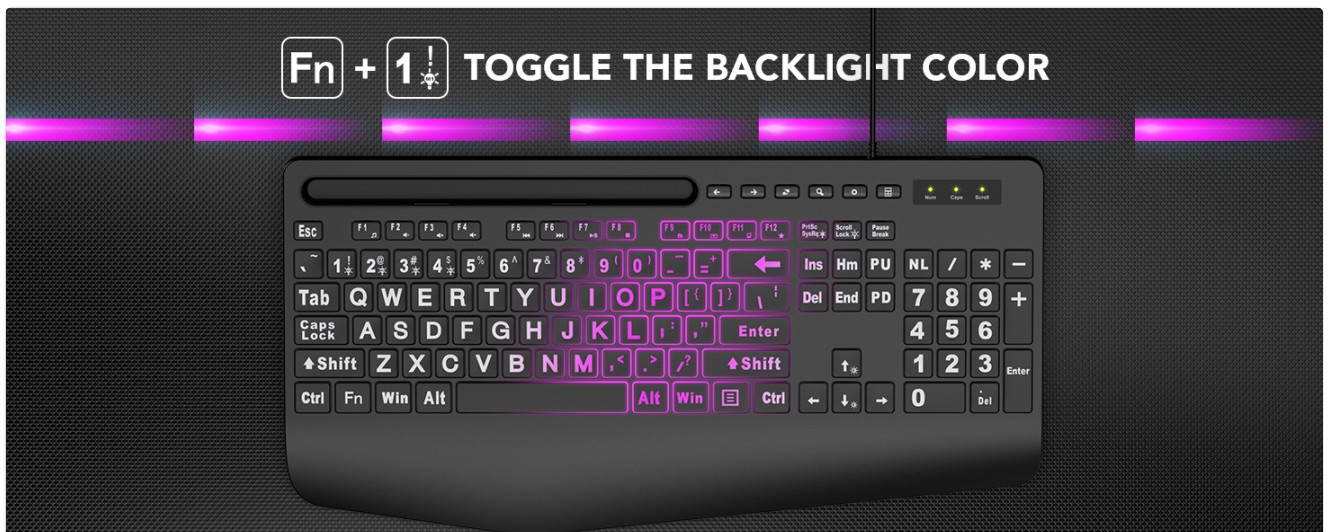
Image: Diagram showing the keyboard with a purple backlight and the instruction "Fn + 1 Toggle the Backlight Color", indicating the key combination for changing colors.