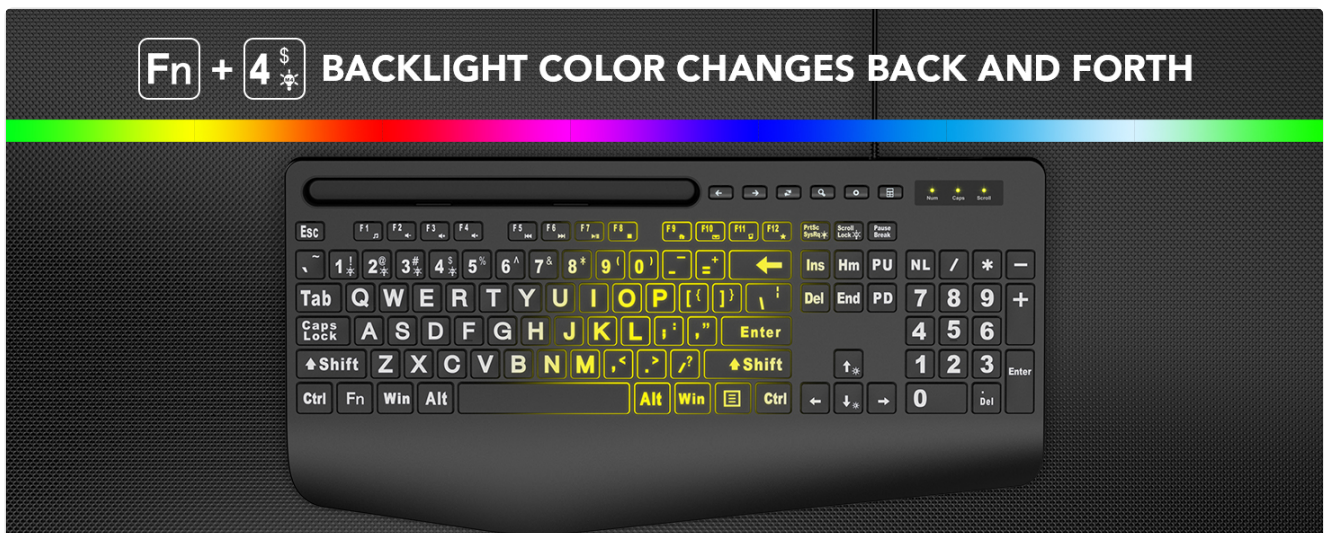
Image: Diagram showing the keyboard with a yellow backlight and the instruction "Fn + 4 Backlight Color Changes Back and Forth", indicating a dynamic color mode.