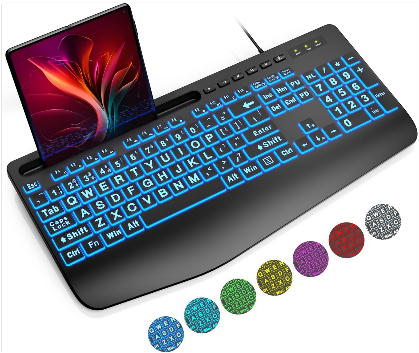
Image: The SABLUTE Large Print Backlit Keyboard in black, featuring large, illuminated keys and a built-in slot holding a tablet, demonstrating its design and functionality.