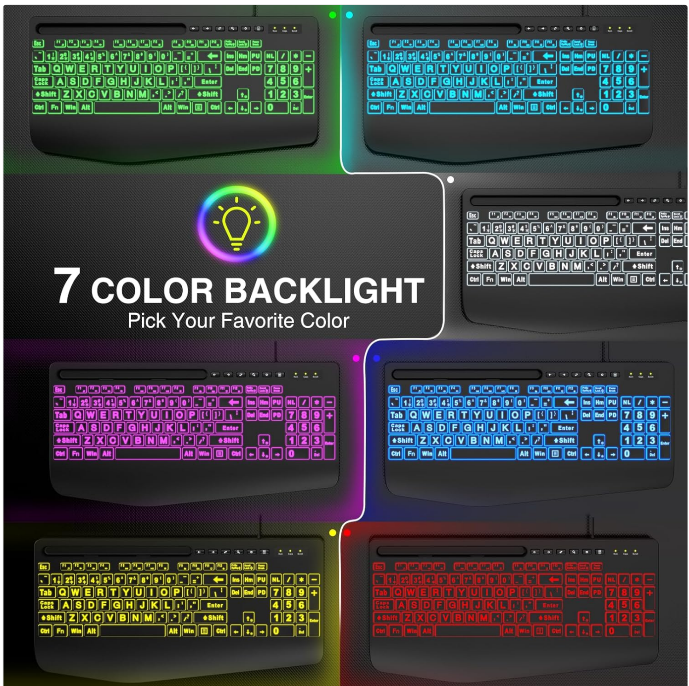
Image: A collage showing the SABLUTE keyboard illuminated in seven different colors, demonstrating the customizable backlight feature.