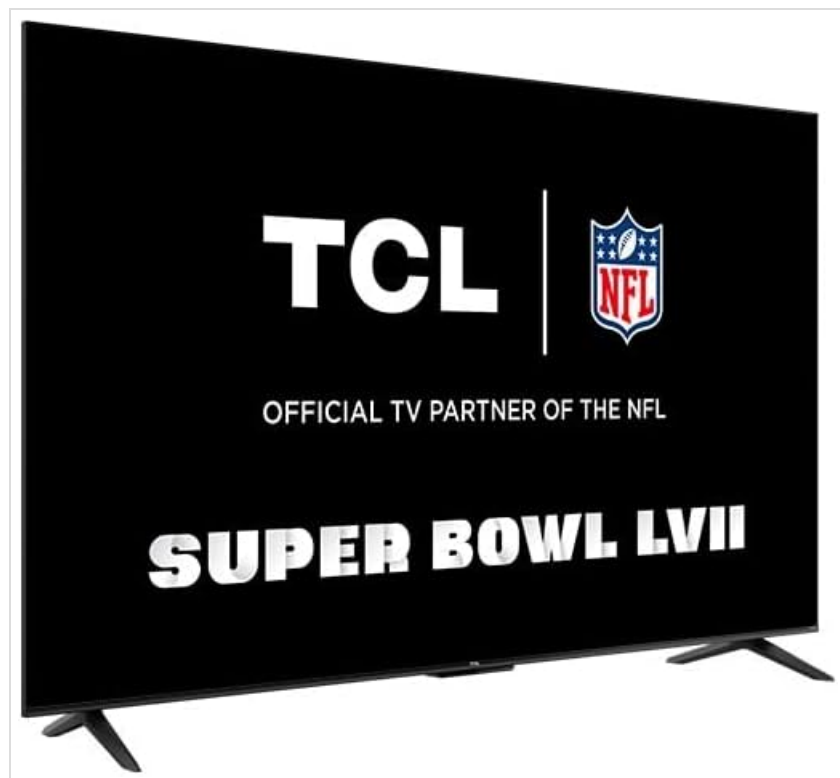
Image: Front view of the TCL 65S41 television with its two stand feet attached, showing the screen and the TCL logo at the bottom center.