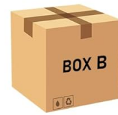
Image: The product is delivered in two separate boxes, labeled Box A and Box B, which may arrive on different days.