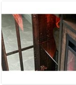
Image: A circular cutout on the back panel for cable organization.