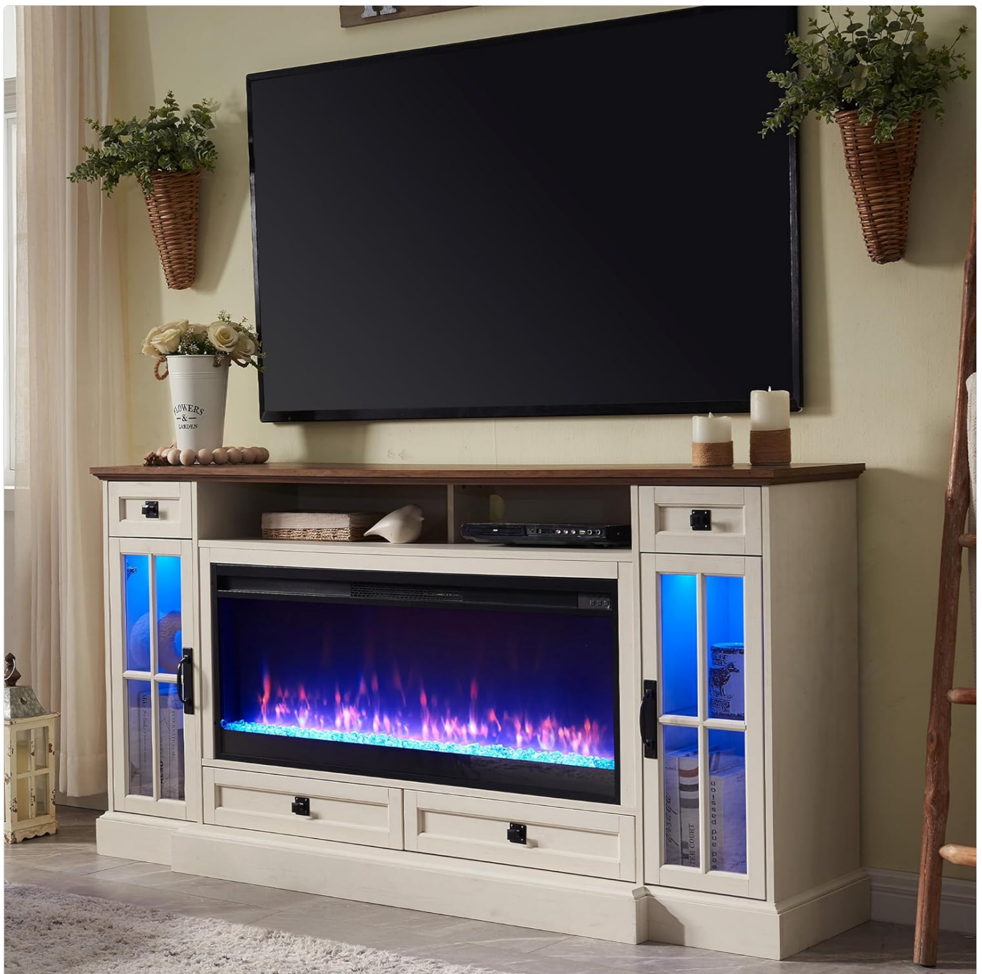
Image: The OKD Fireplace TV Stand in Antique White, featuring a 42-inch electric fireplace with blue flames and LED-lit side cabinets. A large television is placed on top of the stand.