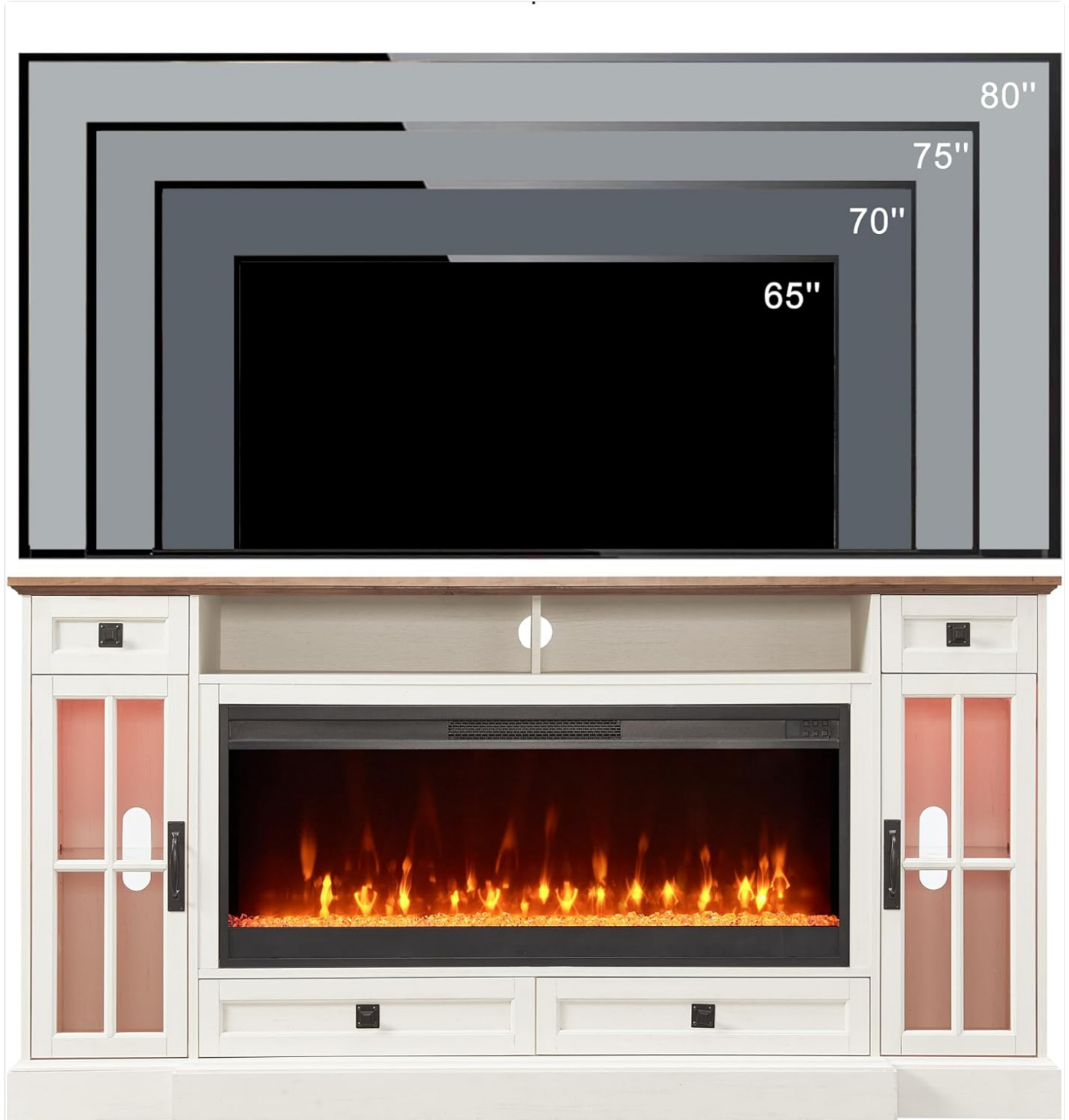
Image: A visual guide demonstrating the compatibility of the TV stand with televisions up to 80 inches in size.