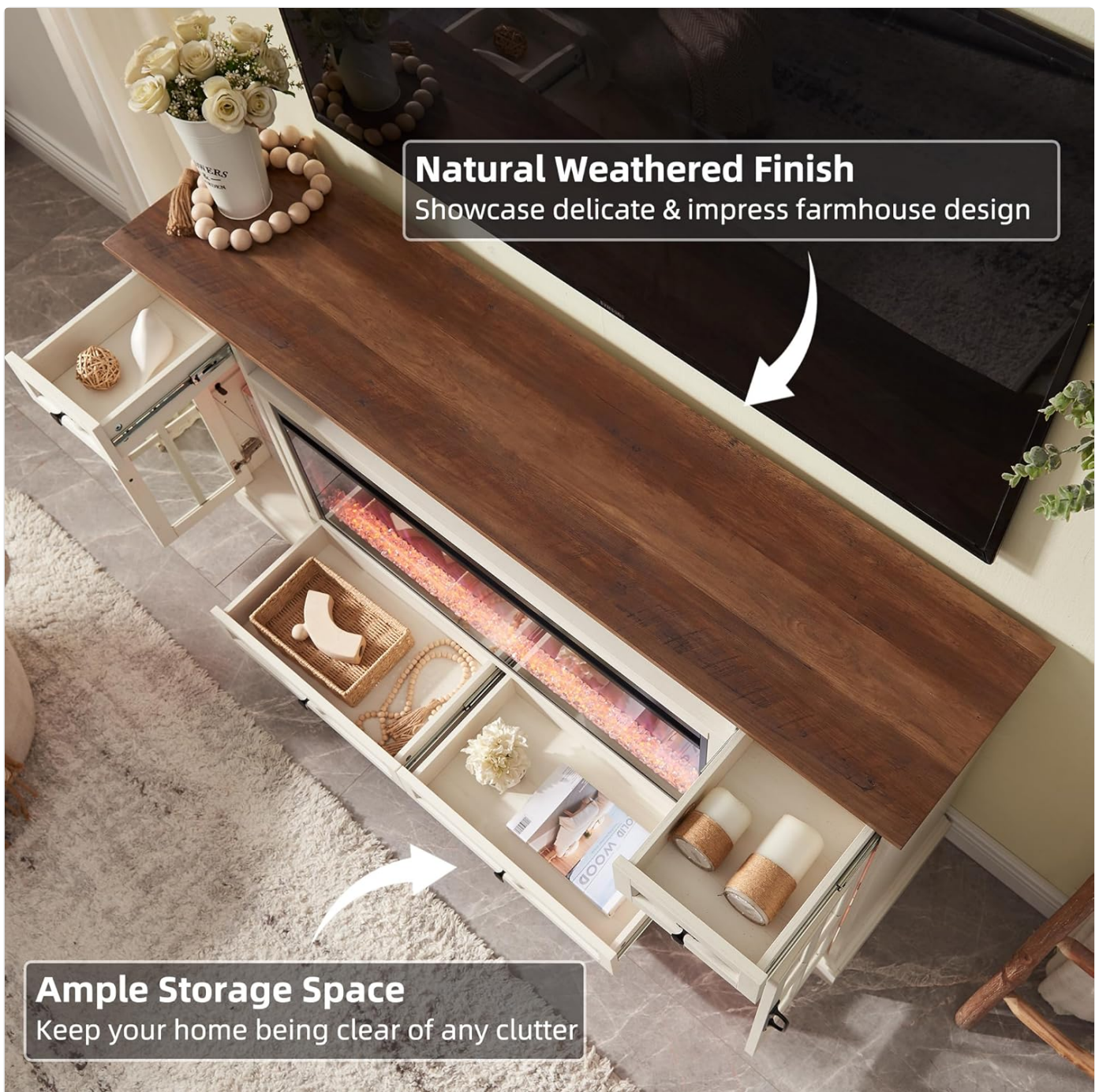
Image: An overhead view of the TV stand with drawers and cabinets open, demonstrating the ample storage capacity. The natural weathered finish of the top surface is also visible.